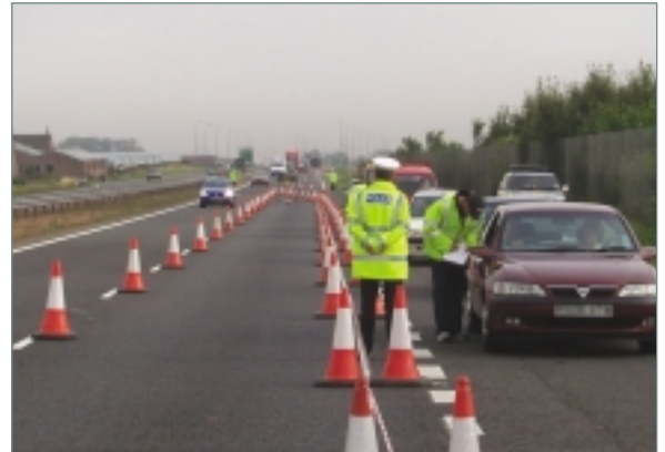
A90(T), north of Dundee