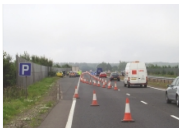
A90(T), north of Dundee

Adherence to the advice contained within Volume 5 of the “Design Manual for Roads and Bridges”, Chapter 8 of the “Traffic Signs Manual”, and this guidance document will provide a comprehensive approach to the process of conducting roadside interview surveys in Scotland. Hopefully this will lead to a shared understanding of the procedures involved resulting in a co-ordinated and standardised approach to the police participation in this valuable area of work. These guidelines have been developed around current good practice and should help to build upon existing positive relationships.