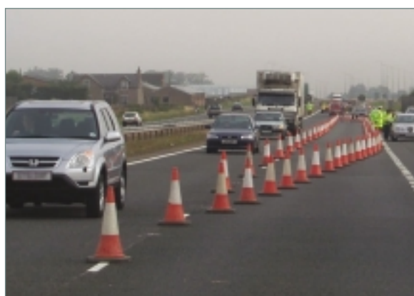
A90(T), north of Dundee