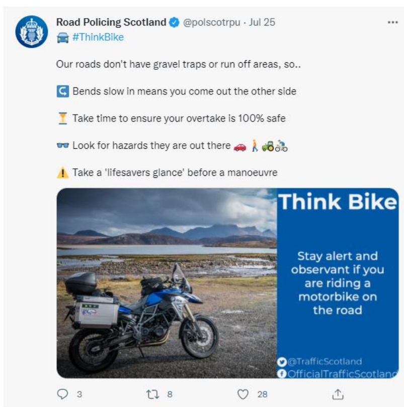
Figure 5: Police Scotland, 2021. #Think Bike. Twitter, 25 July. Available at: https://bit.ly/3zSncWU [Accessed 13 August 2021].

It should be noted that this guidance is also supported by appropriate messaging across social media channels, particularly at the start of the biking season (Spring) and at regular intervals throughout the biking season. For example: