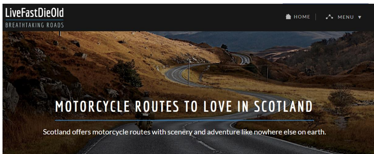
Figure 3: Live Fast Die Old landing page.

'Live Fast Die Old' is a Road Safety Scotland initiative intended to promote safe riding across Scotland's rural road network. Operational since 2015, what has been described by motorcycle journalists as a 'cool road safety campaign' (Visordown 2019) combines riding tips with 'breathtaking' routes across Scotland to engage motorcyclists with the underlying road safety message. Road Safety Scotland's Michael McDonnell stated that, 'We understand the thrill of biking and don't want to take that away, but we want to ensure that groups of motorcyclists are looking out for each other on the road and practicing safe manoeuvres together' (Visordown 2019).