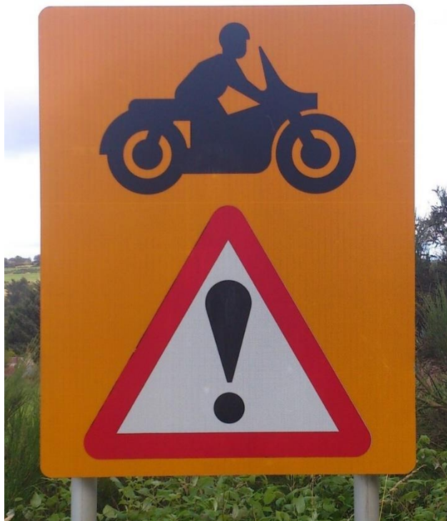
Figure 1: Example of signage located on A93 and B974

The signage was initially installed as a temporary road safety measure. However, 20 years later, the signs remain in place and have become a permanent feature of the road side infrastructure on these routes.