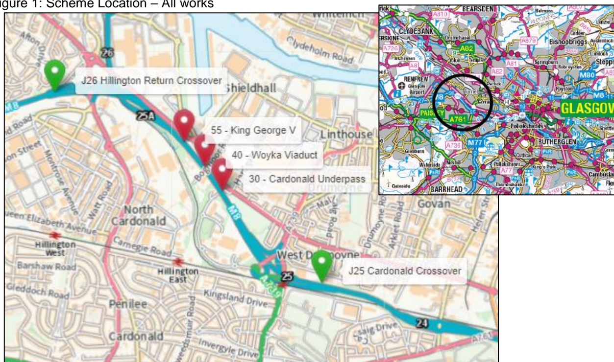
Figure 1: Scheme Location – All works