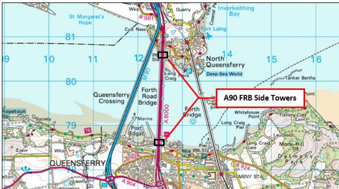
Figure 1. A90 FRB Side Towers.

The scheme is located on the FRB which spans the Firth of Forth, connecting South Queensferry to North Queensferry (Figure 1).