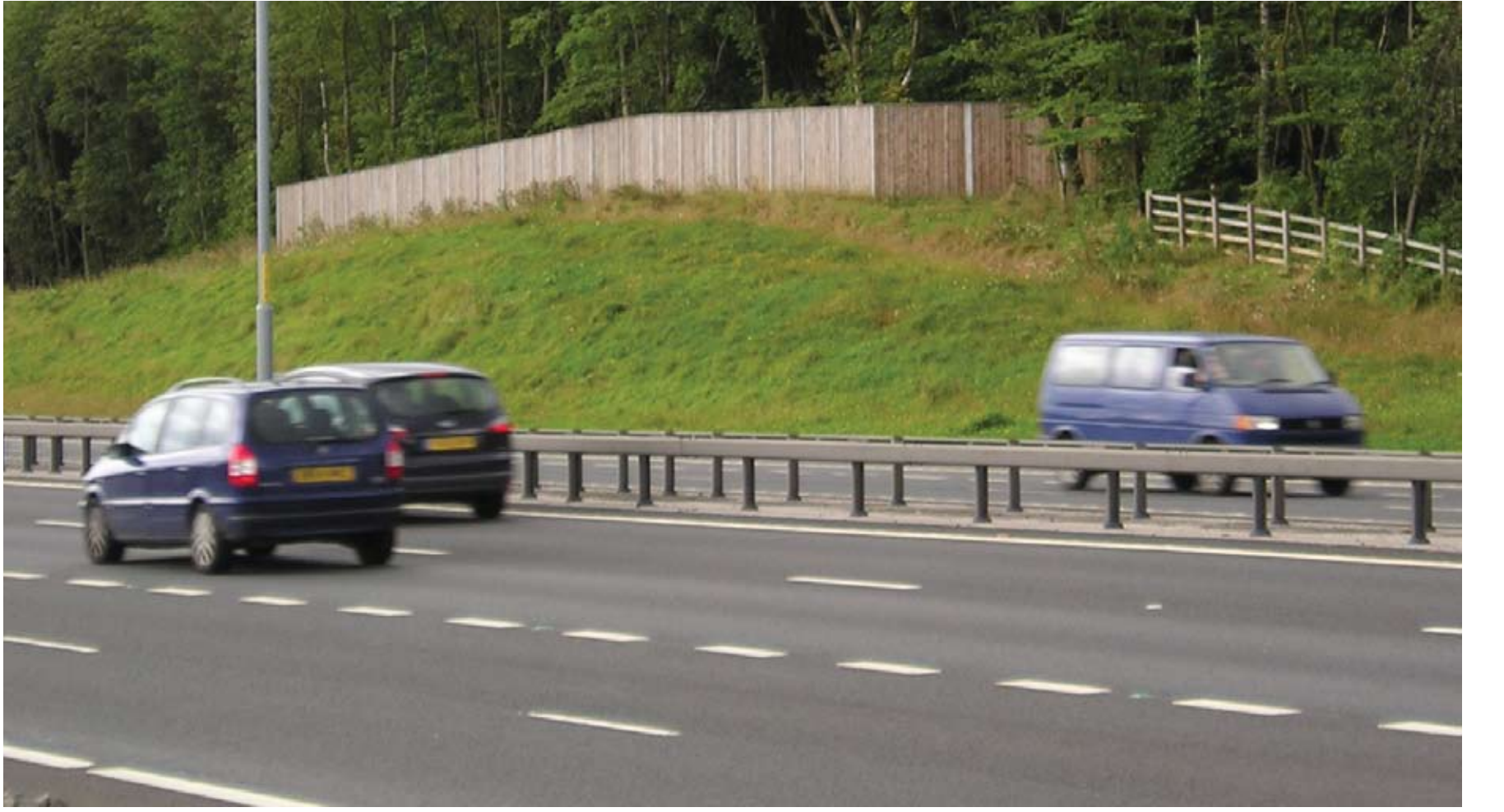
EXAMPLE OF TIMBER NOISE BARRIER