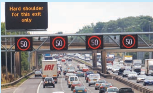
Use of Active Traffic Management on the M42.

Current road connections to the existing bridge operate satisfactorily for the majority of the day but suffer from congestion and significant queuing at peak periods. The implementation of an Intelligent Transport System is proposed from Halbeath Junction to the M9 to actively manage and improve the flow. This could include a broad spectrum of measures such as: