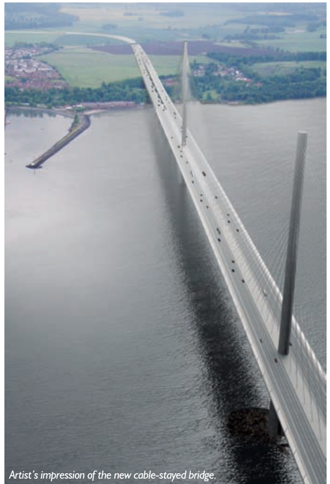
Artist's impression of the new cable-stayed bridge.

The existing bridge will be used to carry public transport, pedestrians and cyclists. This public transport corridor will be dedicated to buses and taxis initially but has the potential to be adapted to carry a Light Rapid Transit system, such as a tram, should it be required in the future. Hard shoulders on the new bridge would carry buses in the event of high winds or closures on the existing Forth Road Bridge.