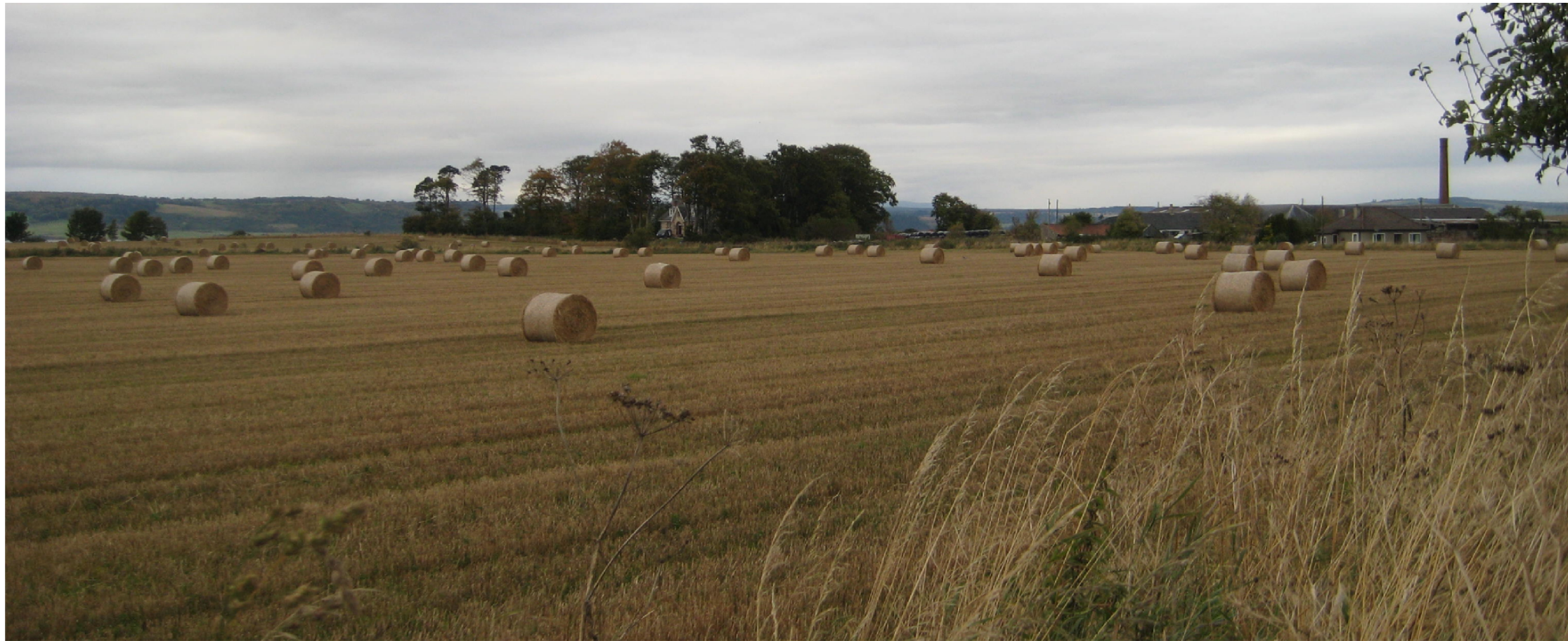
LLCA Viewpoint 1 - Typical view of the Culloden Estate Farmlands LLCA - View from Allanfearn looking north - Photo taken 19/10/2015