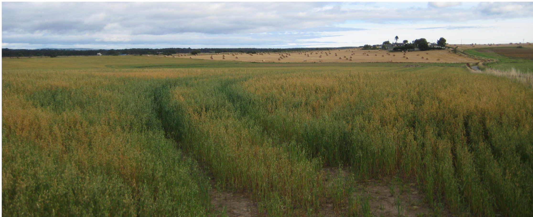
LLCA Viewpoint 2 - Typical view of the Open Coastal Lowland LLCA - View from Milton of Gollanfield looking north-east - Photo taken 15/09/2015