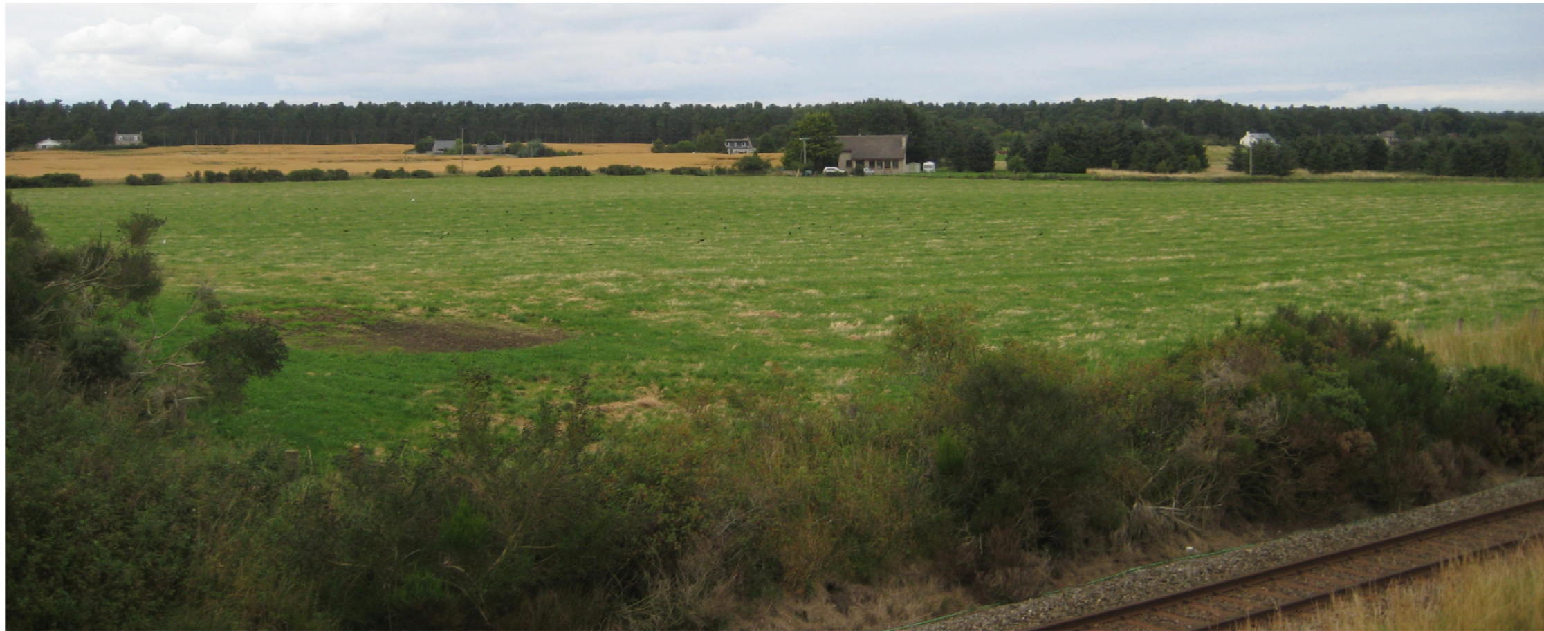
LLCA Viewpoint 7 - Typical view of the Enclosed Forest Edge Farmland LLCA - View north-east from railway bridge south of Mardon House - Photo taken 14/09/2015