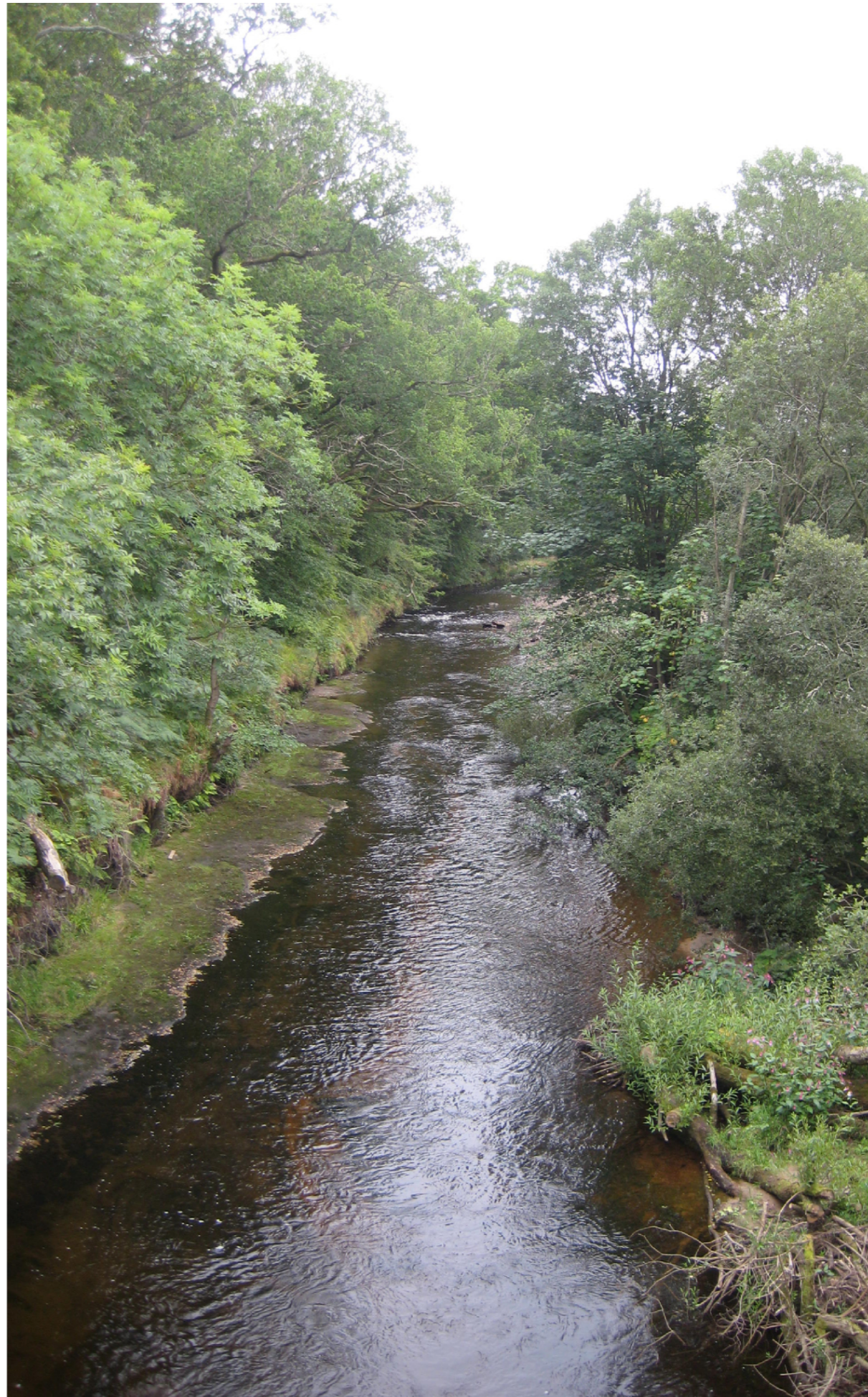
LLCA Viewpoint 8b - Typical view of the River Nairn Corridor LLCA - View south from the Howford Bridge - Photo taken 14/09/2015