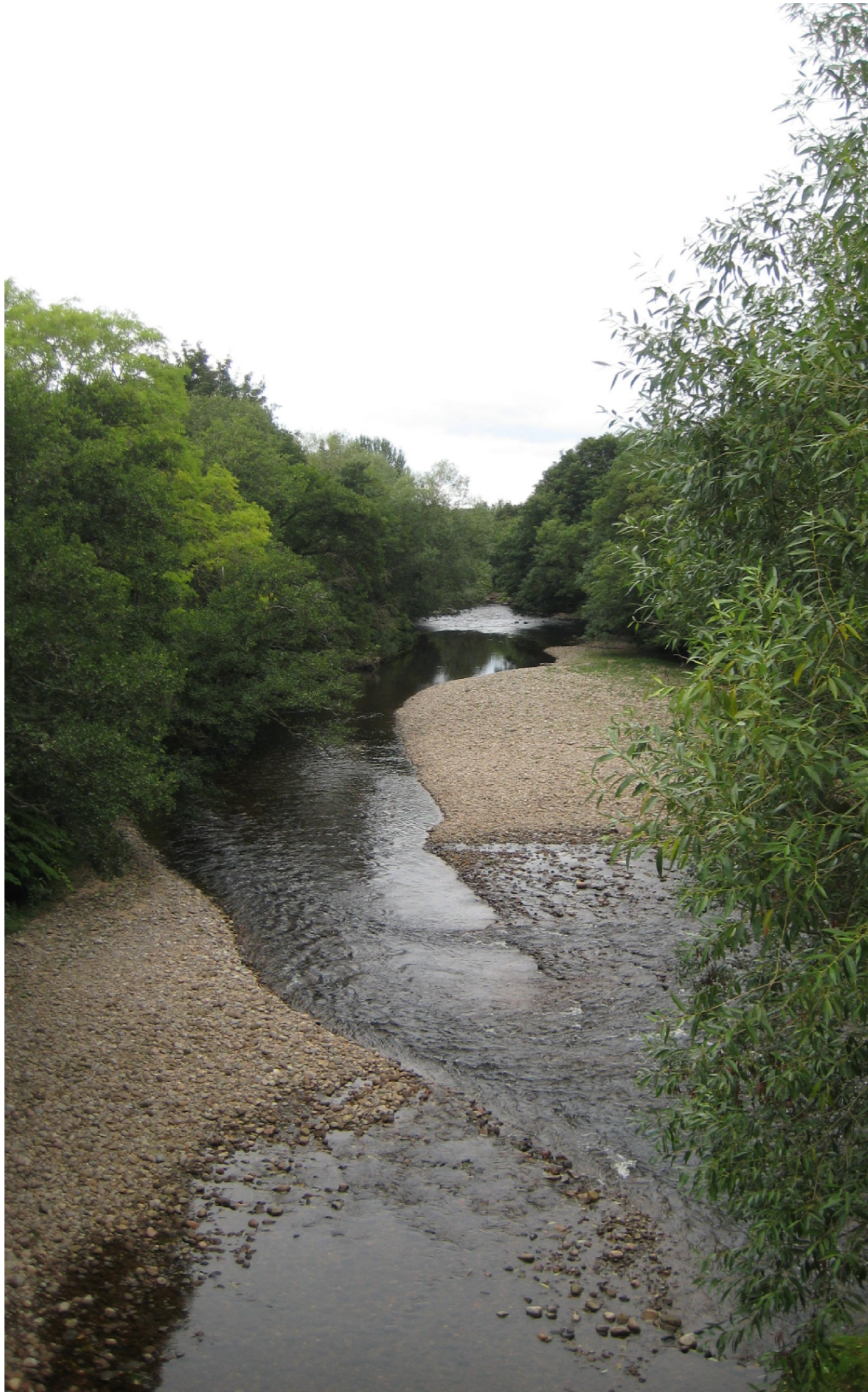
LLCA Viewpoint 8a - Typical view of the River Nairn Corridor LLCA - View north from the Howford Bridge - Photo taken 14/09/2015