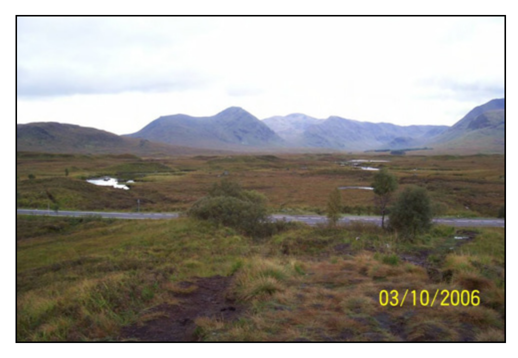
Figure 7.1 Catchment area for the River Ba devoid of extensive tree cover.

The bridge scheme sits within the River Ba Catchment (Figure 1), which is a sub-catchment within the River Tay catchment area, and drains an area approximately 40 km<sup>2</sup> (Figure 7.1). The waterlogged condition of the ground and the poor quality of the vegetation as grazing for stock has made most of the site unsuitable for agricultural use. However, there has been relatively intensive cattle grazing on the Moor in the past. Historically, it is likely that peat cutting took place in the vicinity of all bothies, including Ba Cottage. It is well documented that the moor supported an extensive cover of pine during the Holocene, however, due to human activities the Moor is now devoid of extensive natural tree cover (Figure 7.1). There are small pockets of plantation forestry within the Ba catchment.