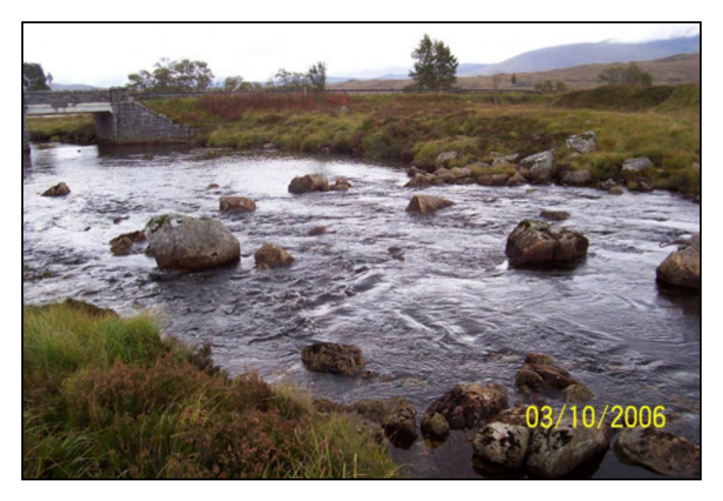
Figure 7.4 Rippled flow in River Ba immediately west of Ba Bridge