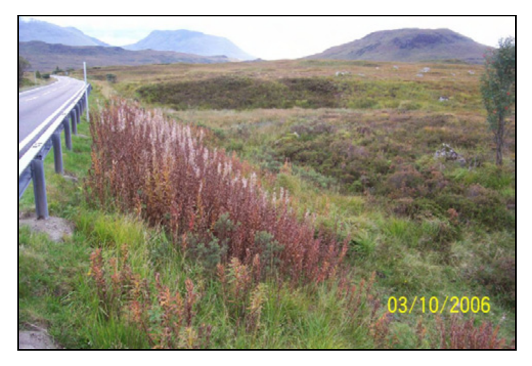
Figure 8.1 Semi-improved acid grassland verges with many species that would not be locally present without the embankment and road.

Wetland heath is the dominant habitat in the survey area. It is characteristic of NVC community M15 Scirpus cespitosa – Erica tetralix wet heath with a typical sub-community. This habitat was found to be of varying quality and has suffered from grazing pressure. Some areas are deemed to be of Regional importance (areas west of Ba Bridge) and other areas of National importance (areas east of Ba Bridge).