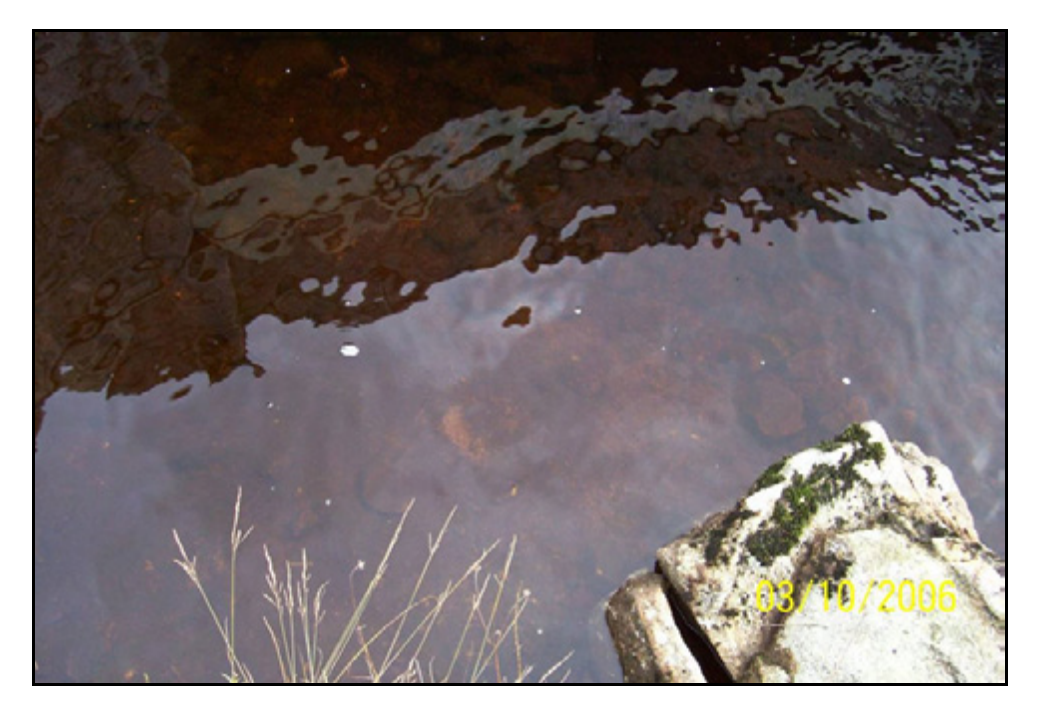
Figure 7.8 In-stream bed material.