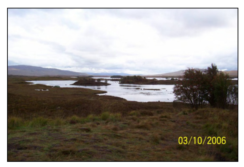
Figure 7.2 Loch Ba west of Ba Bridge.

To the west of the bridge is Lochan na Stainge and to the east is Loch Ba (Figure 7.2). Lochan na Stainge is an amalgamation of small lochans and anastomosing channels. It is approximately 1 km long and varies in width from 20 m to 769 m, with a maximum depth of 9.1 m (Murray and Pullar). Loch Ba is a much larger loch with several islands. Its' length is approximately 4 km and its width ranges from 30 m to 1200 m, with a maximum depth of 4.3m (Murray and Pullar). The bridge is closer to Loch Ba than to Lochan na Stainge, with the two lochs only separated by 500 m of river. They are known to be used for fishing and form part of a group of local lochs that support 4% of the British population of black-throated divers. Gavia arctica.