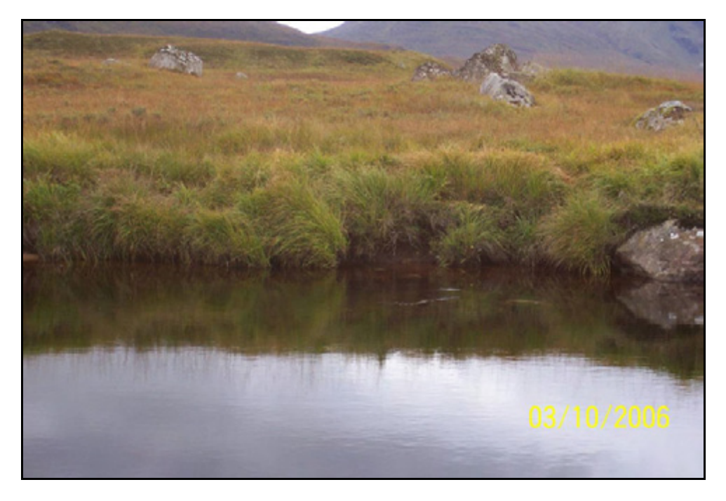
Figure 7.6 Vegetated river banks.