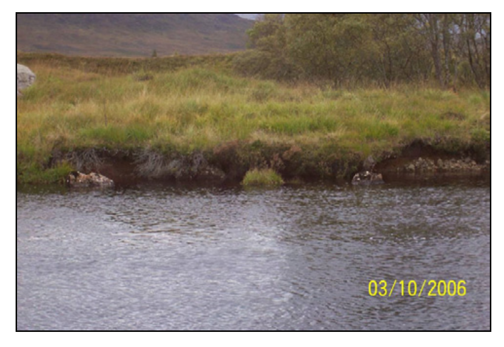
Figure 7.7 Bank material, comprising till underlying an organic soil.