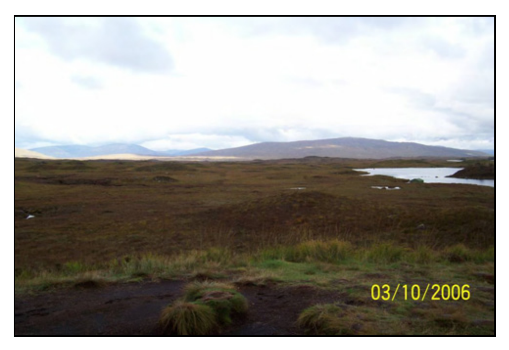
Figure 6.2 The vast expanse of Rannoch Moor blanketed with deglaciation features such as moraines and drumlins.

Rannoch Moor is important geomorphologically because it is believed to be, or be dose to, the centre of ice-sheet growth in the UK during the last maximum glaciation and Younger Dryas re-advance. Therefore, it exhibits important palaeo-ecological indicators of dimate change since deglaciation and glacial features associated with the deglaciation, such as moraines, drumlins and eskers (Figure 6.2). The area around Ba Bridge, which is only a very small area within Rannoch Moor, is characterised by large hummocky moraines or drumlins with associated hollows (Figure 6.3). The bridge sits in a flat, low area of ground between two hummocky moraines to the north and south that bound the area of proposed construction. Active geomorphology is confined to the River Ba and Loch Ba. Fluvial geomorphology is discussed further in Chapter 7 and Appendix B.