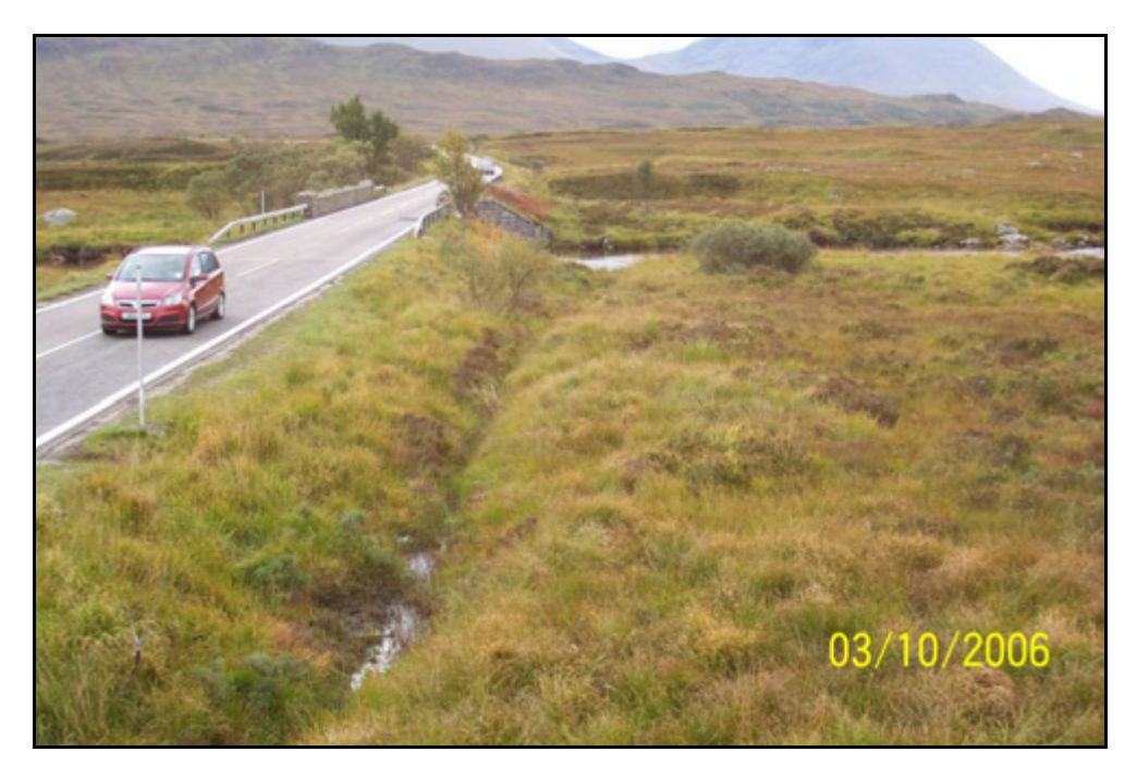
Figure 6.1 Road raised on embankment

The A82 runs approximately northwest to southeast on embankment up to 3 m high (Figure 6.1), the slopes of which are covered by grass, shrubs and heather. The surrounding area is relatively flat, consisting of heather covered blanket peat (higher ground) and blanket bog (lower ground). According to the BGS Drift Geology Map (Sheet 54W), the study area is underlain by morainic drift deposits, which are extensive and well developed. They comprise very dense, organic, dayey, gravely, sand, and cobbles.