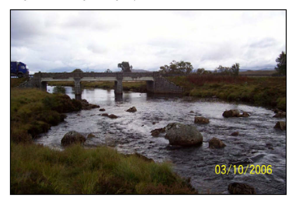
Figure 1.1 The western side of the existing Ba Bridge.

The Scottish Government (Transport Scotland) is proposing to replace Ba Bridge on Rannoch Moor (Figure 1.1) as it is under strength having been found to fail the minimum load carrying capacity for Trunk Roads. The bridge over the River Ba is located within Rannoch Moor Site of Special Scientific Interest (SSSI), Rannoch Moor Special Area of Conservation (SAC), Ben Nevis and Glen Coe National Scenic Area (NSA) and neighbours Rannoch Lochs Special Protection Area (SPA). The bridge carries the single carriageway A82 Trunk Road over the River Ba.