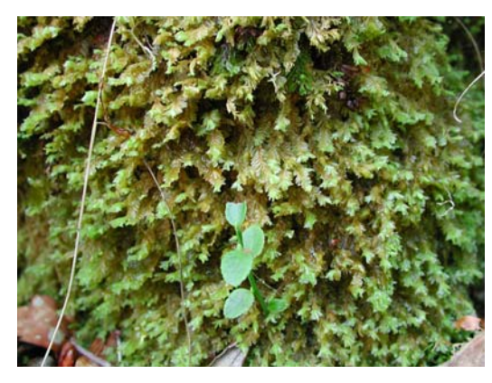
8. Plagiochila atlantica