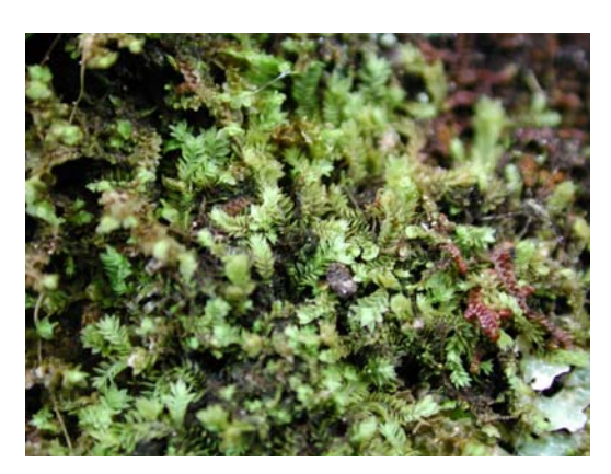
9. Douinia ovata