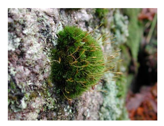
7. Dicranum scottianum

Note: These photos were taken at other sites on previous occasions. However, they are similar in appearance to the plants at Pulpit Rock except for Herbertus aduncus which was found here as just a few scattered shoots and not as the larger and more distinctive orange-coloured tufts shown here.