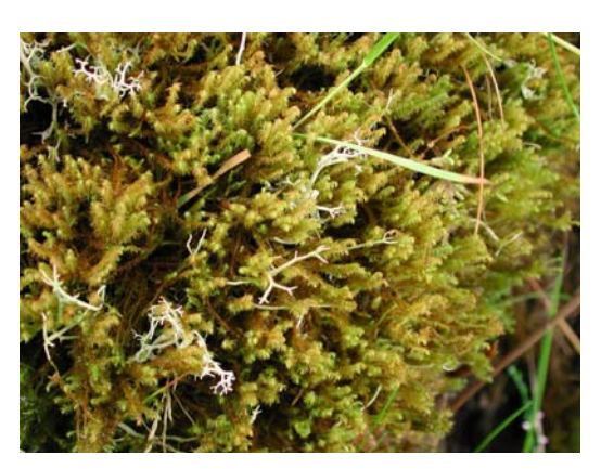
10. Herbertus aduncus