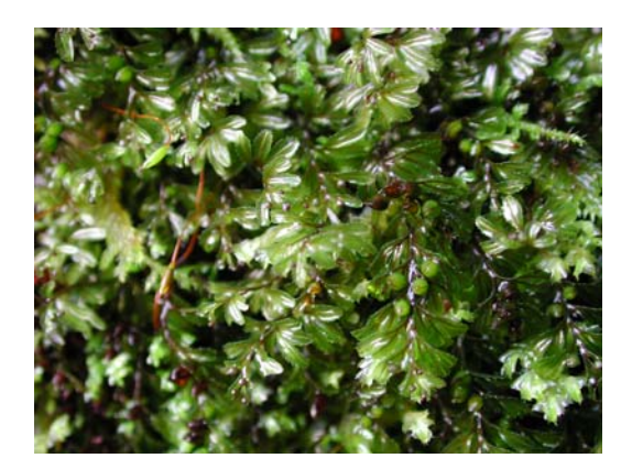
11. Hymenophyllum wilsonii