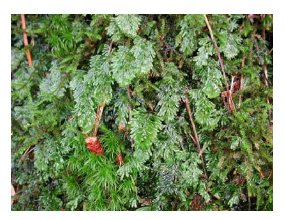
12. Hymenophyllum tunbrigense