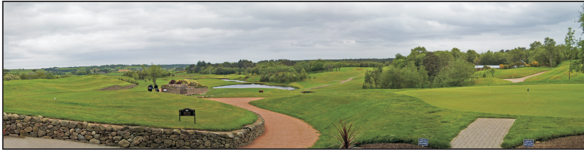
Viewpoint 23 - Newmachar Golf Course (Recreation Landscape Character Type)