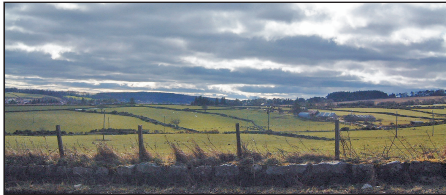
Viewpoint 06 - Overhills (Open Farmland Landscape Character Type)