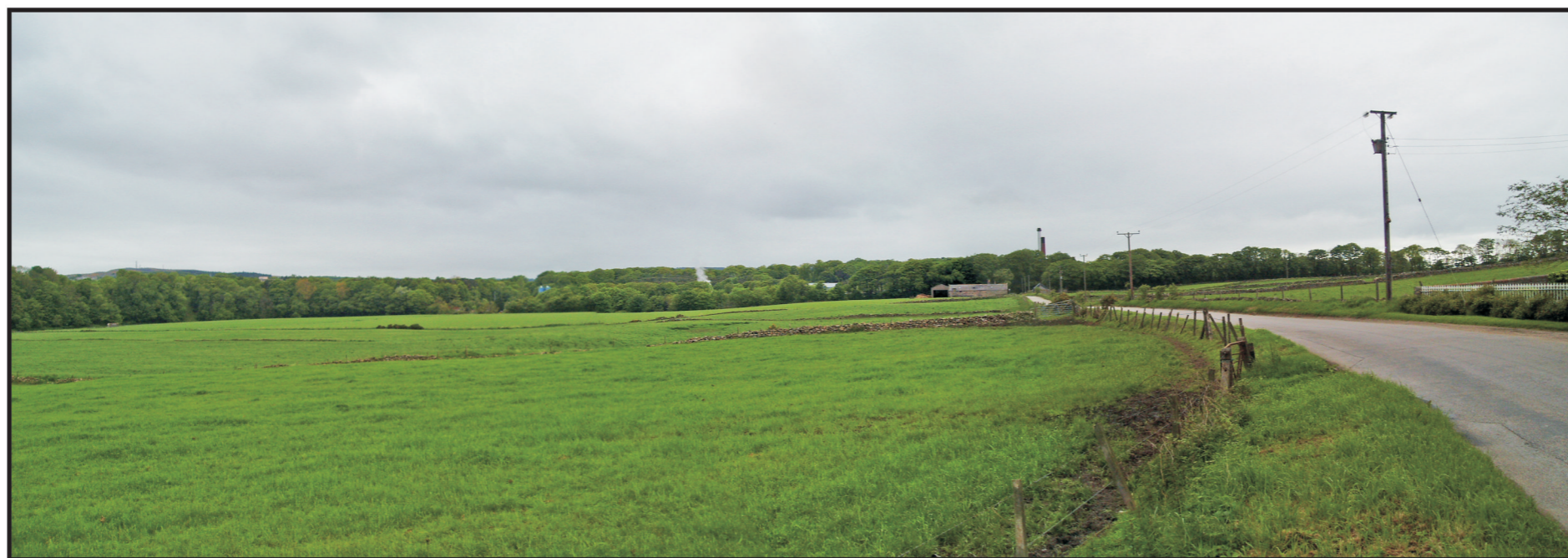
Viewpoint 16 - Lower Don Valley (Valley Landscape Character Type)