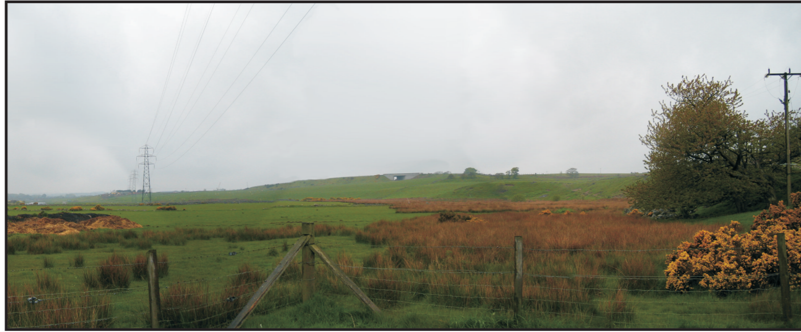
Viewpoint 19 - Lower Goval (Valley Landscape Character Type)