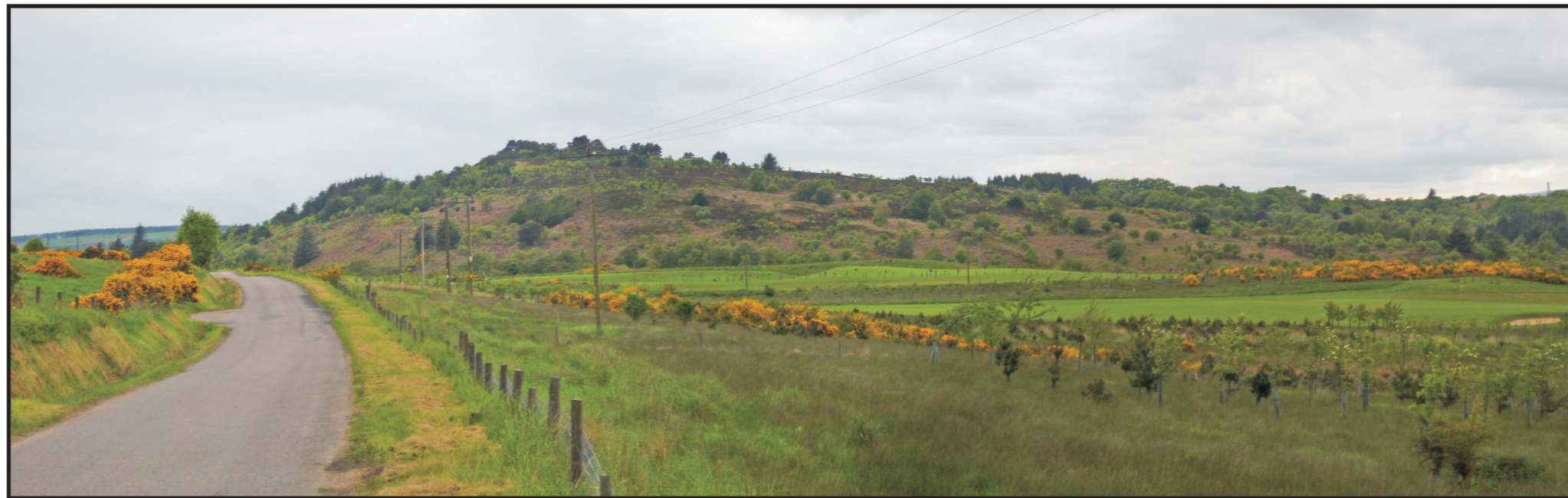
Viewpoint 02 - Elrick Hill (Hill Landscape Character Type)