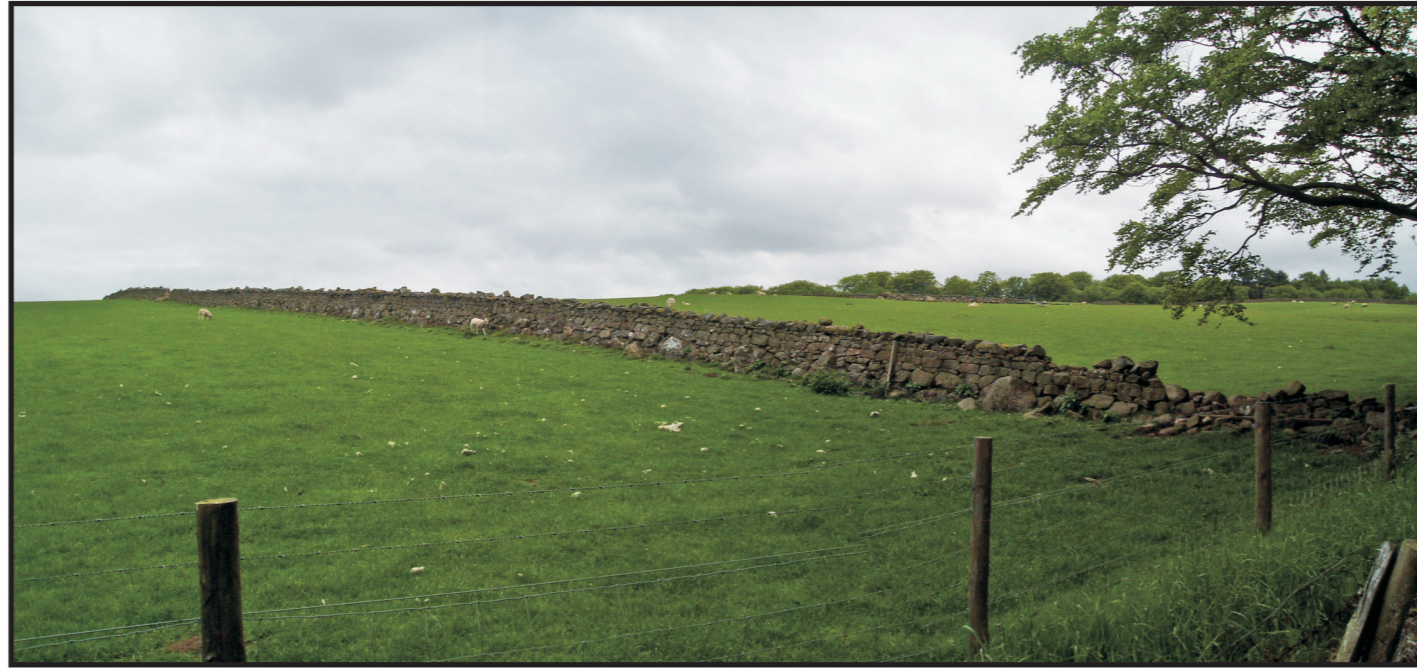
Viewpoint 05 - Greenferns (Open Farmland Landscape Character Type)