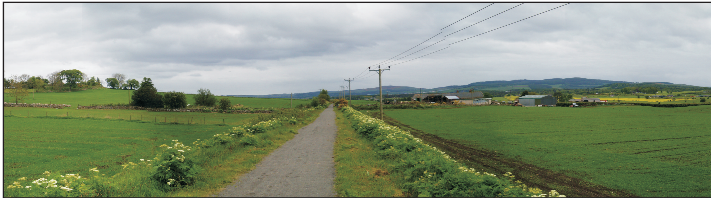
Viewpoint 08 - Goval (Open Farmland Landscape Character Type)