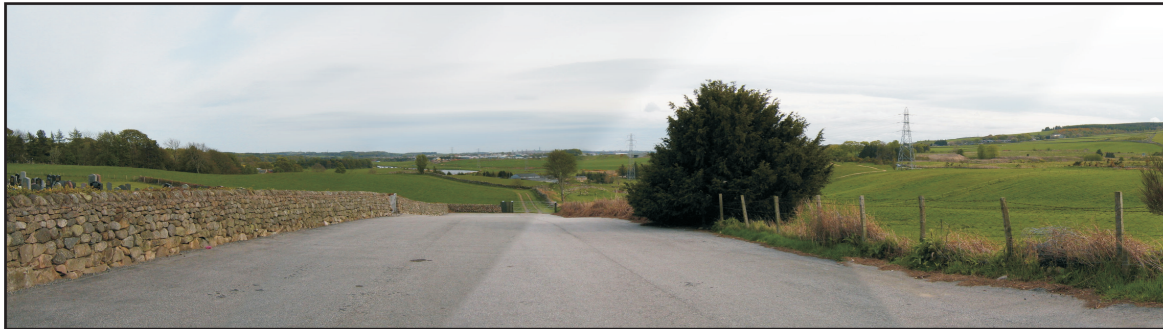
Viewpoint 18 - St. Fergus' (Valley Landscape Character Type)