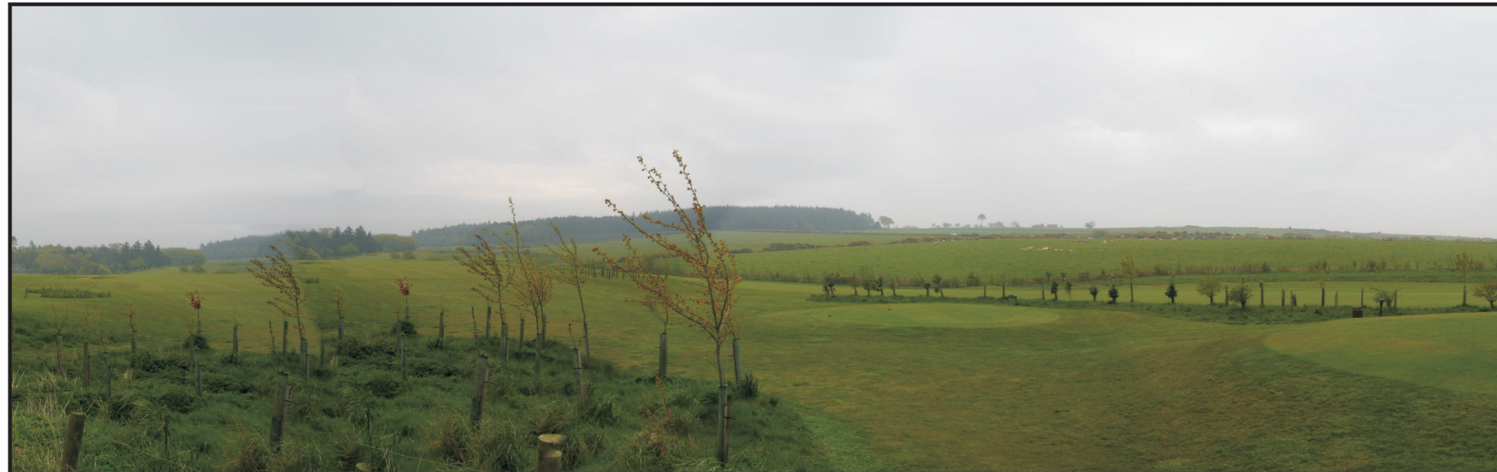
Viewpoint 22 - Craibstone Golf Course (Recreation Landscape Character Type)