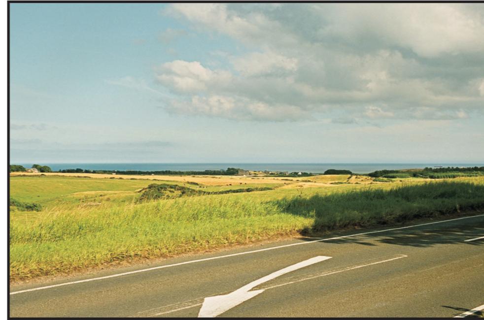
Viewpoint 10 - Potterton (Open Farmland Landscape Character Type)