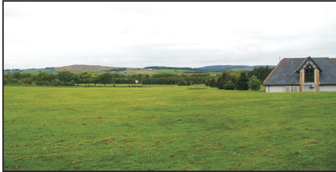
Viewpoint 21 - Auchmill Golf Course (Recreation Landscape Character Type)