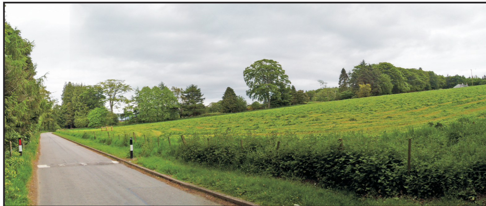
Viewpoint 13 - Craibstone (Wooded Farmland Landscape Character Type)