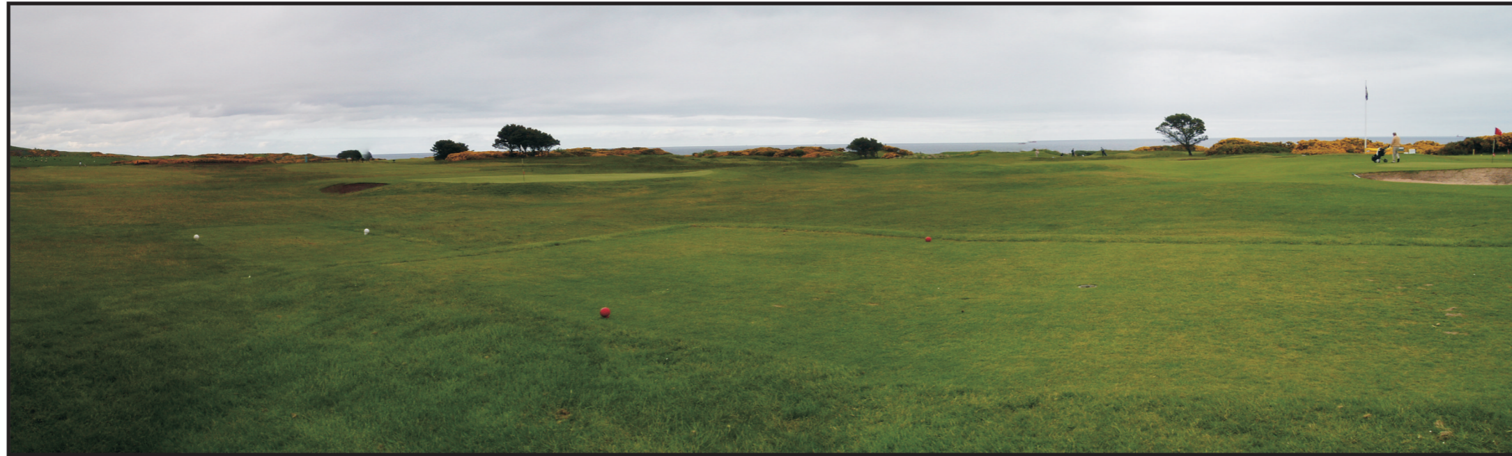
Viewpoint 20 - Balgownie Links (Coast Landscape Character Type)