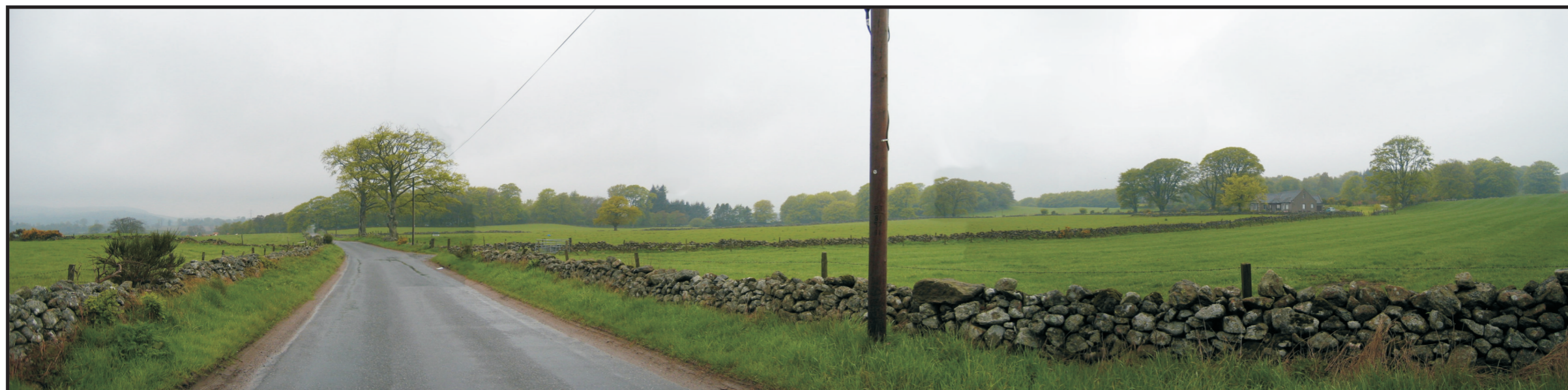
Viewpoint 04 - Foresterseat (Hill Landscape Character Type)