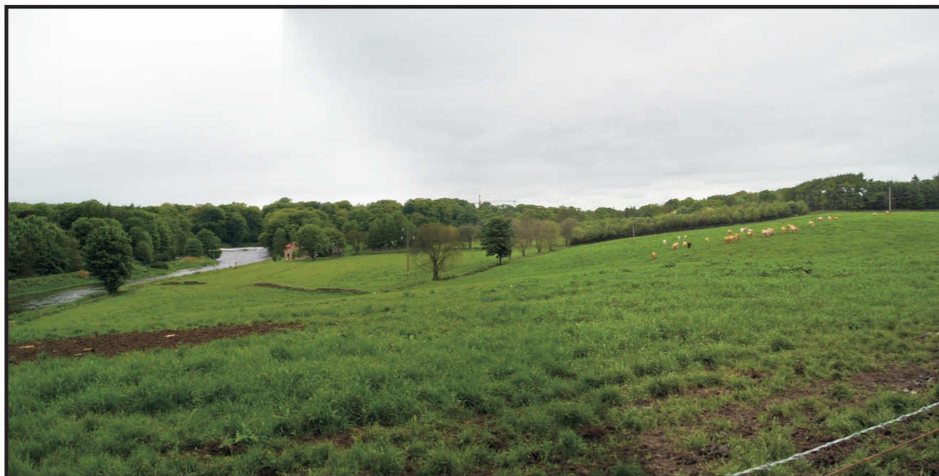
Viewpoint 14 - Braes Of Don (Wooded Farmland Landscape Character Type)