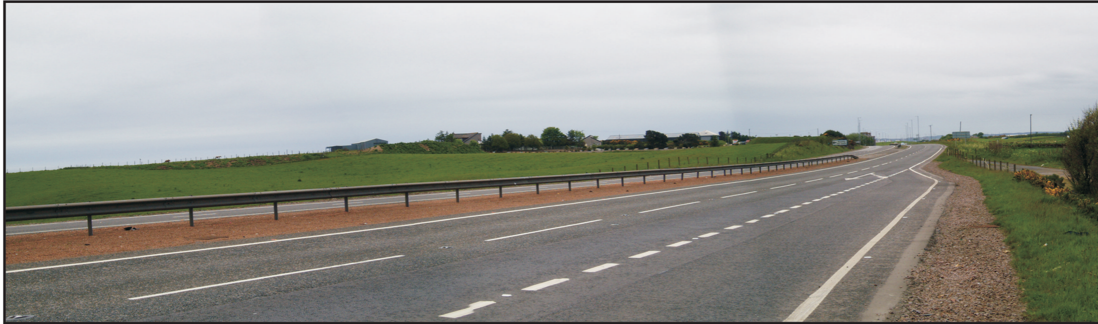
Viewpoint 12 - Blackdog (Open Farmland Landscape Character Type)