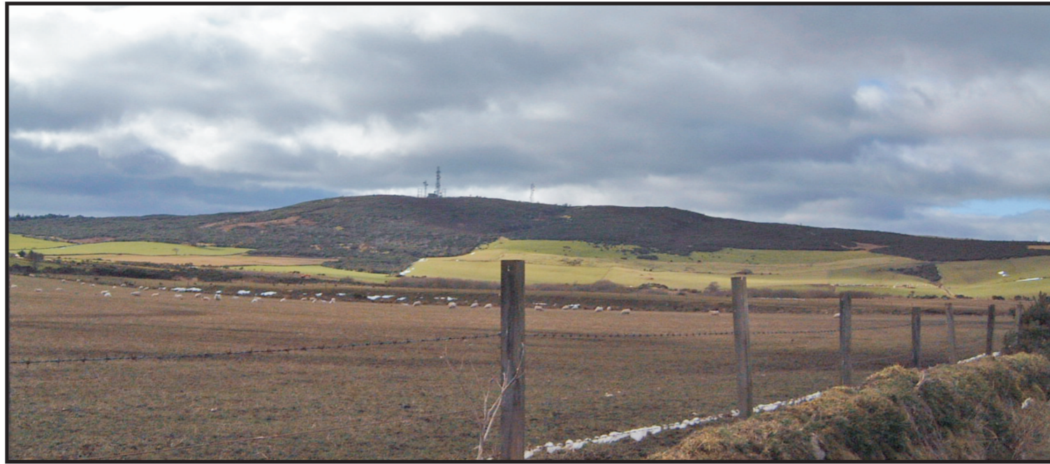
Viewpoint 01 - Brimmond Hill (Hill Landscape Character Type)