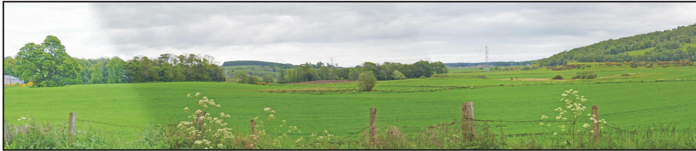
Viewpoint 17 - Upper Don Valley (Valley Landscape Character Type)