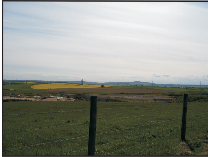
Viewpoint 09 - Perwinnes (Open Farmland Landscape Character Type)