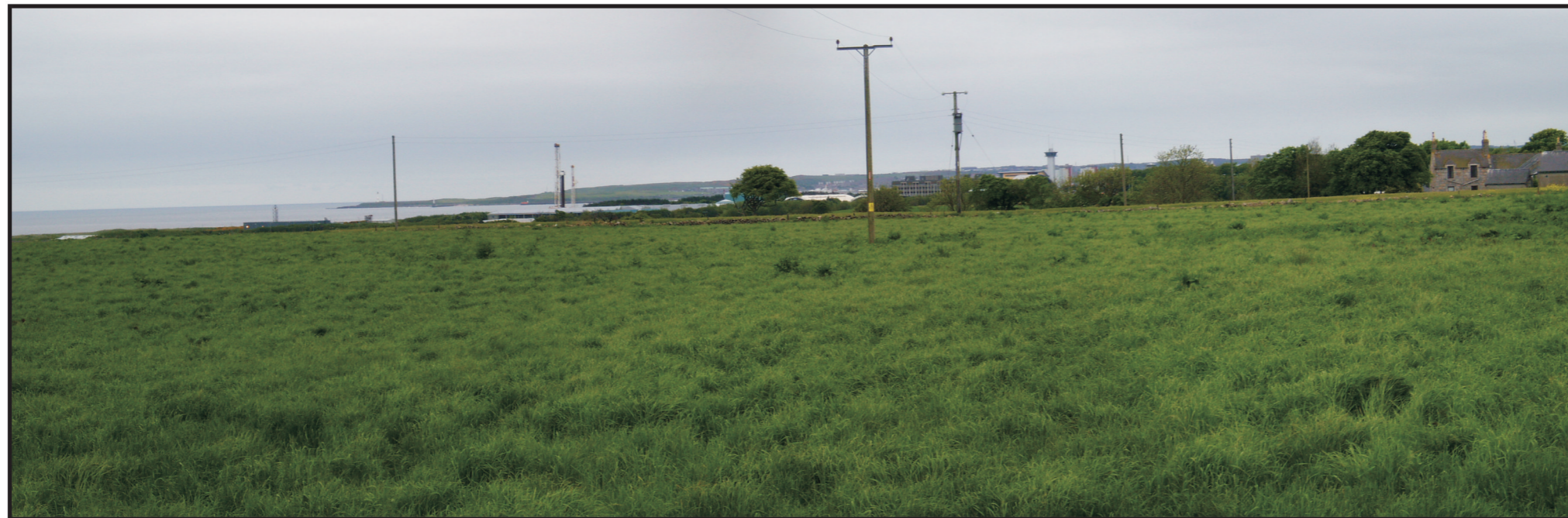
Viewpoint 11 - Cloverhill (Open Farmland Landscape Character Type)