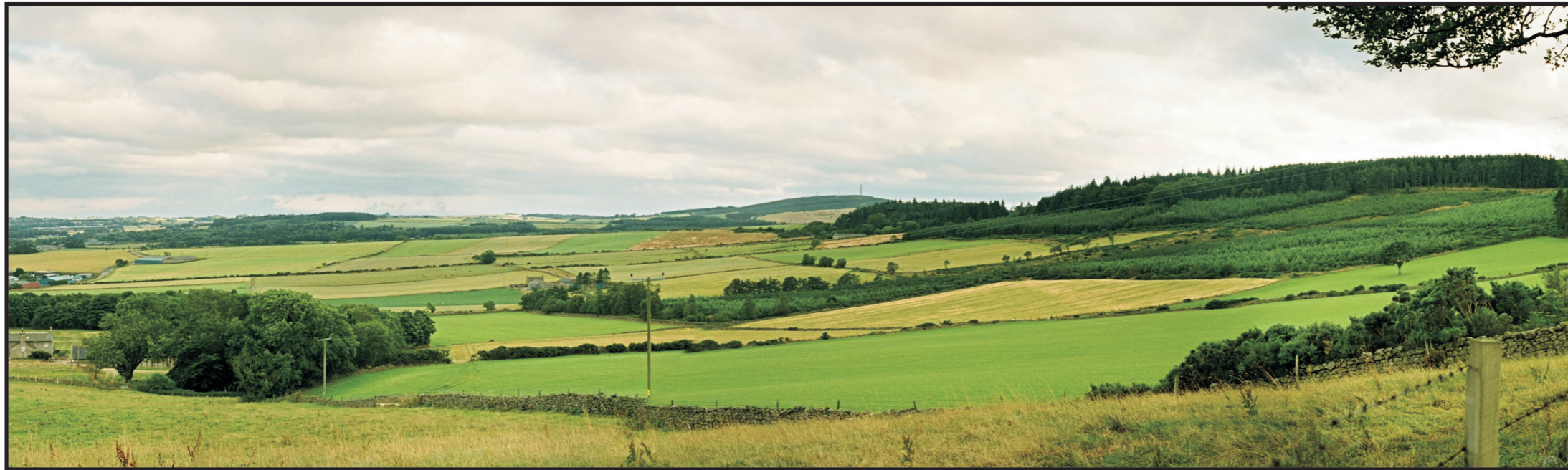
Viewpoint 07 - Newton (Open Farmland Landscape Character Type)