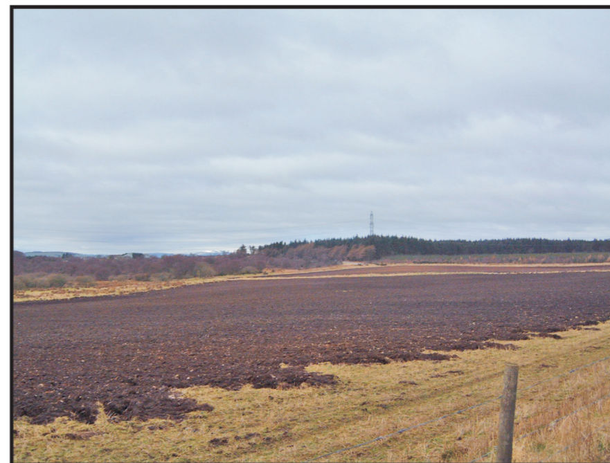
Viewpoint 15 - Red Moss (Wooded Farmland Landscape Character Type)