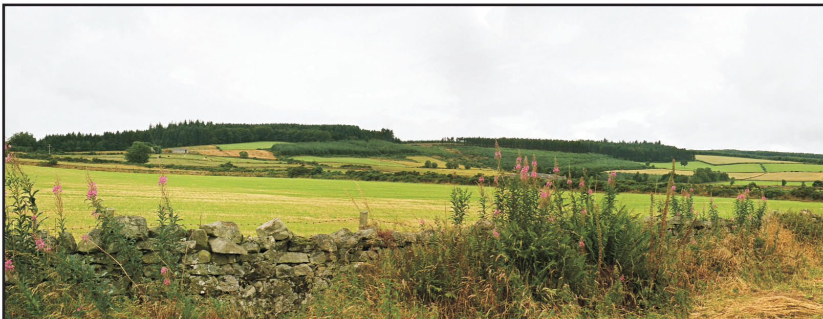
Viewpoint 03 - Tyrebagger Hill (Hill Landscape Character Type)