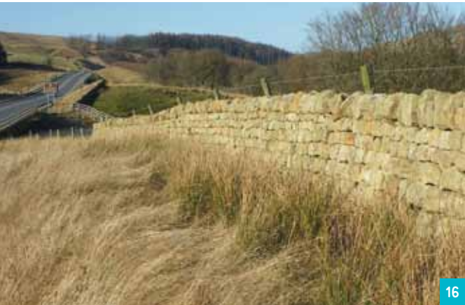
New drystone wall on the A7, built in vernacular style

The capacity of the transport estate landscape to deliver stronger benefits and outcomes is dependent upon developing clearer, better defined project-level design objectives.