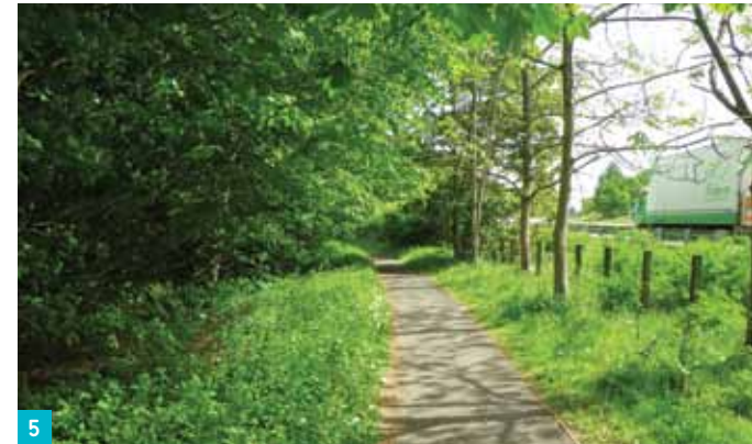
A9 and Perth-Inverness railway. A transport corridor