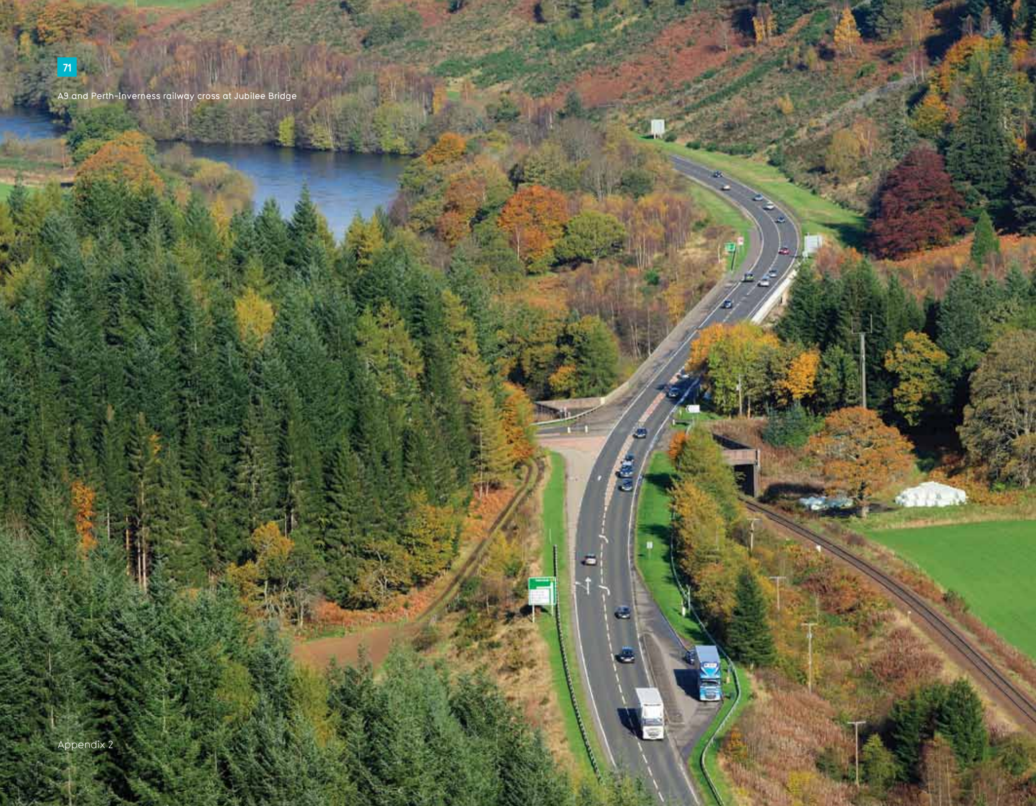
A9 and Perth-Inverness railway cross at Jubilee Bridge