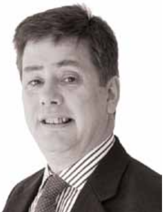
Mr Keith Brown MSP Minister for Transport and Veterans

Through the application of this new Fitting Landscapes policy the Scottish Government seeks to further advance its commitment to quality in all aspects of landscape design and management in connection with transport infrastructure.