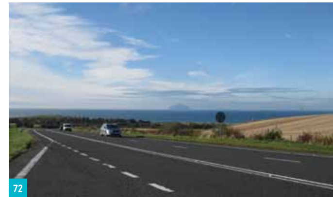
A77 Ballantrae. Views to Ailsa Craig

The transport estate is widely distributed across Scotland and has the potential to contribute positively to local landscapes and habitats through reinforcing and connecting green networks.