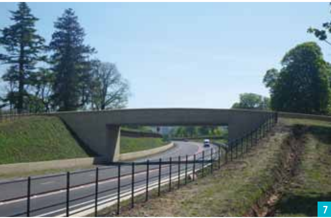
Estate fencing and bridge, A96 Fochabers bypass

The policy is concise and strategic in its approach. It defines a clearer, bolder vision for transport landscapes, reflecting Scotland's future needs, and focuses on the areas of activity with the potential to make the greatest contribution to sustainability outcomes.