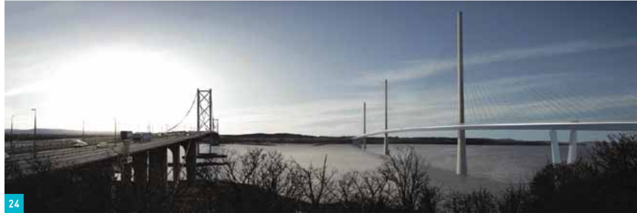
The Forth Replacement Crossing is a project which will provide many future lessons for the Fitting Landscapes policy.

The implementation and delivery of the policy will be monitored and evaluated by Transport Scotland through a range of mechanisms that include regular review through the existing design and management evaluation process. All designers and managers will be required to demonstrate the application of the policy within Transport Scotland appointments and contracts. Good practice and lessons learnt will be shared with designers and managers through Transport Scotland's Landscape Unit and in joint workshops and conferences with Scottish Natural Heritage and other agencies (see section 06).