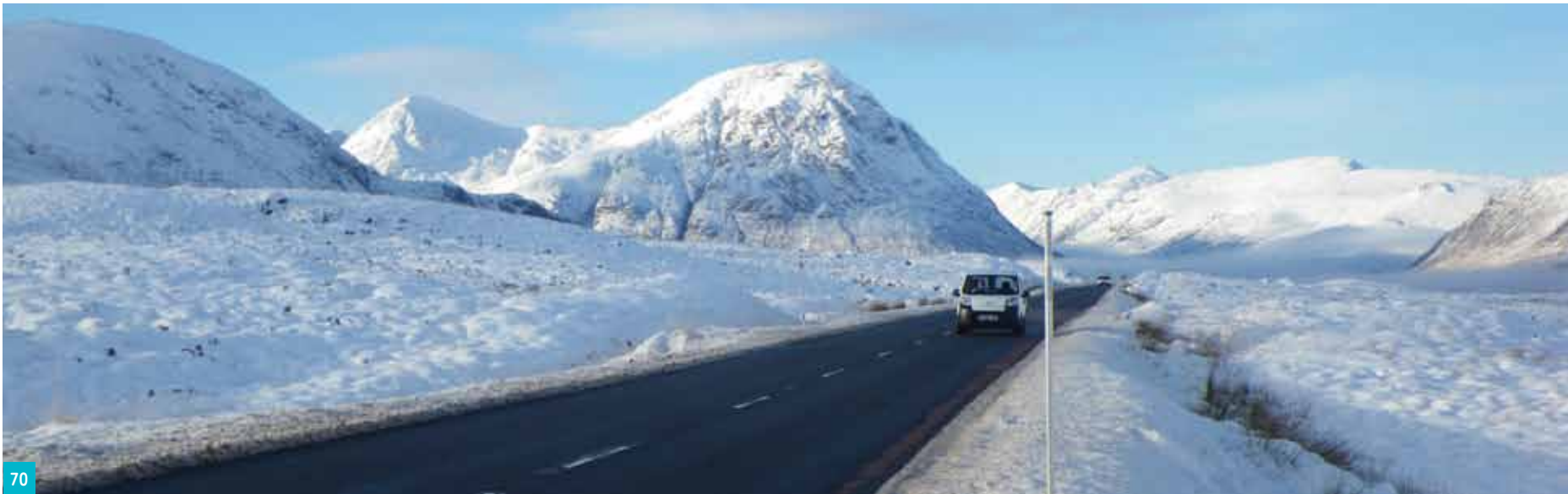
A82 Rannoch Moor in snow

Fitting Landscapes is intended to empower landscape architects and other professionals in achieving quality of design and place in outcomes.