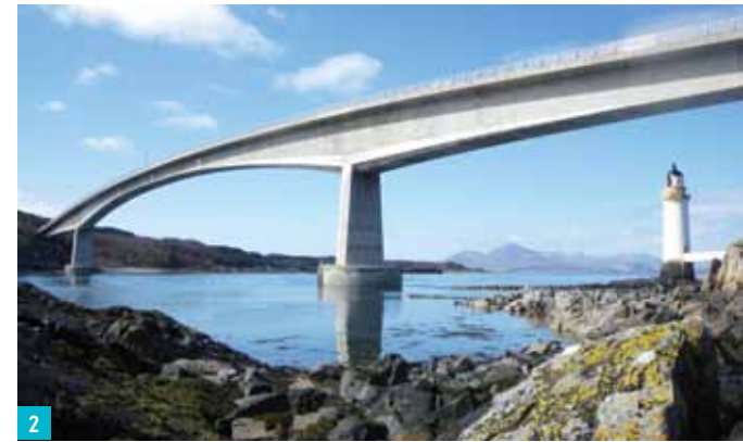
A87 Skye Bridge