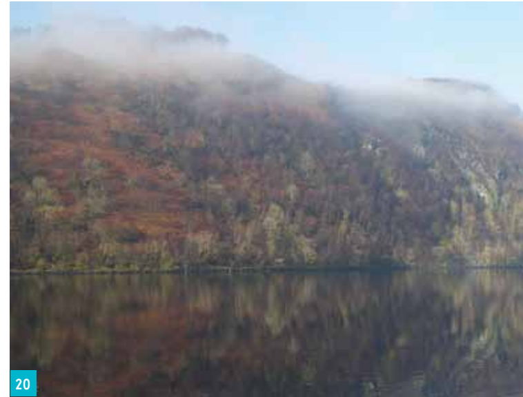
20 A85 Loch Awe, below Ben Cruachan: decking allows the steep wooded slopes above to be retained intact

The specific landscape objectives for a project should 'adapt' the four key policy aims ( ensure high quality of design and place; enhance and protect natural heritage; use resources wisely and build in adaptability to change ) to the specific characteristics of the site.