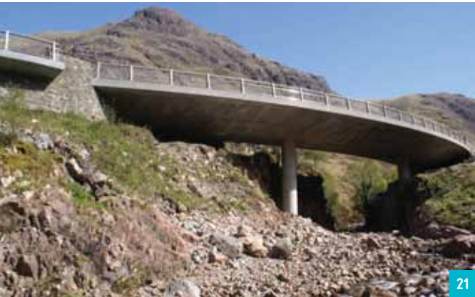
A82 Lairig Eilde Bridge. Detailed design and specification was required to respond to the dramatic location.