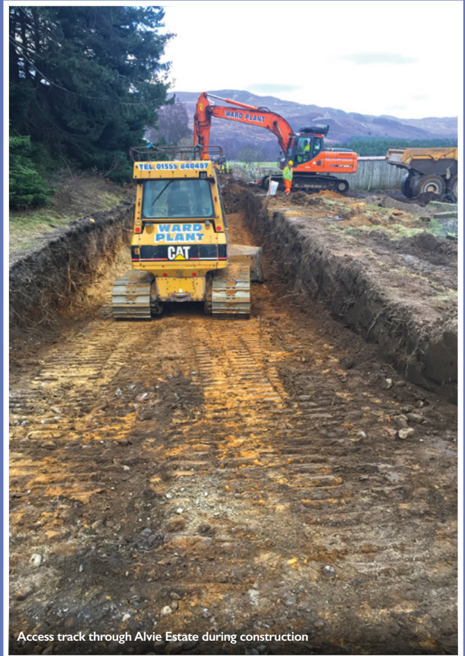
Access track through Alvie Estate during construction