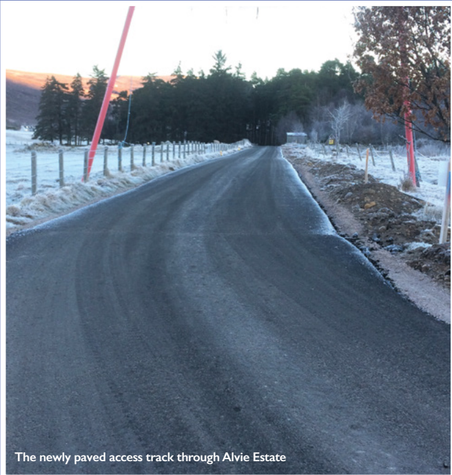
The newly paved access track through Alvie Estate