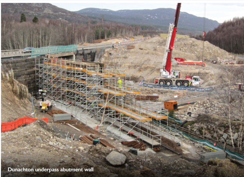
Dunachton underpass abutment wall