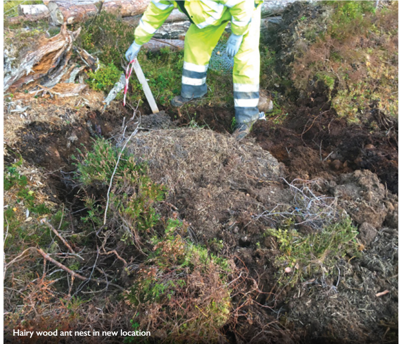
Hairy wood ant nest in new location

Monitoring of the relocated nests continues and we are pleased with the successful survival of the nests.