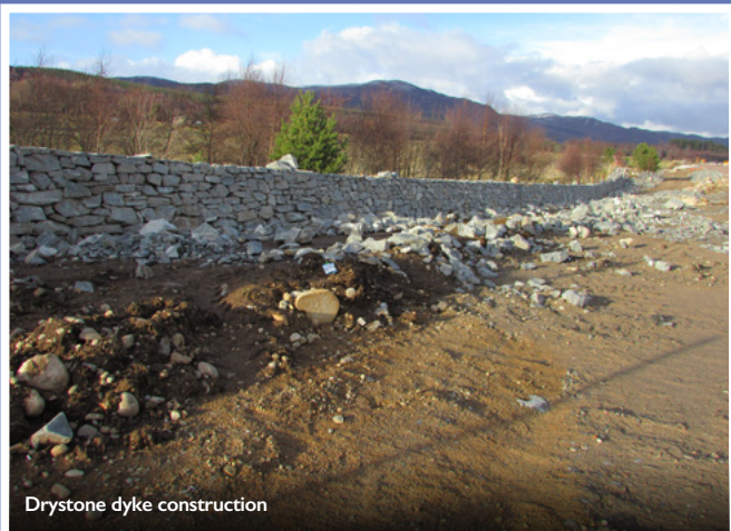
Drystone dyke construction

On Alvie Estate, we have already prepared over two kilometres of the main track for surfacing, with just under a kilometre of track to be completed. All other tracks on the estate are also nearing completion.