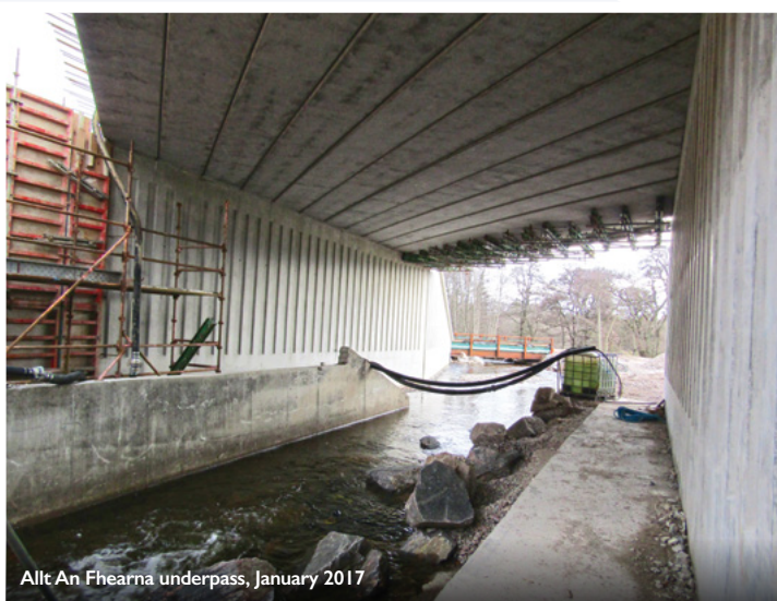
Allt An Fhearna underpass, January 2017