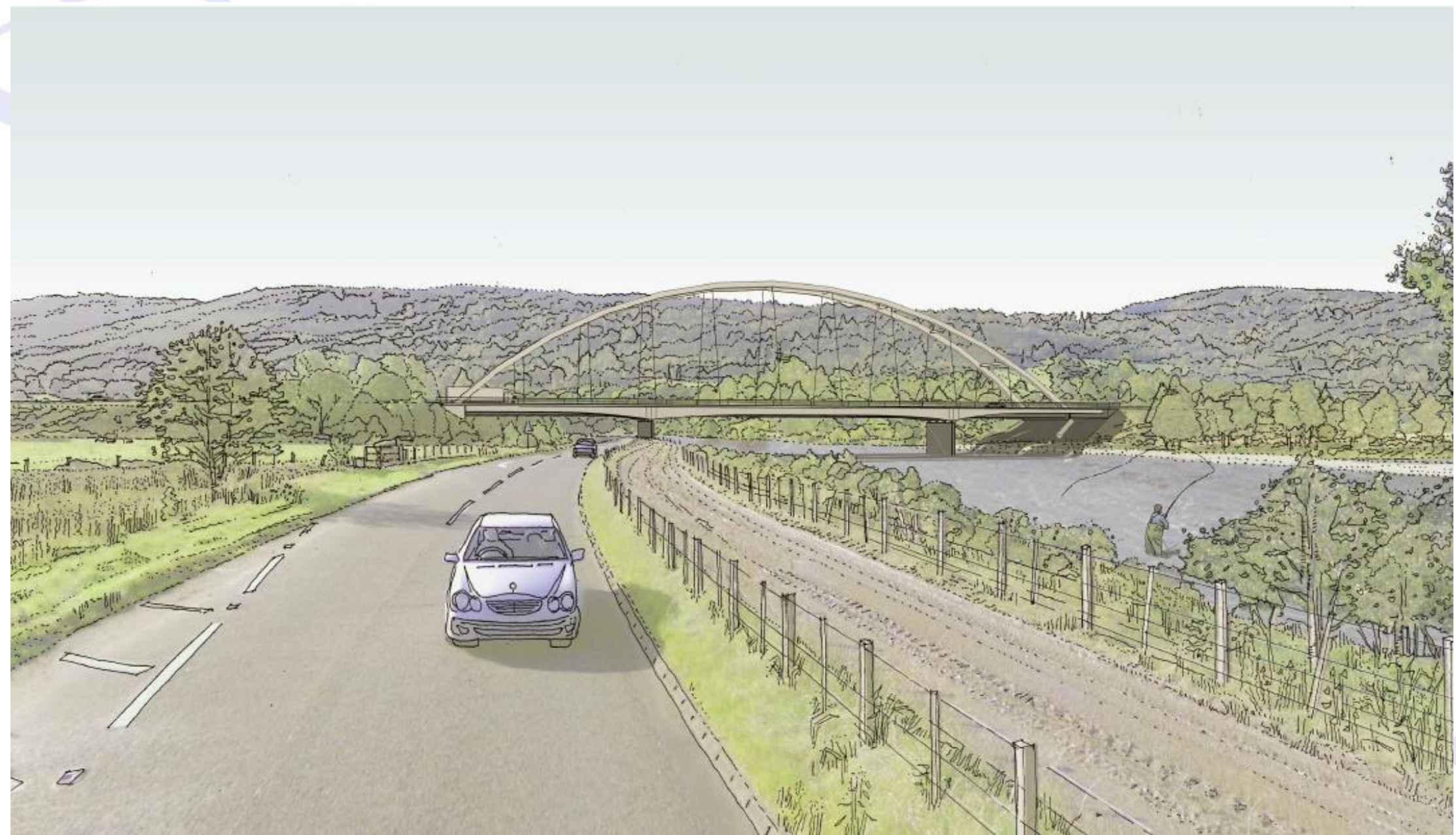
Artists Impression – Proposed River Tummel Crossing – Option D – South West View