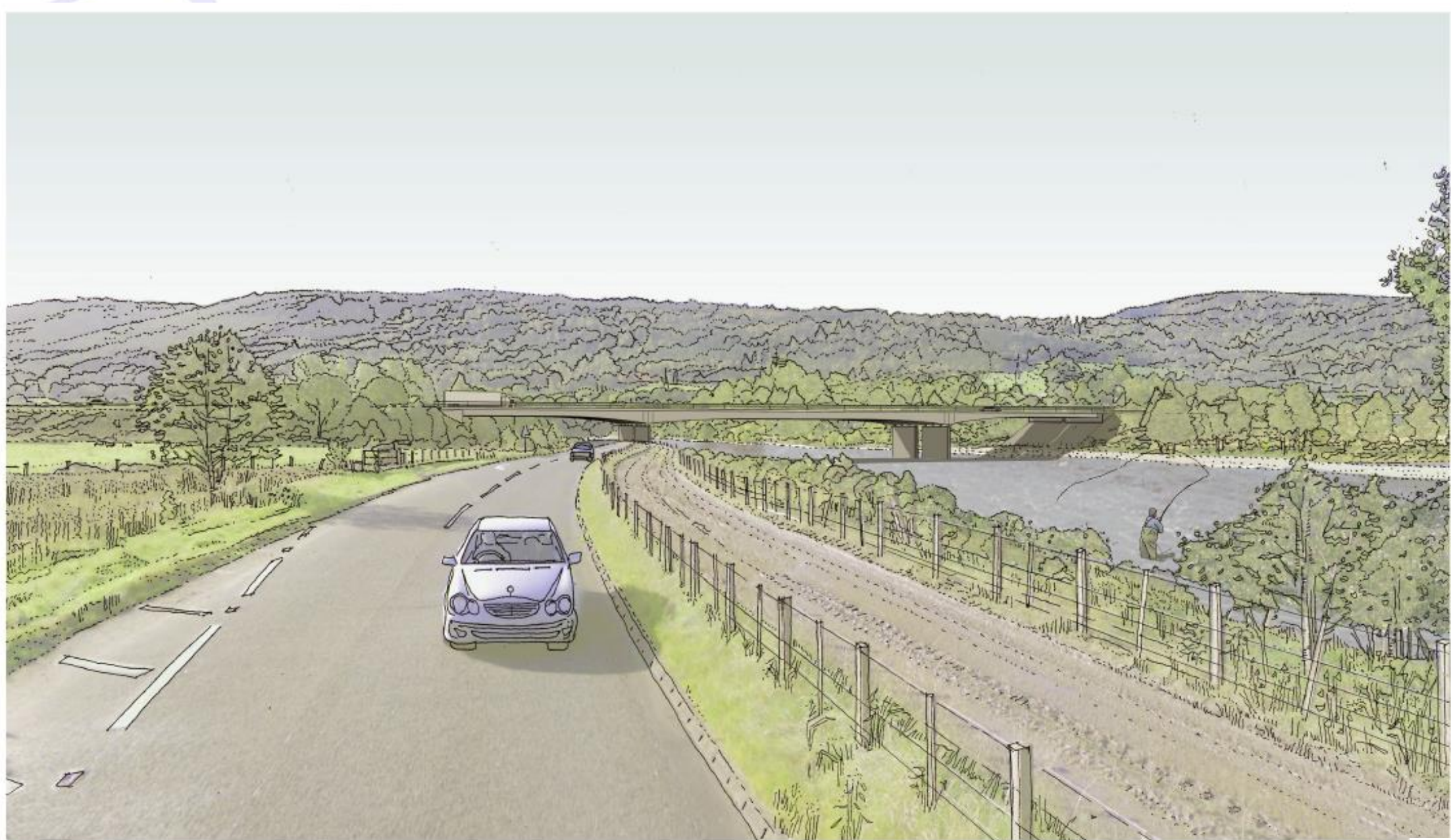
Artists Impression – River Tummel Crossing - Option A– South West View