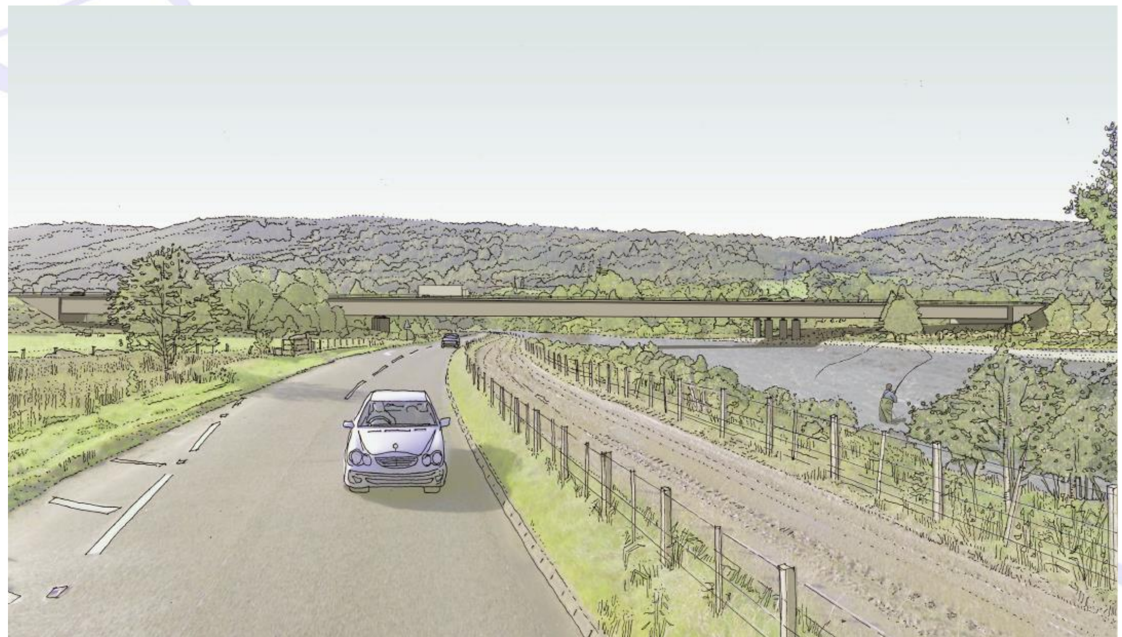
Artists Impression - River Tummel Crossing - Option C - South West View