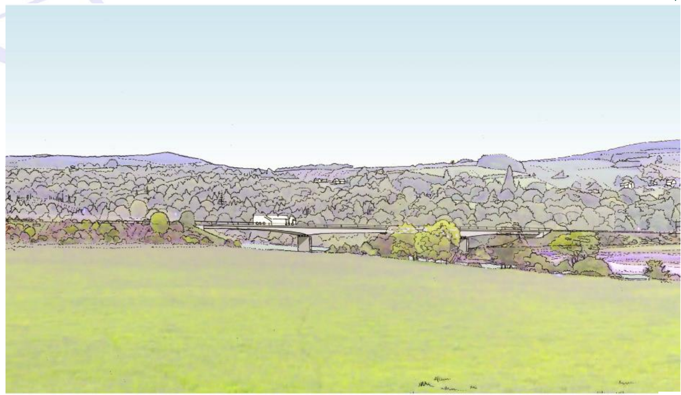
Artists Impression - Existing River Tummel Crossing - North East View