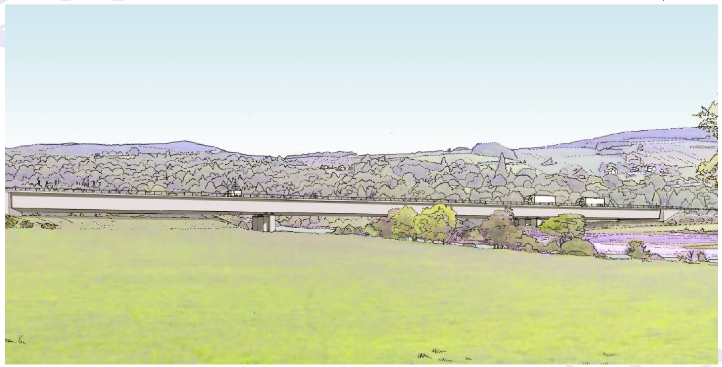
Artists Impression - River Tummel Crossing - Option C - North East View