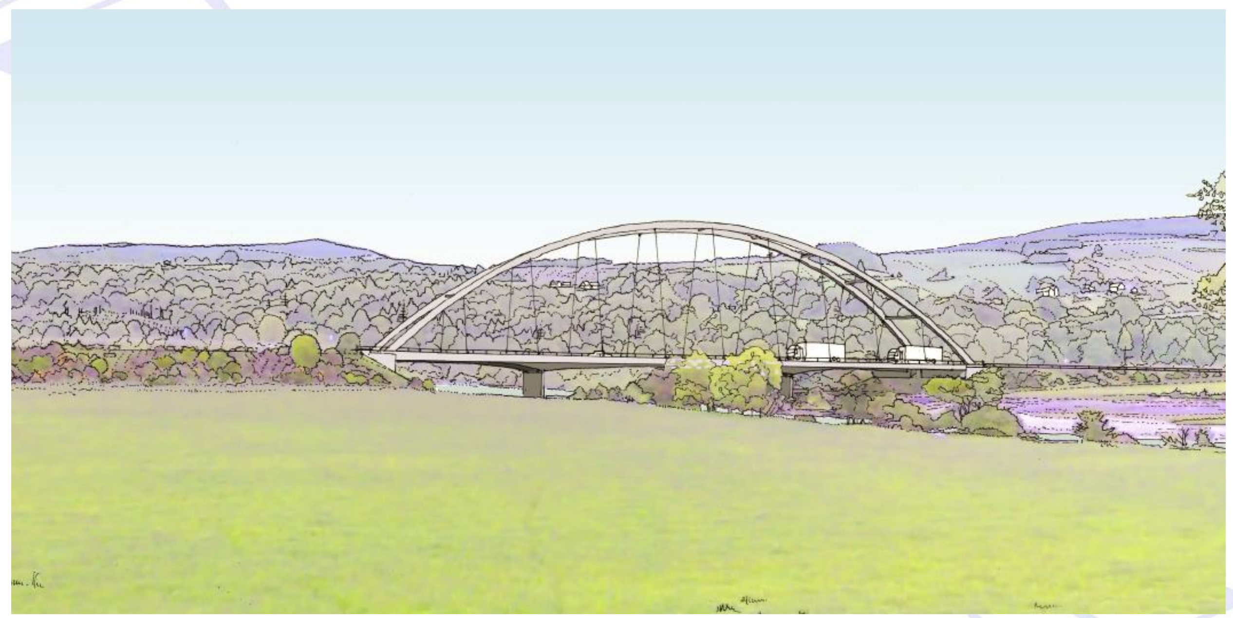
Artists Impression – Proposed River Tummel Crossing – Option D – North East View