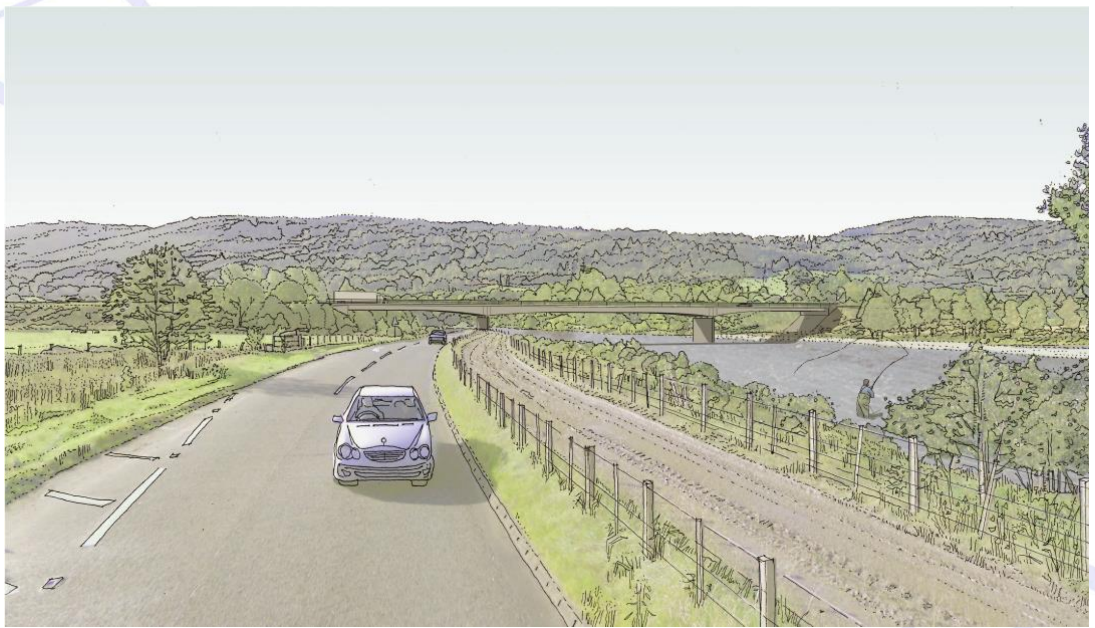
Artists Impression - Existing River Tummel Crossing - South West View