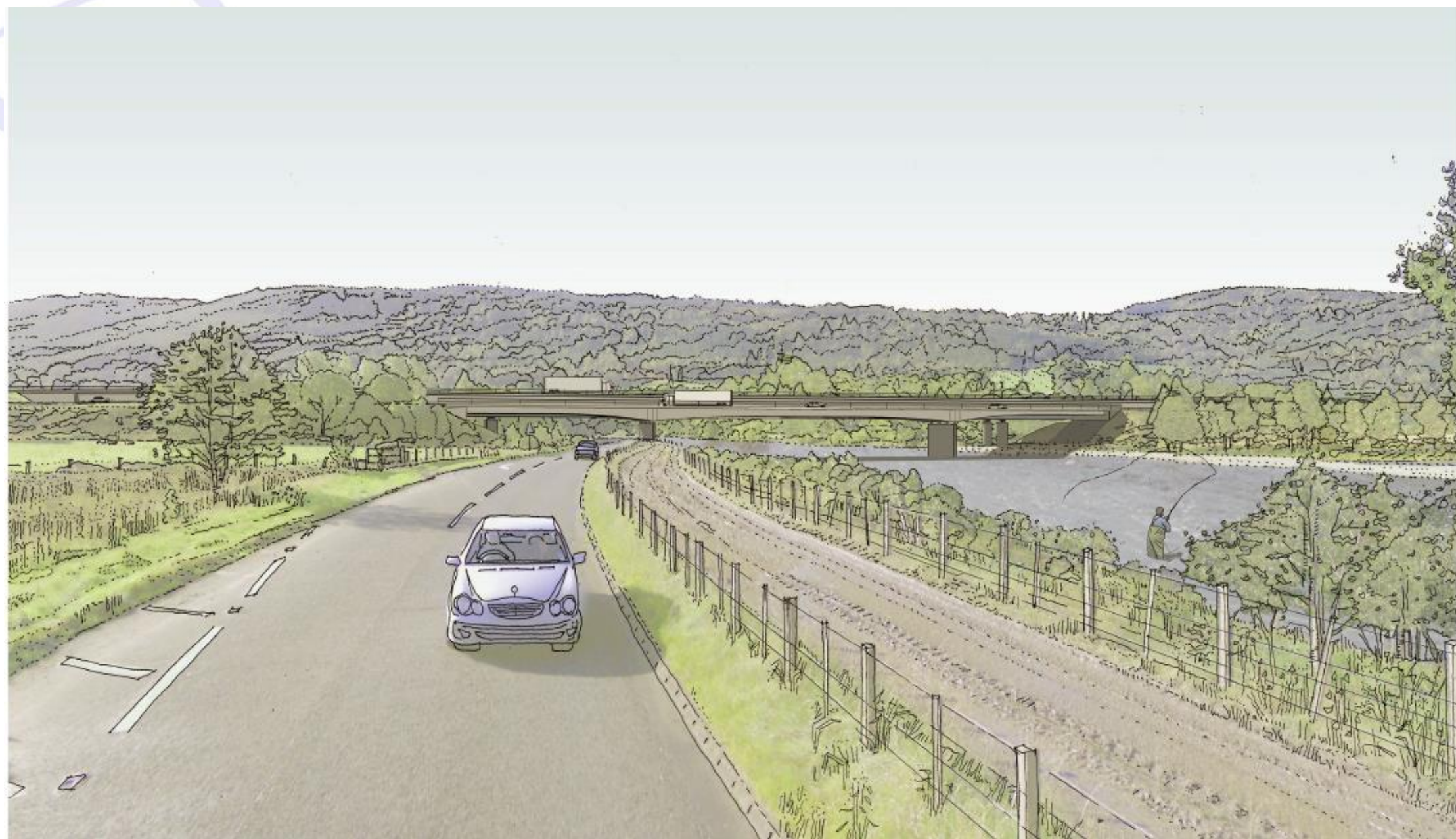
Artists Impression - River Tummel Crossing - Option B - South West View