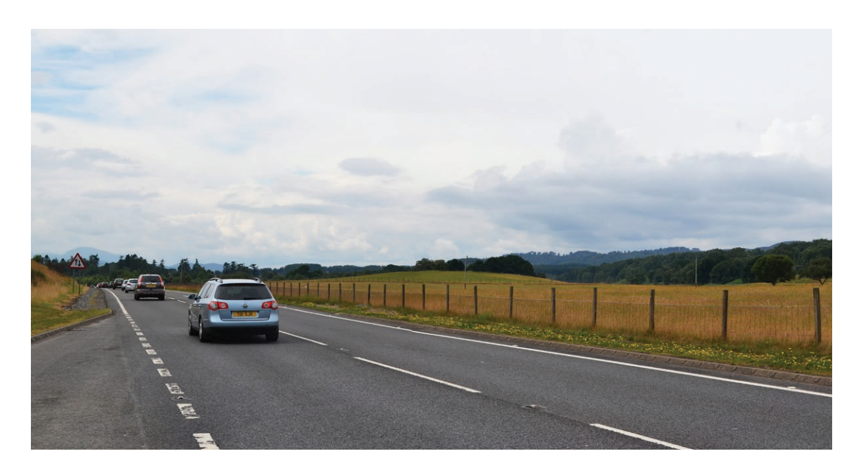
Viewpoint C View looking east from layby 122 along existing A9 carriageway