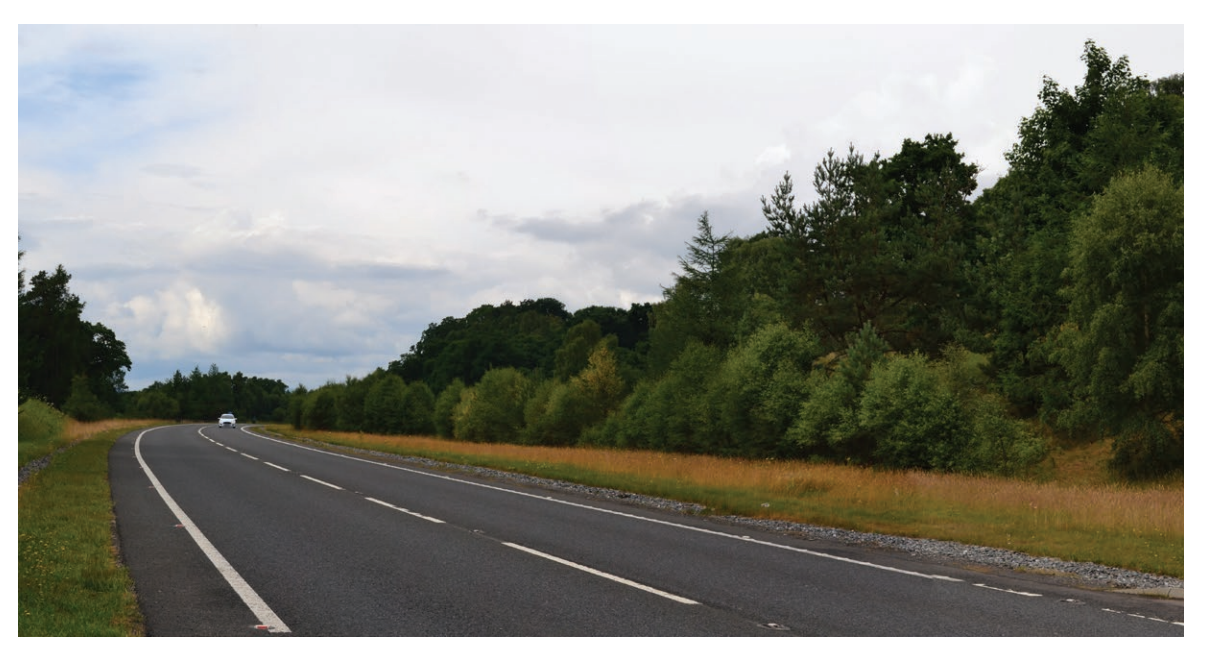
Viewpoint A View looking west along existing A9 carriageway