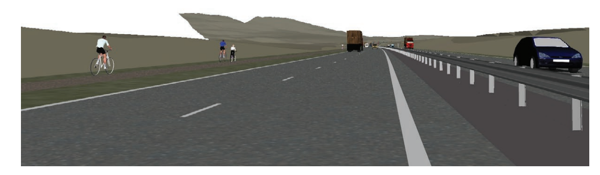
Bare Earth 3D Model Views along proposed A9 Carriageway