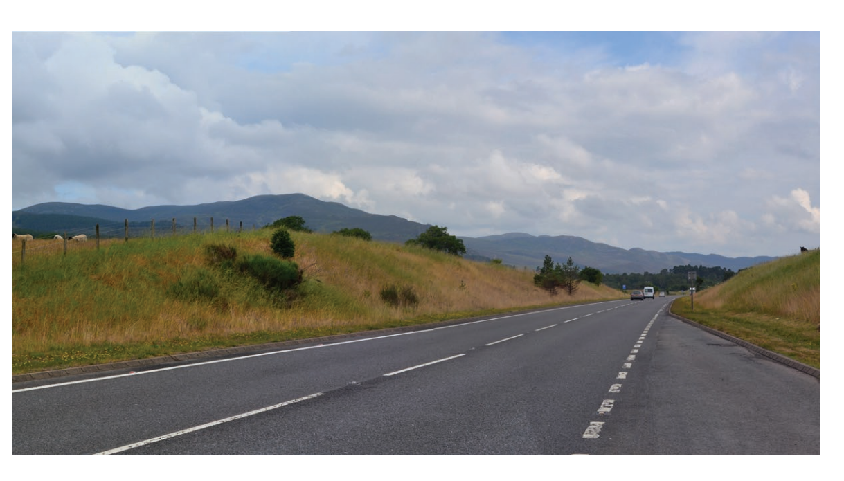
Viewpoint C View looking west from lay-by 122 along existing A9 carriageway