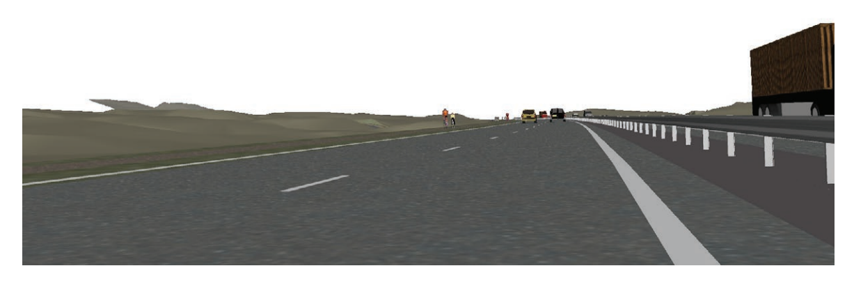
Bare Earth 3D Model Views along proposed A9 Carriageway