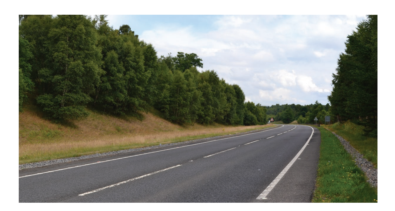
Viewpoint A View looking north east along existing A9 carriageway