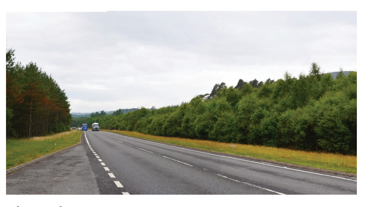
Viewpoint D View looking west from lay-by 124 along existing A9 carriageway