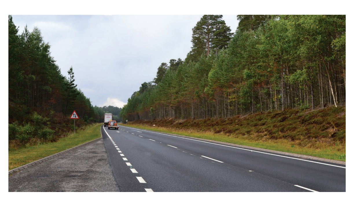
Viewpoint E View looking west from lay-by 126 along existing A9 carriageway