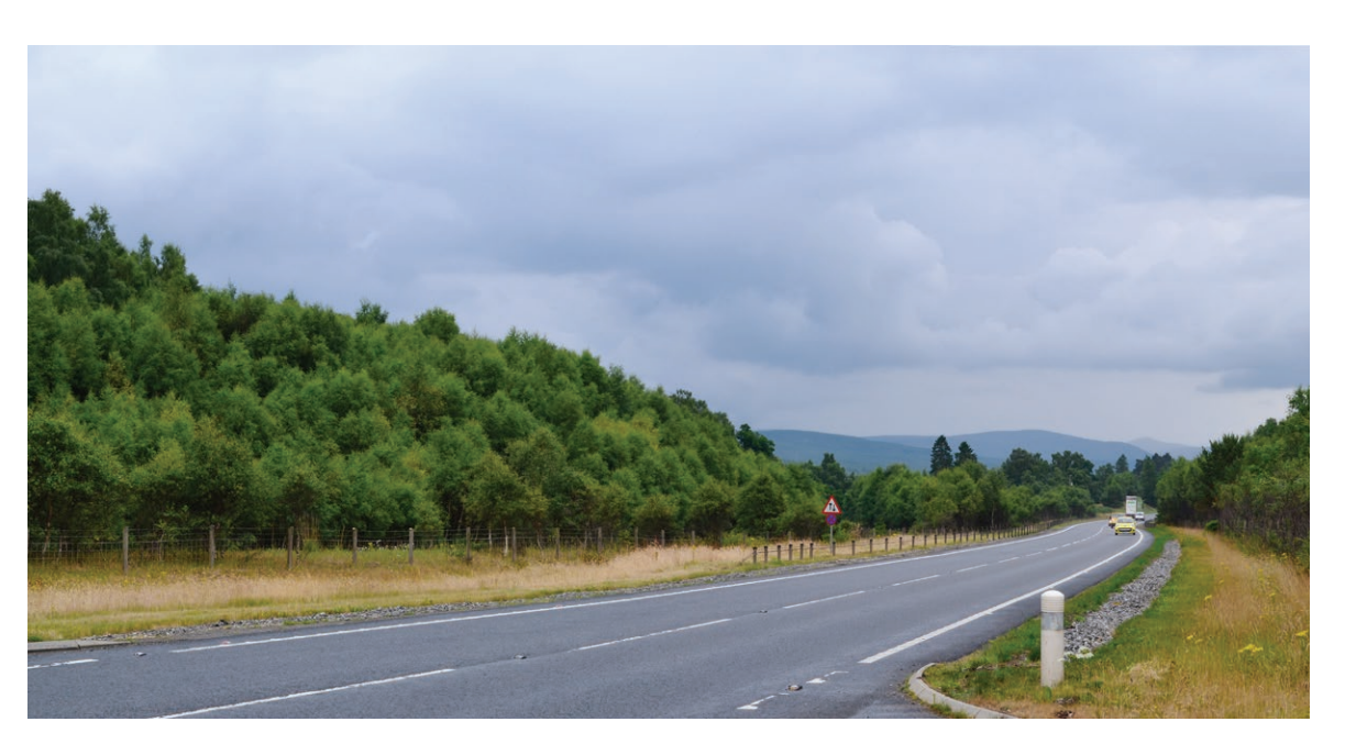
Viewpoint B View looking south along existing A9 carriageway