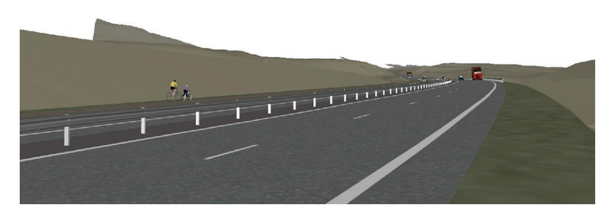
Bare Earth 3D Model Views along proposed A9 Carriageway