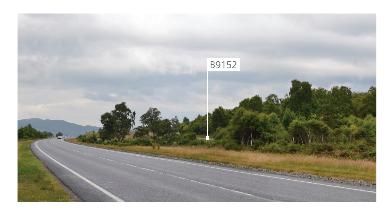
Viewpoint B View looking north along existing A9 carriageway