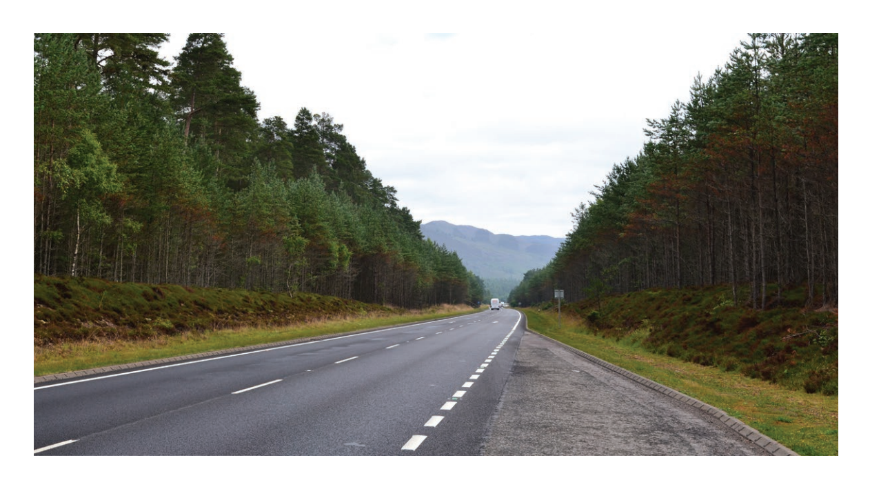
Viewpoint E View looking north east from lay-by 126 along existing A9 carriageway