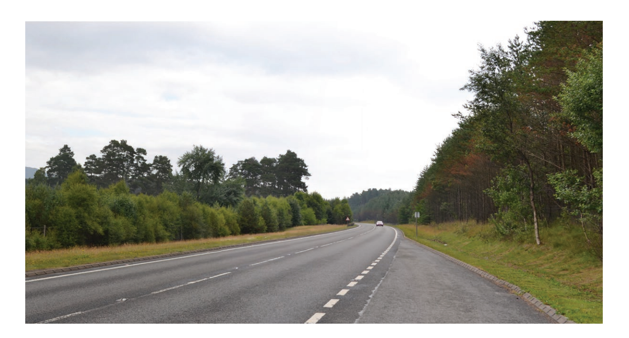
Viewpoint D View looking north east from lay-by 124 along existing A9 carriageway