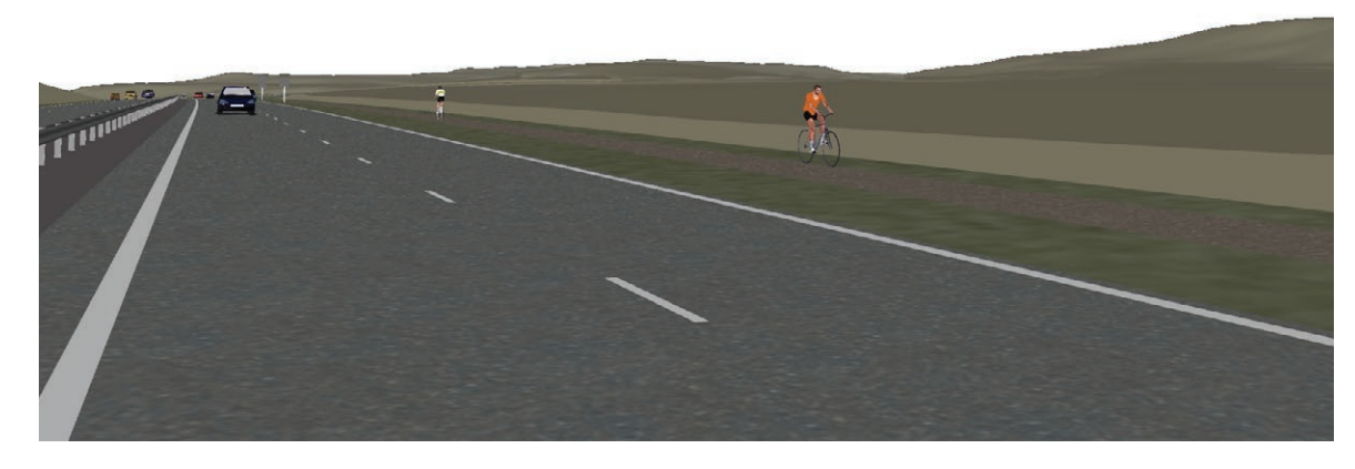
Bare Earth 3D Model Views along proposed A9 Carriageway