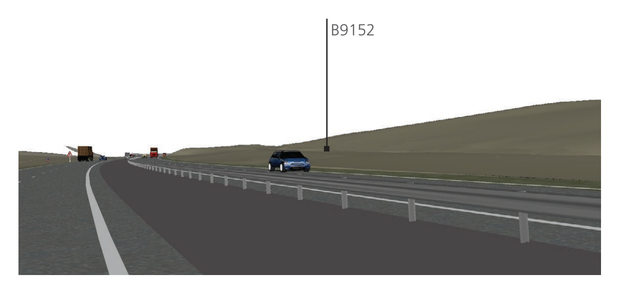
Bare Earth 3D Model Views along proposed A9 Carriageway