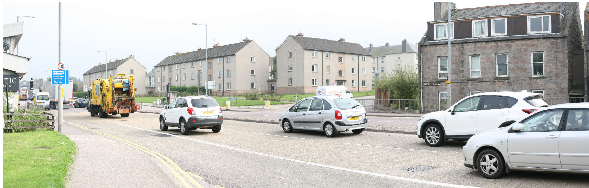
Viewpoint 4 - Auchmill Road UCA