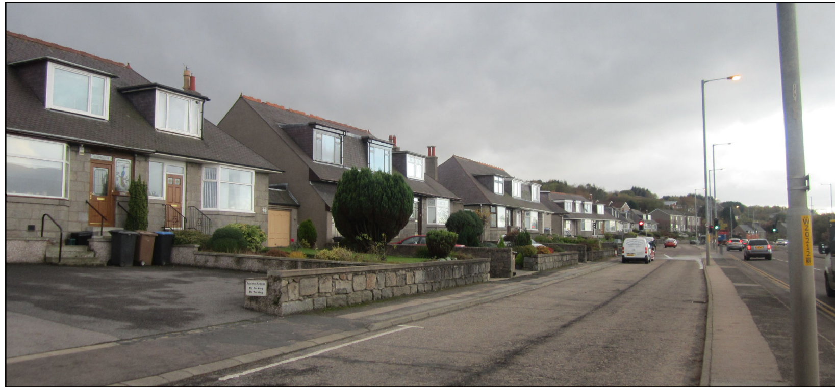
Viewpoint 3 - Auchmill Road UCA