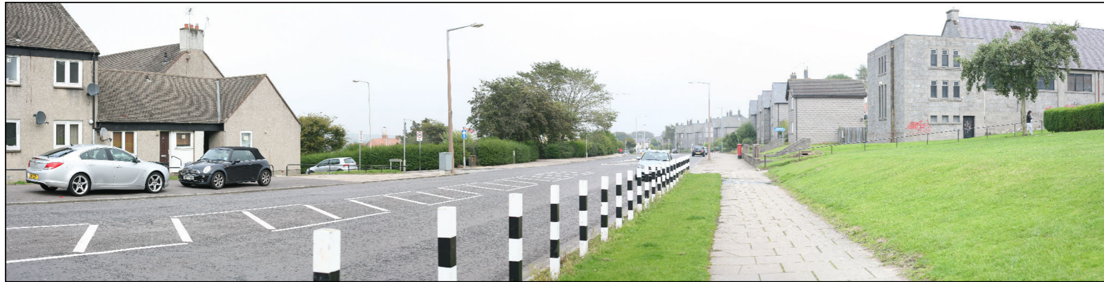
Viewpoint 7 - South Middlefield UCA