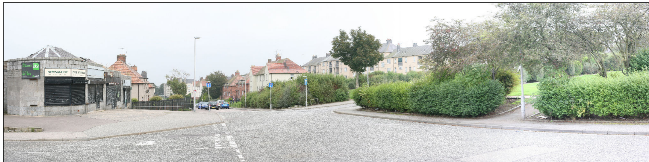
Viewpoint 8 - North Middlefield UCA