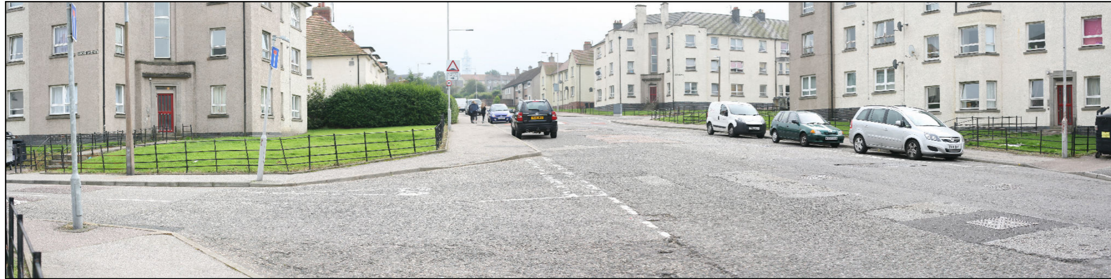
Viewpoint 11 - North Middlefield UCA