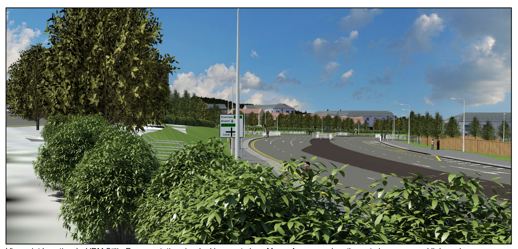
Viewpoint Location 1 - VRM Still - Representative view looking west along Manor Avenue and north west along proposed link road