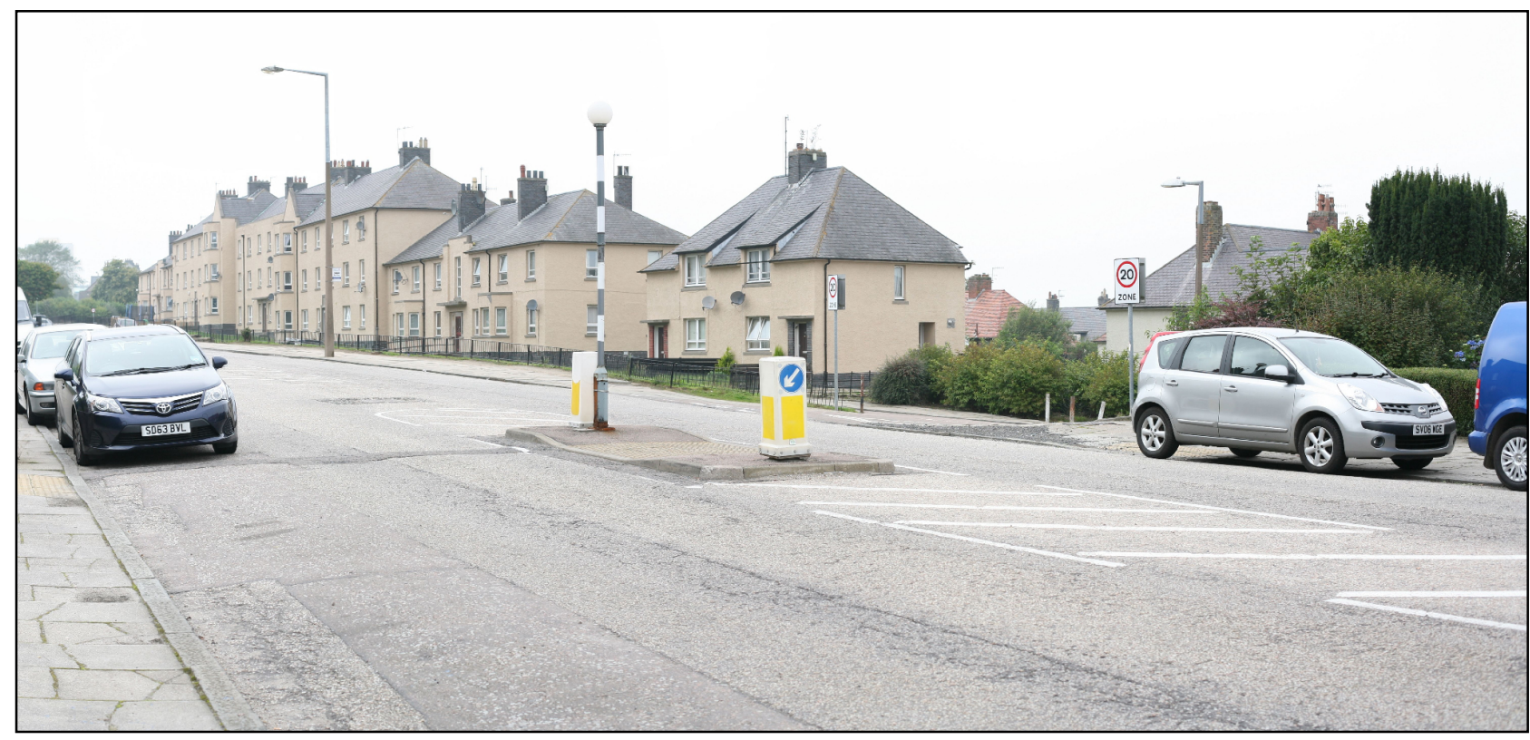
Viewpoint Location 1 - Existing photograph looking west along Manor Avenue