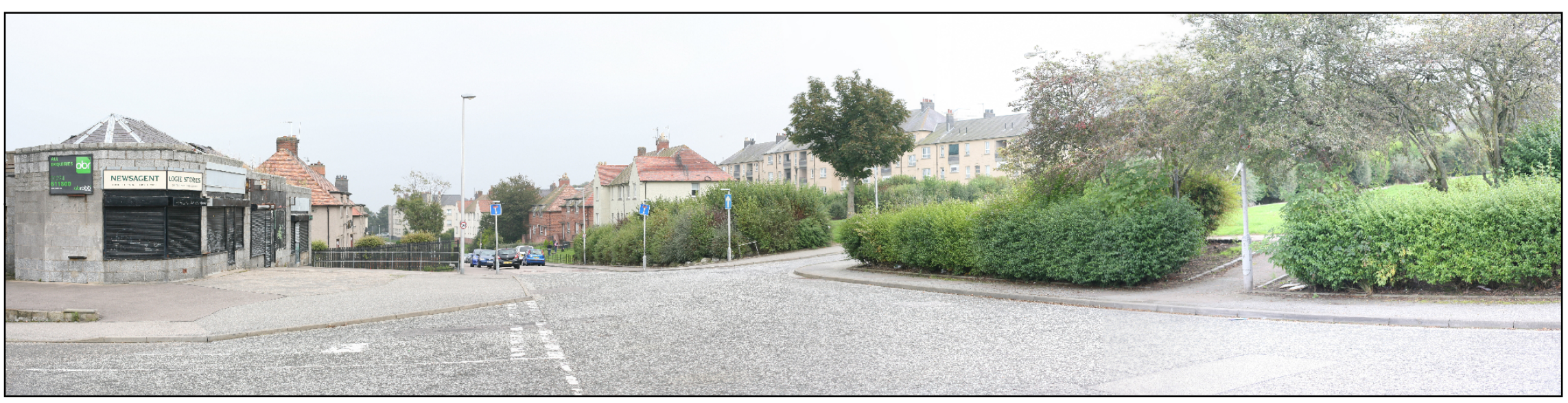
Viewpoint Location 4 - Existing photograph looking east along Logie Place from Manor Drive junction