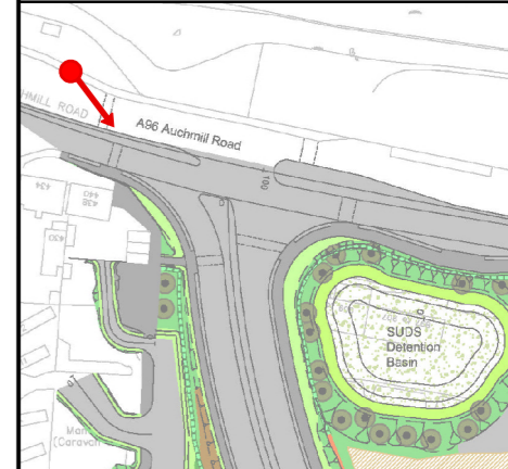
VIEWPOINT LOCATION PLAN