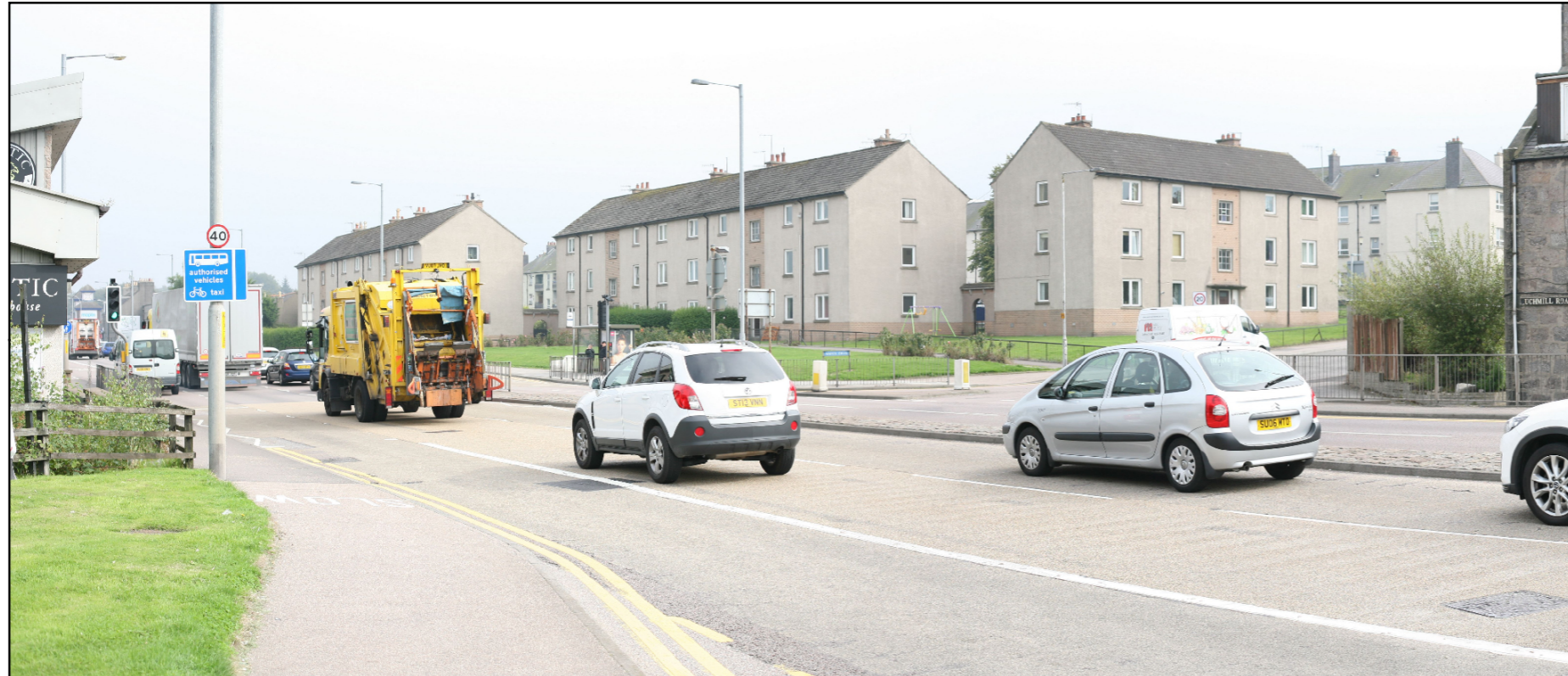
Viewpoint Location 6 - Existing photograph looking south east towards Manor Drive junction onto A96 Auchmill Road