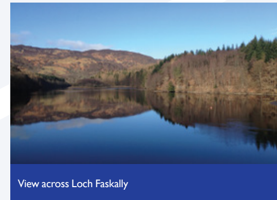
View across Loch Faskally