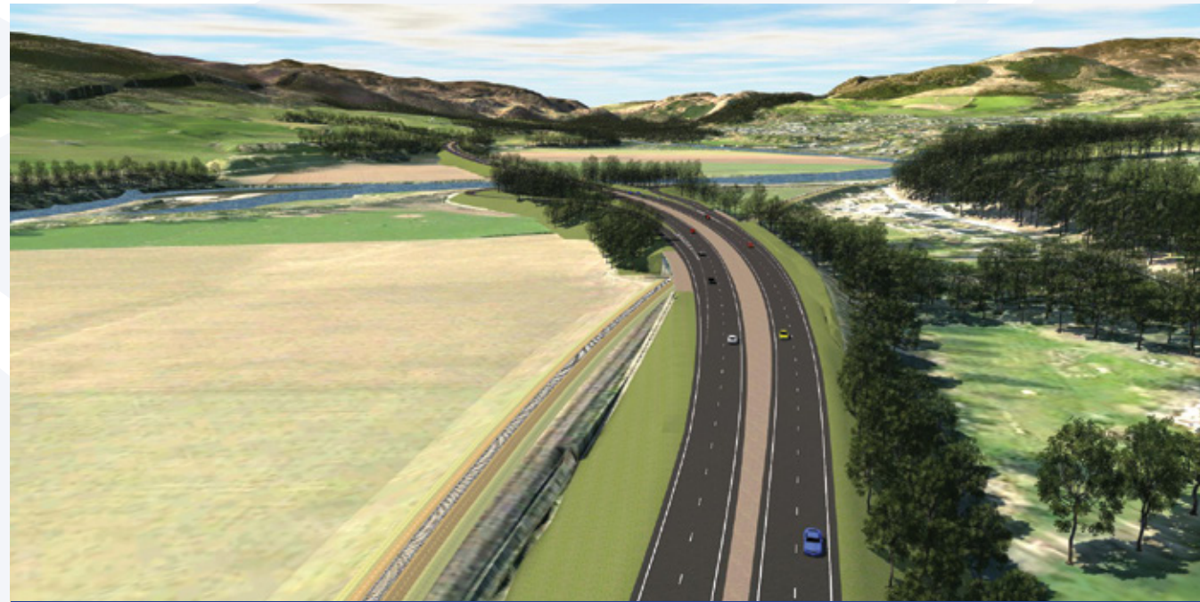
Approach to Pitlochry South junction

Further consultation through local drop-in sessions and one-to-one meetings is planned during the DMRB Stage 3 Assessment and we will keep you updated through a range of direct communications and consultations.