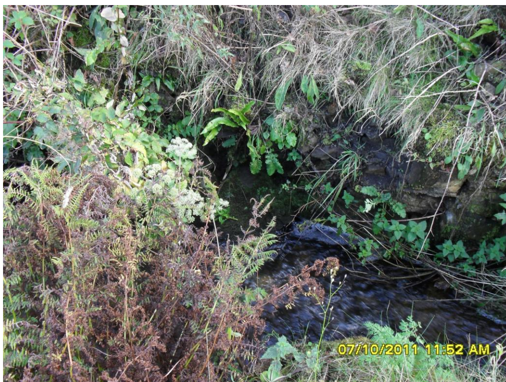
Photograph 12.1: Surface Water drainage ditch adjacent to A737 and Auchengree Road