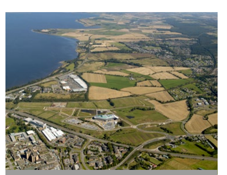
Looking east from Inshes towards Smithton

The options assessment (DMRB Stage 2) process for the A9/A96 Inshes to Smithton scheme has been completed.