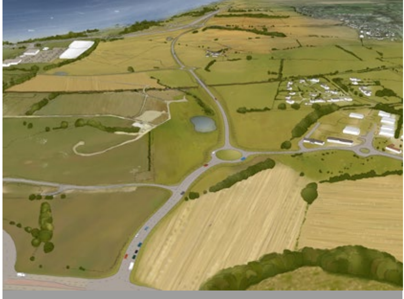
Artist's impression of Preferred option - variant A