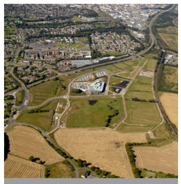
Looking west from Cradlehall towards Raigmore

This leaflet provides an overview of the outcome of the option assessment work, and the preferred option for the for the A9/A96 Inshes to Smithton scheme.