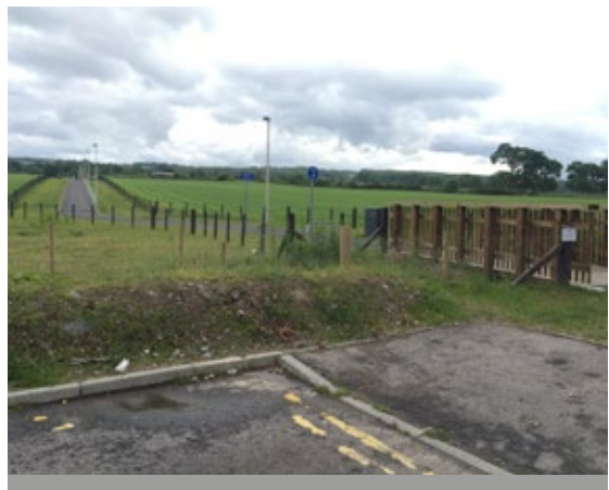
Existing NMU provision linking Inverness Retail and Business Park to UHI

Further consultation will also be undertaken with statutory bodies and other consultees.