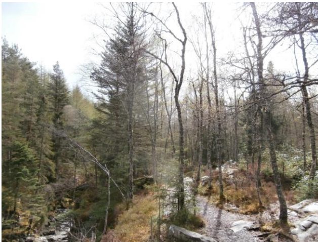
Photograph 15.9: View south from Lower Falls of Bruar Footbridge towards the existing A9.