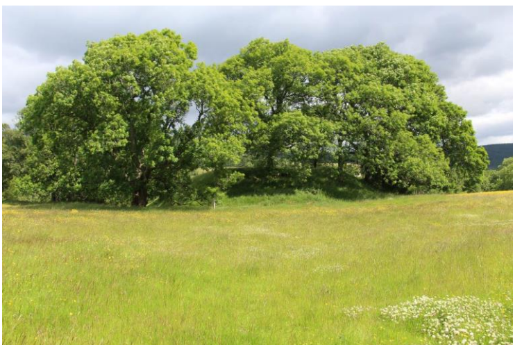
Photograph 15.2: Tigh an Tom Mhoir Motte (Asset 595)