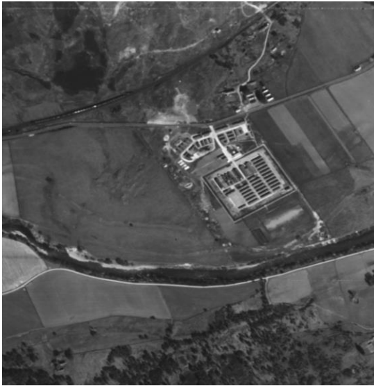
Photograph 15.3: Prisoner of War Camp No. 66 (Asset 442)