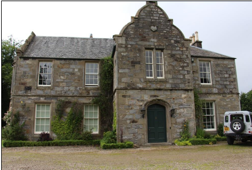
Photograph 15.4: Urrard House (Asset 341) south-eastern principal elevation

House itself being built on or close to the site of an earlier house associated with the Battle of Killiecrankie (Asset 344, Figure 15.1a). Taking the designation of Urrard House itself and the good state of preservation and legibility of the group within the landscape, the value of all four assets has been assessed to be medium.