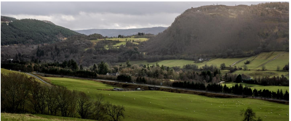
Photograph 15.6: View from the southern slopes Craig Eallaich towards Urrard Steading (centre of photograph) (Asset 342) the approximate location of the centre of the Government line.