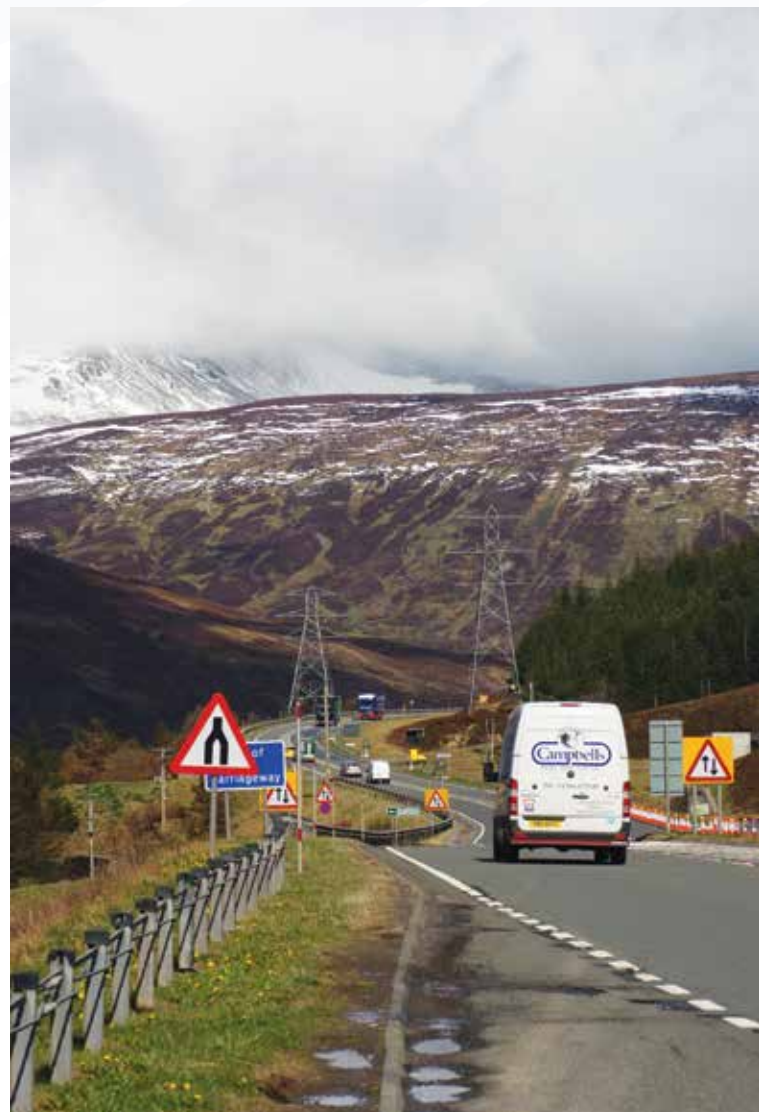
The A9 at Glen Garry.