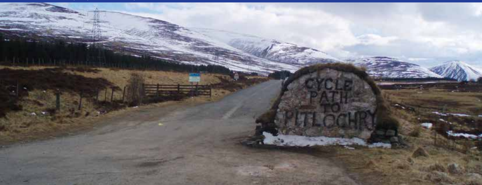
Cycle path to Pitlochry beside the A9.

Communication will be carried out on a regular basis, and depending on its nature, could be undertaken in a variety of ways including newsletters, letters, web updates and meetings.