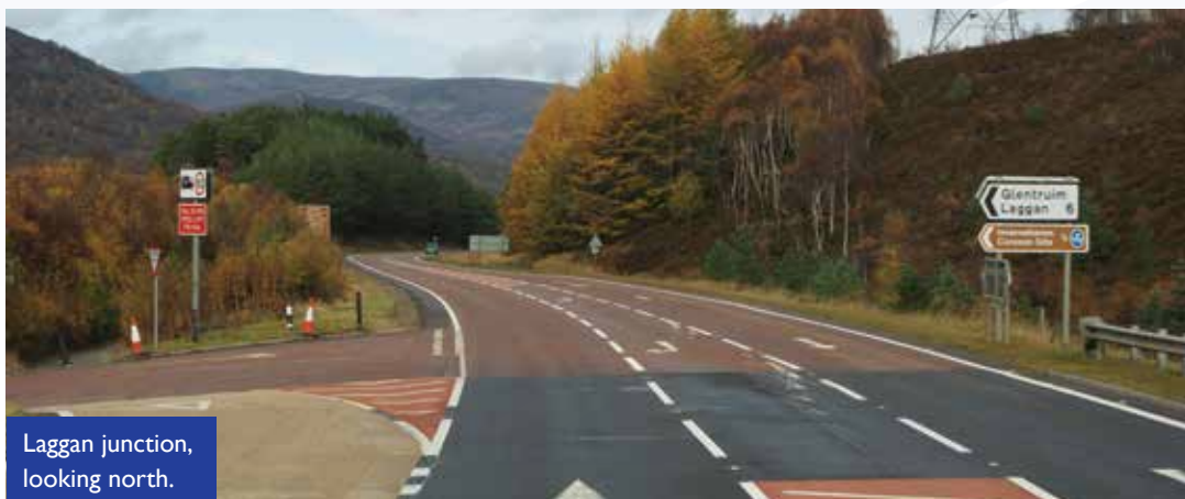
Laggan junction, looking north.