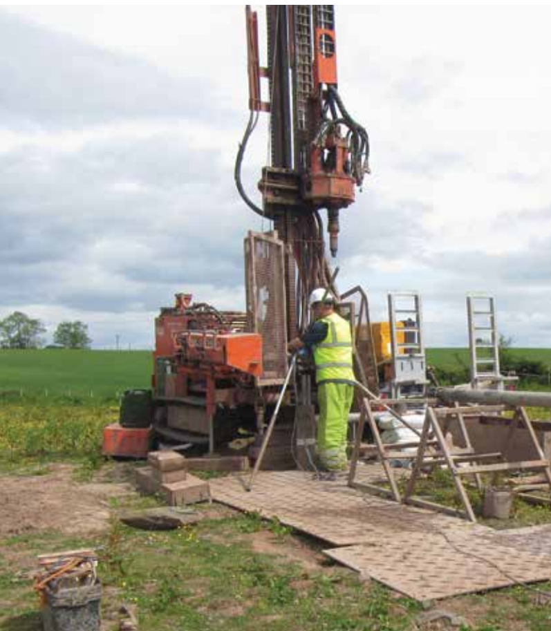
A9 Dualling Programme, ground investigation borehole.