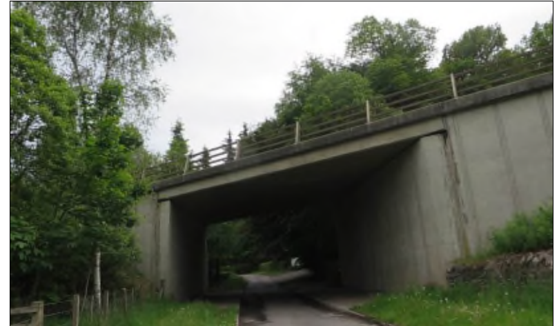
Photograph 9.5: Foss Road Underbridge location of existing crossing point CP03, NCR 7