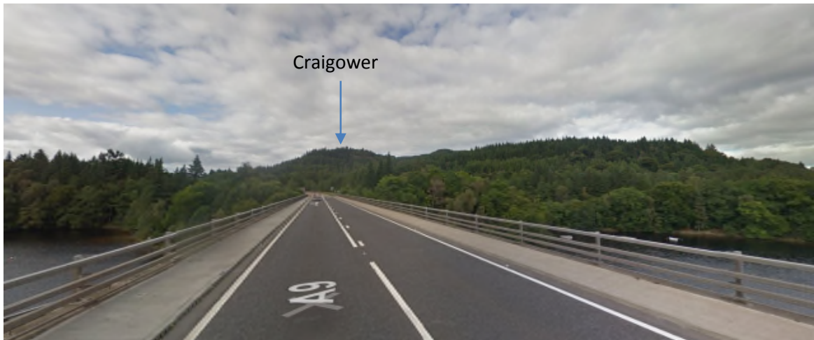
Image from Google Street View captured September 2016 © 2017 Google