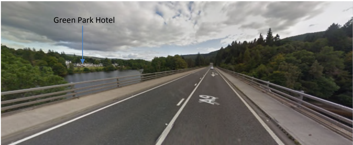
Image from Google Street View captured September 2016 © 2017 Google

9.3.34 South of the bridge, the view becomes restricted on both sides by roadside woodland. The view ahead is towards Carra Beag. Tall roadside conifers continue to block views on both sides before the view opens slightly on the southbound side due to the wide grass verge where the road passes Balmore (ch3800 to ch3300). Views on the northbound side remain restricted by woodland. As the road passes the southern end of Loch Faskally, any potential views on the southbound side of the road of Pitlochry Dam are restricted by roadside woodland as the road curves south-east. There is a glimpsed view of Fonab Castle Hotel (ch3100) before the view becomes restricted by a dense hedge. Views on the northbound side remain restricted by mixed species roadside woodland throughout this section of road.