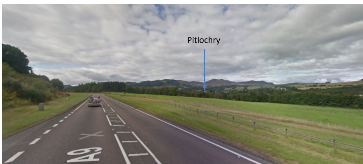
Photograph 9.12: Lay-by Ref no 1