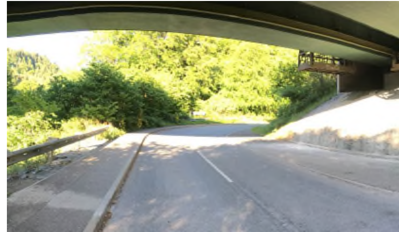
Photograph 9.7: Clunie Underbridge location of existing crossing point CP05, Path 82