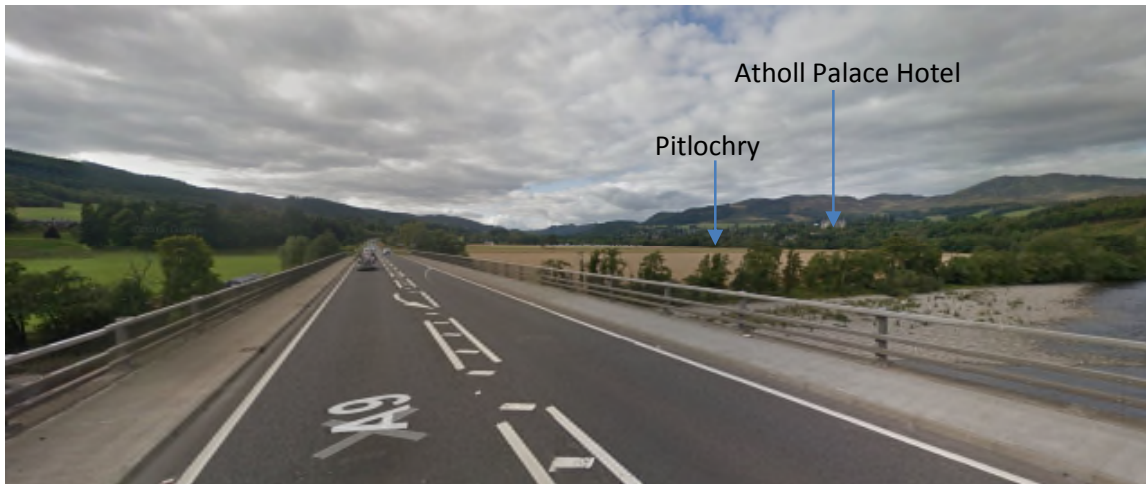
Image from Google Street View captured September 2016 © 2017 Google