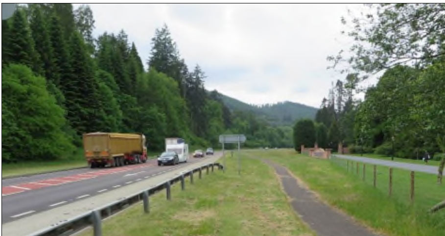
Photograph 9.3: Local path 76a alongside the existing A9 between Pitlochry Festival Theatre and Core Path 76