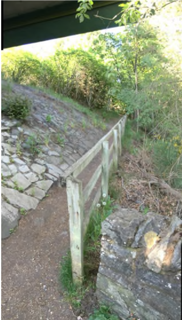
Photograph 9.8: Core path (Path 84) under Clunie Road Bridge on north side of Loch Faskally, location of crossing point CP06