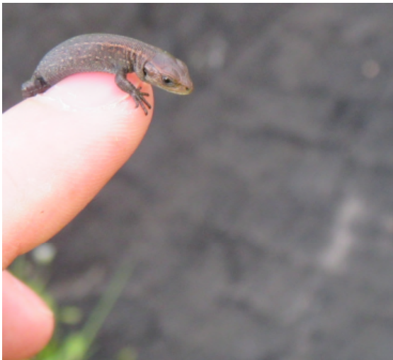
Photograph 12.2: Juvenile common lizard found in Site 2