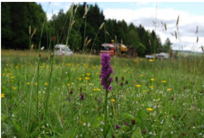
Photograph 12.3: Northern marsh-orchid recorded within the study area, on the road verge, north of Middleton of Fonab.

12.3.45 Relevant target notes (Transport Scotland, 2015b) are provided in Table 16 in Appendix A12.2 (Baseline Data and Detailed Survey Methods), and shown on Figure 12.2.