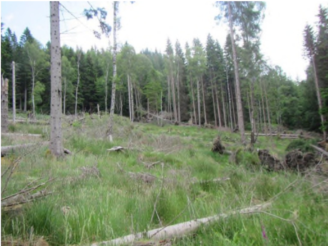
Photograph 12.1: Plantation conifer woodland north of Craiglunie, with areas of thinning and windthrow evident

12.3.11 Parcels of habitats that have the potential to contribute to foraging, nesting, breeding and/or commuting habitat for faunal species of conservation importance are included as part of the assessment for the relevant species.