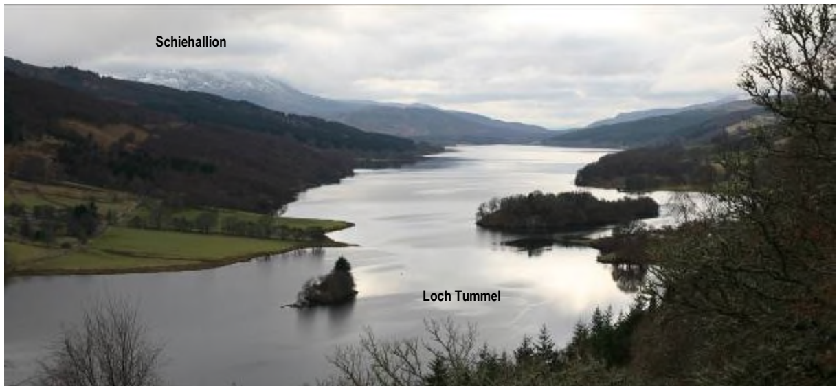
Photograph 13.1: Queen's View, Loch Tummel NSA

13.3.8 The NSA is dominated by hills and woodland, which reduce the visual intrusion of roads, rail and hydro-electric infrastructure within the designation. These key features are generally contained within the NSA by the surrounding rugged hills, which restrict visibility south and north to the existing A9, and from Loch Tummel there is a strong sense of enclosure and seclusion. The primary views from the loch, particularly from the elevated viewpoint of the Queen's View, are along the strath to the west and south-west to more distant dramatic hills and mountains as illustrated in Photograph 13.1 below. These long views along Loch Tummel contrast with the intimacy of the landscape created by the areas of woodland cover.