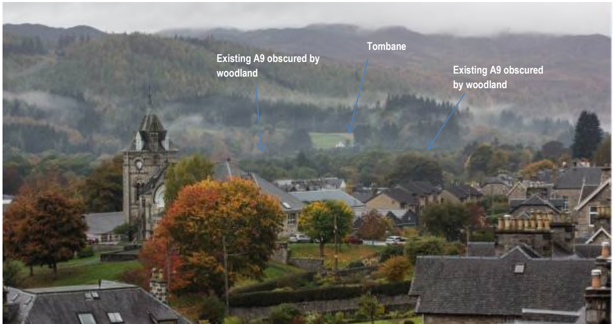
Photograph 13.4: View from the Pitlochry Youth Hostel illustrating the character of the Strath Tummel: Pitlochry (Settlement) LLCA