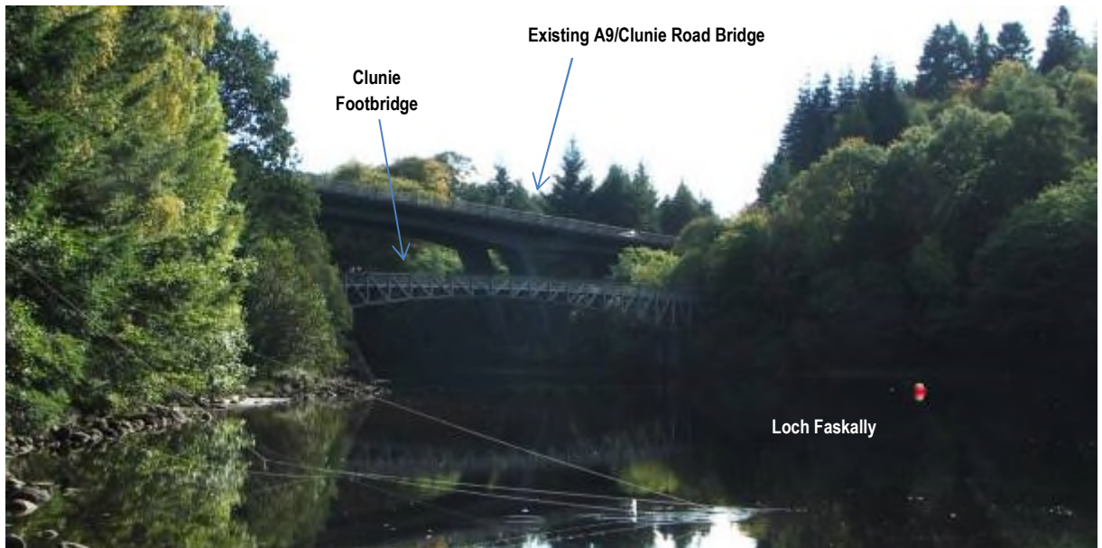
Photograph 13.8: View of the Clunie Road Bridge and Footbridge from the shore of Loch Faskally.