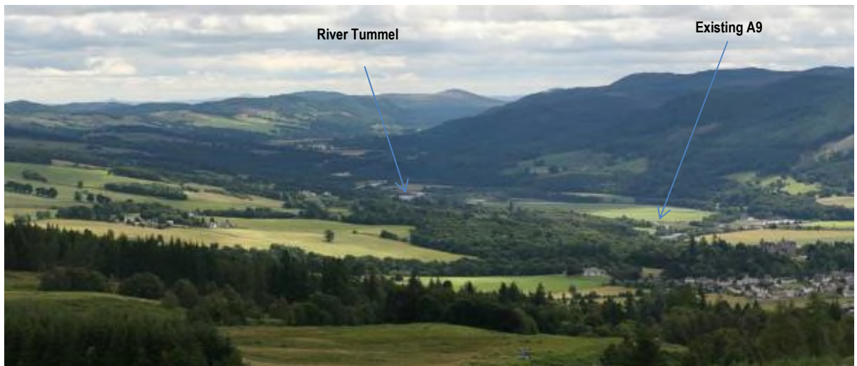
Photograph 13.2: View looking south from the slopes of Ben Vrackie illustrating the character of the Strath Tummel LLCA