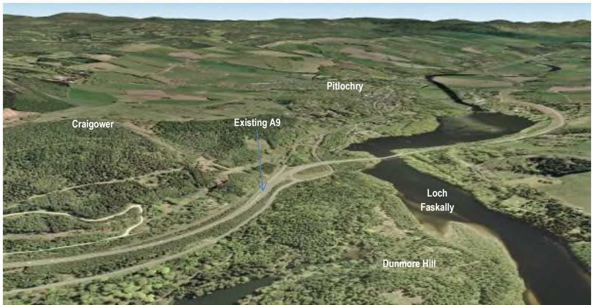
Image 13.1: View overlooking the existing A9, Dunmore Hill and Loch Faskally