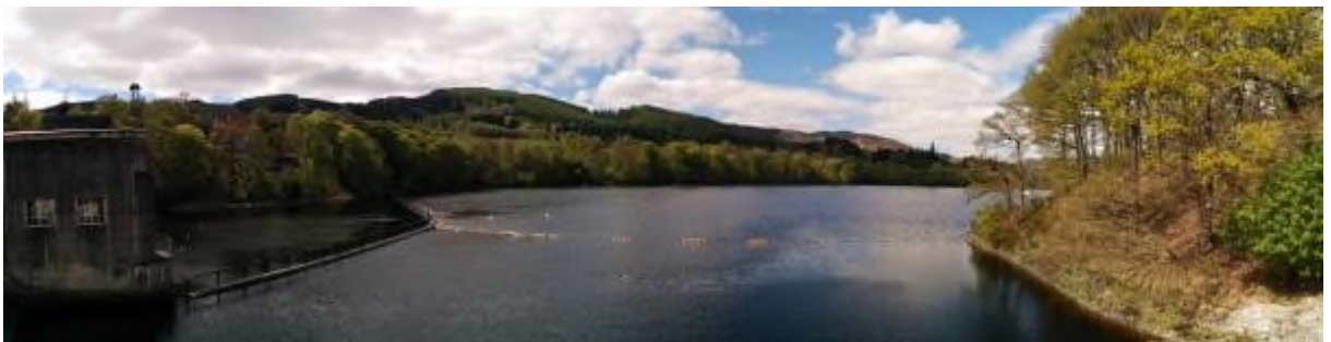
Photograph 13.5: View looking north-west across Loch Faskally from Pitlochry Power Station Dam