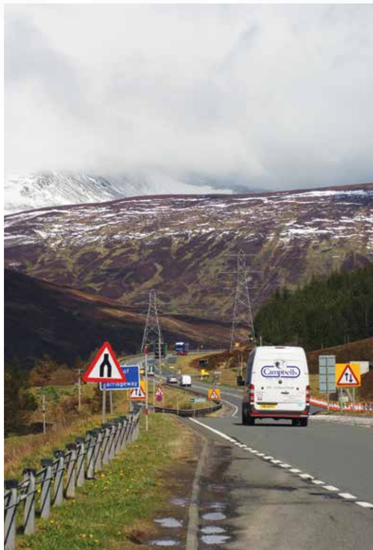
The A9 at Glen Garry.