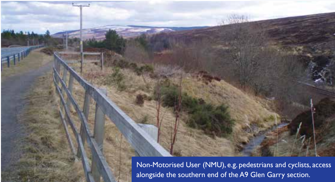
Non-Motorised User (NMU), e.g. pedestrians and cyclists, access alongside the southern end of the A9 Glen Garry section.

Feedback from all consultation events will be recorded, including how the information provided has been taken into account in the development of the project.