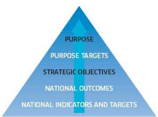
Figure 2.1: The Scottish National Performance Framework

In order to establish how policy measures contributed towards the Purpose, the Scottish Government designed a National Performance Framework, a tiered approach highlighted in Figure 2.2: