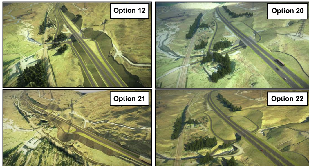
Figure 3-3: Dalnaspidal Junction options taken through DMRB Stage 2 comparative assessment