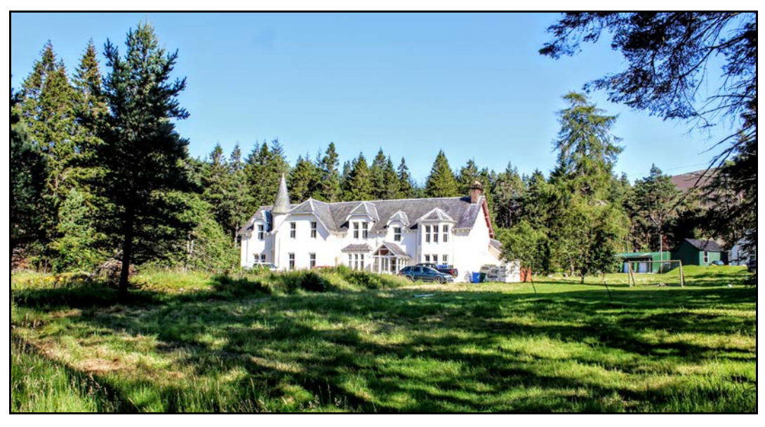
Photograph 15-2: Drumochter Lodge (Asset 7.18) looking north-east

this manner, the designed landscape was deliberately used to provide a dramatic backdrop to the estate by creating a feeling of romanticised wildness, associated with Victorian-era shooting parties and outdoor leisure pursuits. Drumochter Lodge is a good example of a Victorian Scottish hunting lodge in keeping with regional building traditions and local vernacular, which is surrounded by a surviving and near complete designed landscape. In consideration of this, this asset has been assessed to be of medium value .