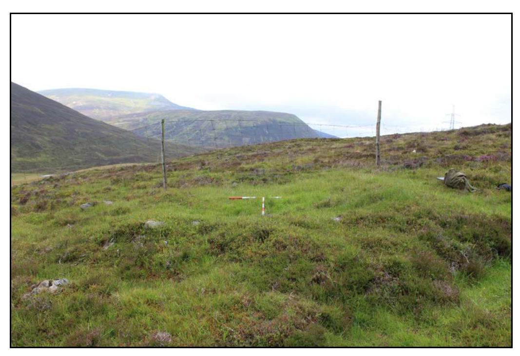
Photograph 15-1: Remains of dwelling/ shieling hut (7.22) looking south-east

Tarlow 2012). Due to their ability to aid our understanding of the varying seasonal exploitations of land locally, these assets have been assessed as having a low value .