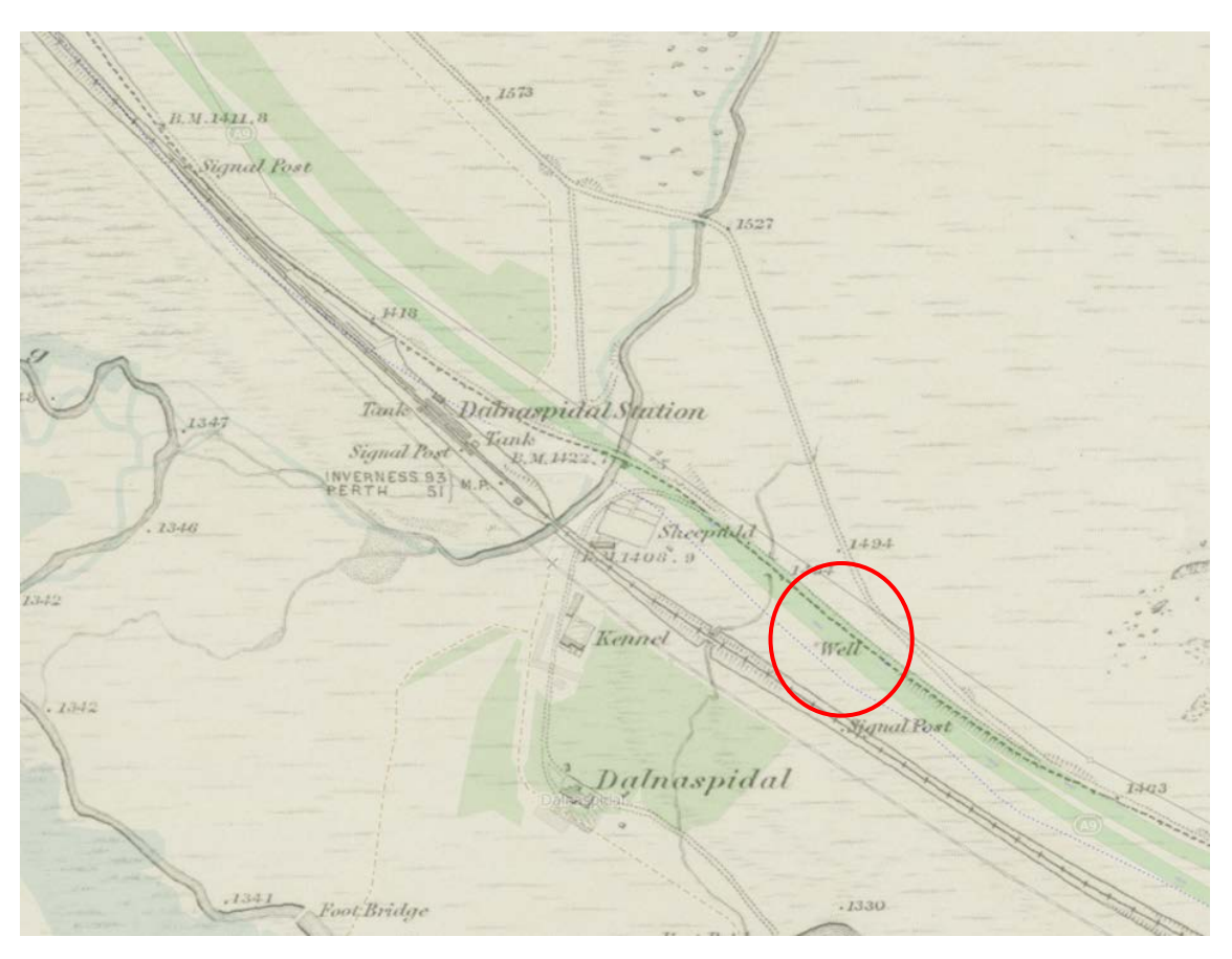
Figure 6.1.2: Roy Highlands 1747-52: Dalnaspidal and Drumochter

6.1.2 Dalnaspidal Lodge, station and farmstead (with kennels) can be seen. A well, which is not recorded on the HER has been circled. It is likely that this well would have been removed by the construction of the A9. The Oxbridge can be seen to the north, but there is no evidence for the Dalnaspidal shielings.