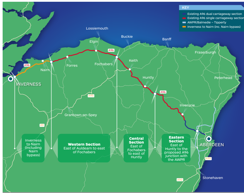
An overview of the A96 Dualling Programme

We aim to complete the DMRB Stage 2 Assessment and announce a preferred option for the A96 Dualling Hardmuir to Fochabers scheme later in 2018.