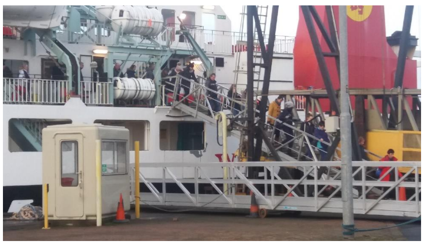
Photo 1. The gangway at Ardrossan showing a 45 of angle, which is extremely difficult for disabled travellers to negotiate.

The angle of a gangway and the surface of the gangway need to be carefully considered for all people with a disability. Wheelchair users cannot negotiate a surface which is uneven, those with a visual impairment need an obstacle free gangway and mobility impaired people often find steep gradients impossible. The Scottish Building Standards advise that 'Gradients of more than 1 in 12 are considered too steep to negotiate safely and are not recommended'.