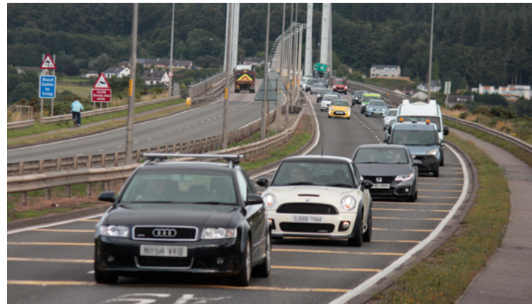
A9 looking north towards Kessock Bridge

Following the sifting process, options 1, 3, 4, 5 and 10 were taken forward to be designed and assessed during the DMRB Stage 2 Assessment.