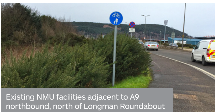
Existing NMU facilities adjacent to A9 northbound, north of Longman Roundabout

Suitable provision for NMUs is an important part of the scheme. The NMU design will be developed and incorporated through the DMRB Stage 2 Assessment in consultation with interested groups. The NMU provision will integrate with the existing network to facilitate active travel and with public transport facilities where possible.