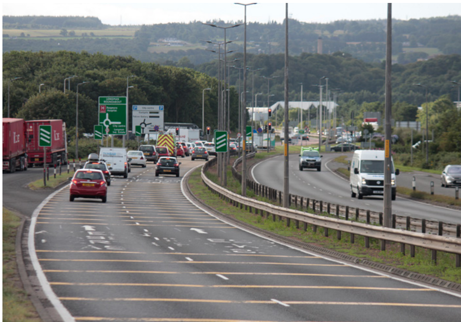
A9 approaching Longman Roundabout, looking south