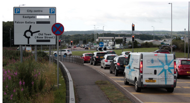
A9 approaching Longman Roundabout from the north