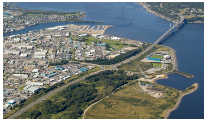
Aerial photo of Longman Roundabout and the surrounding environment