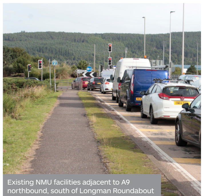
Existing NMU facilities adjacent to A9 northbound, south of Longman Roundabout