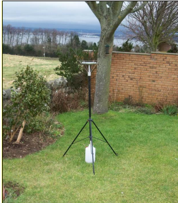
Figure 1: Example of an Installed Frisbee Gauge Meter