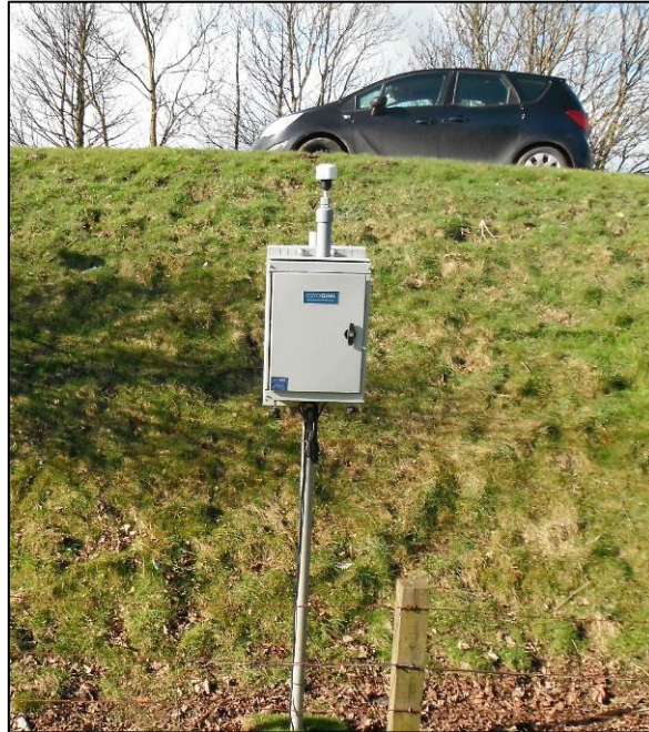
Figure 2: Example of an installed Automatic Light Scatter Dust Meter