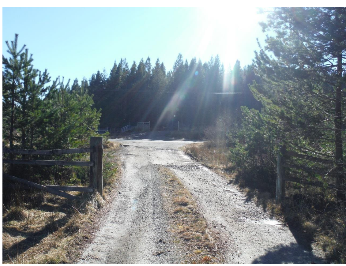
Photograph 37: at-grade crossing of the A9 on Other NMU Route 16