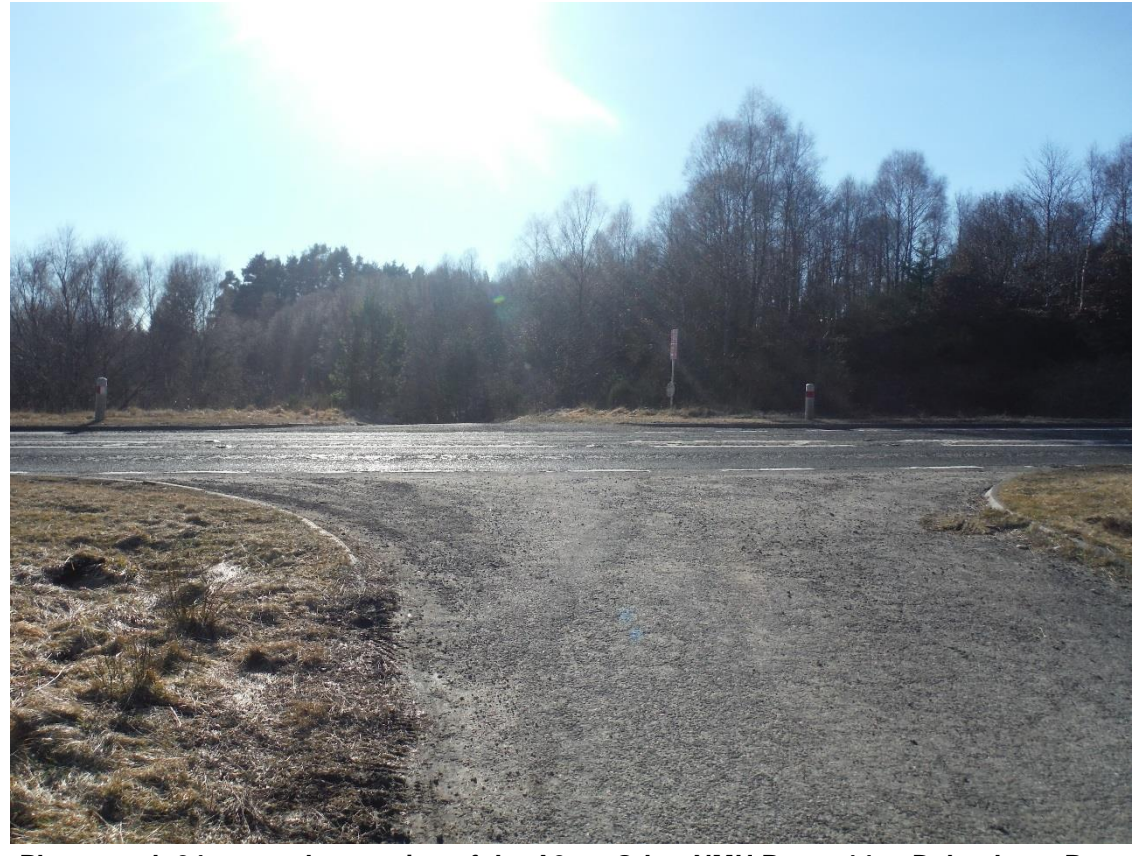
Photograph 34: at-grade crossing of the A9 on Other NMU Route 14 at Dalrachney Beag