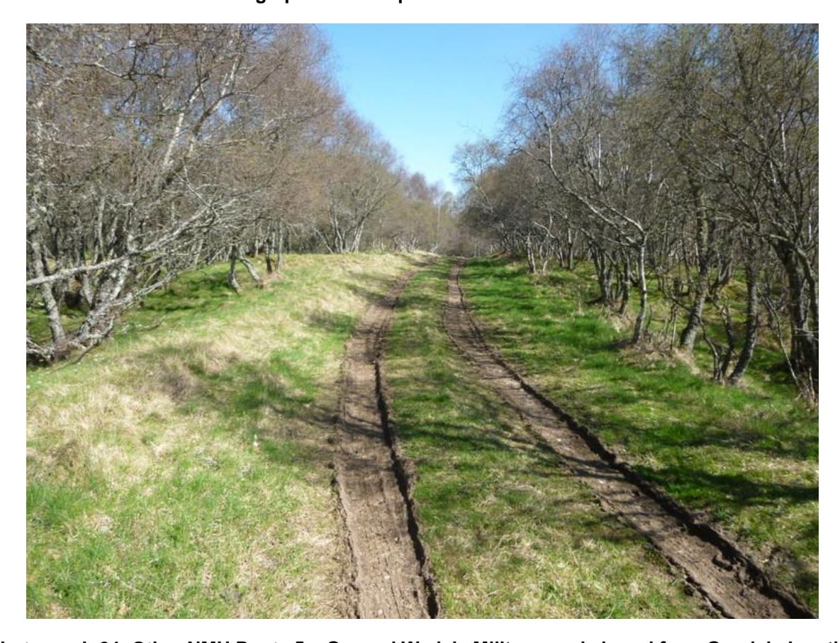
Photograph 24: Other NMU Route 5 – General Wade's Military road viewed from Granish Junction looking south