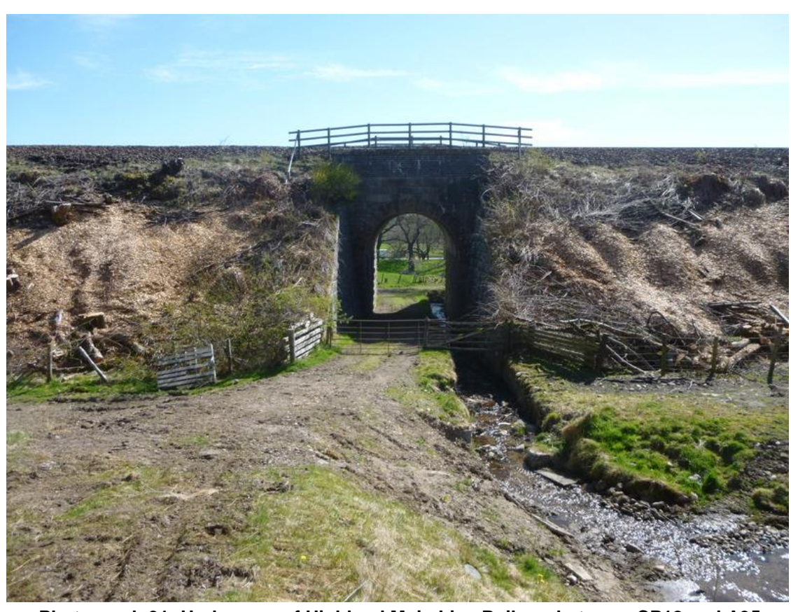
Photograph 31: Underpass of Highland Main Line Railway between CP12 and A95