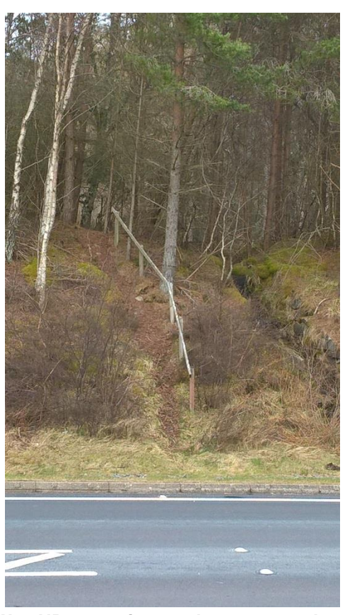
Photograph 17: Right of Way HB48 routing up the verge on the northbound side of the A9