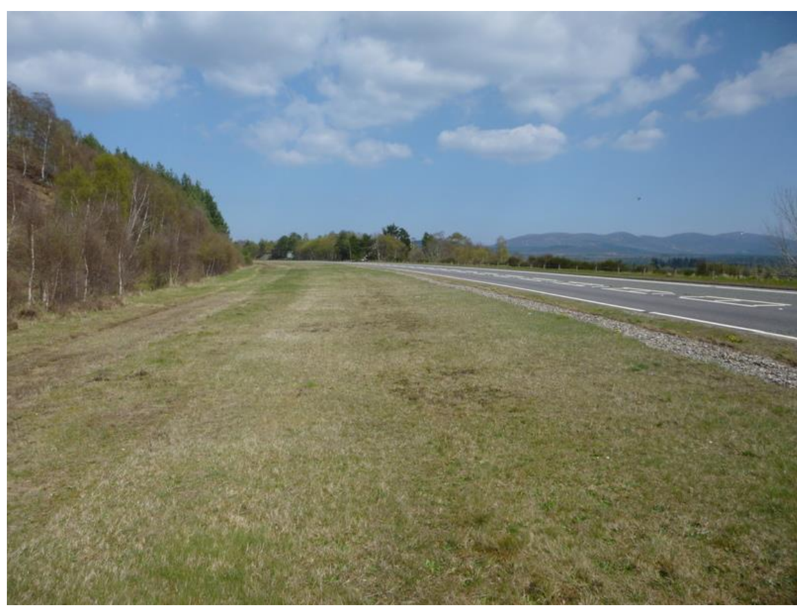
Photograph 15: HB83 looking along northbound carriageway