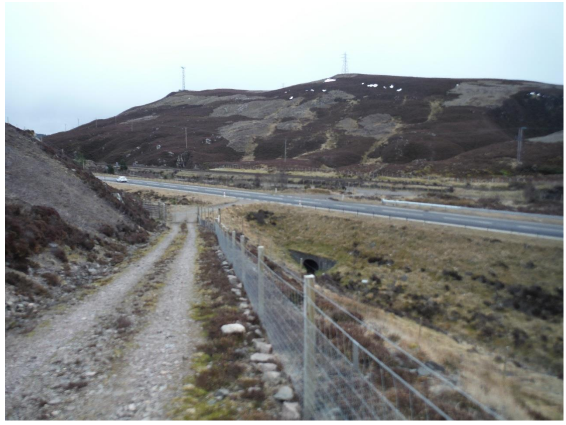
Photograph 22: view of the at-grade crossing of the A9 at Slochd Summit from Right of Way Hi110