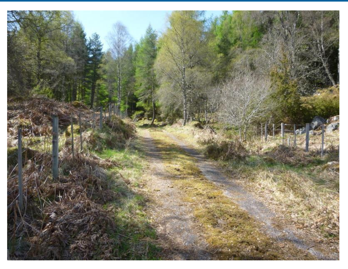
Photograph 27: Forestry tracks at Other NMU Route 9