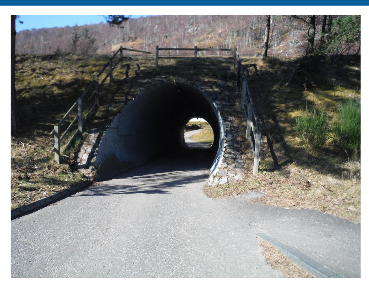
Photograph 13: Existing underpass which provides access from the southern end of Aviemore to HB83