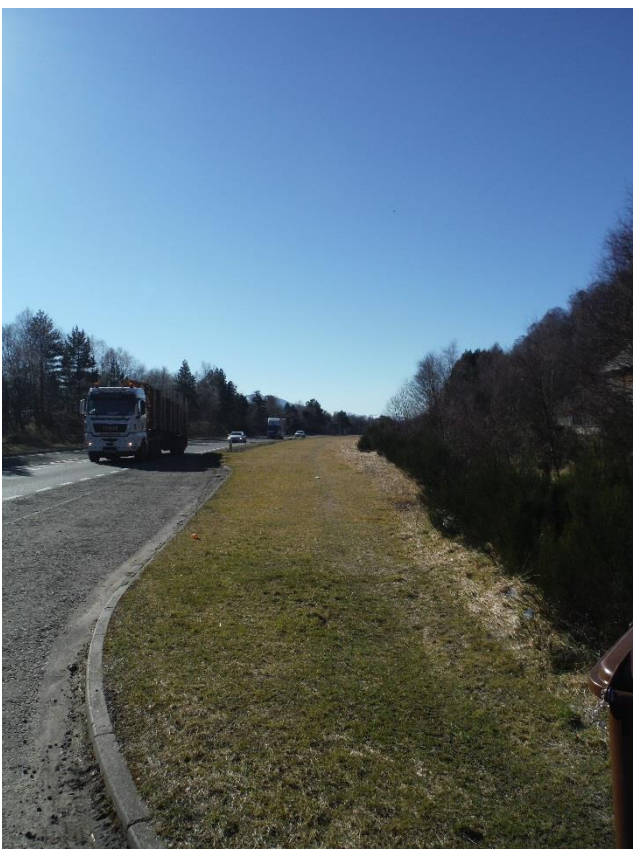
Photograph 14: Right of Way HB83 along the northbound verge of the A9