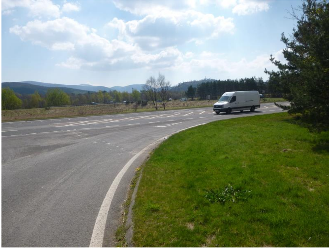
Photograph 12: At-grade junction of the A9 at Aviemore South which provides access to HB45