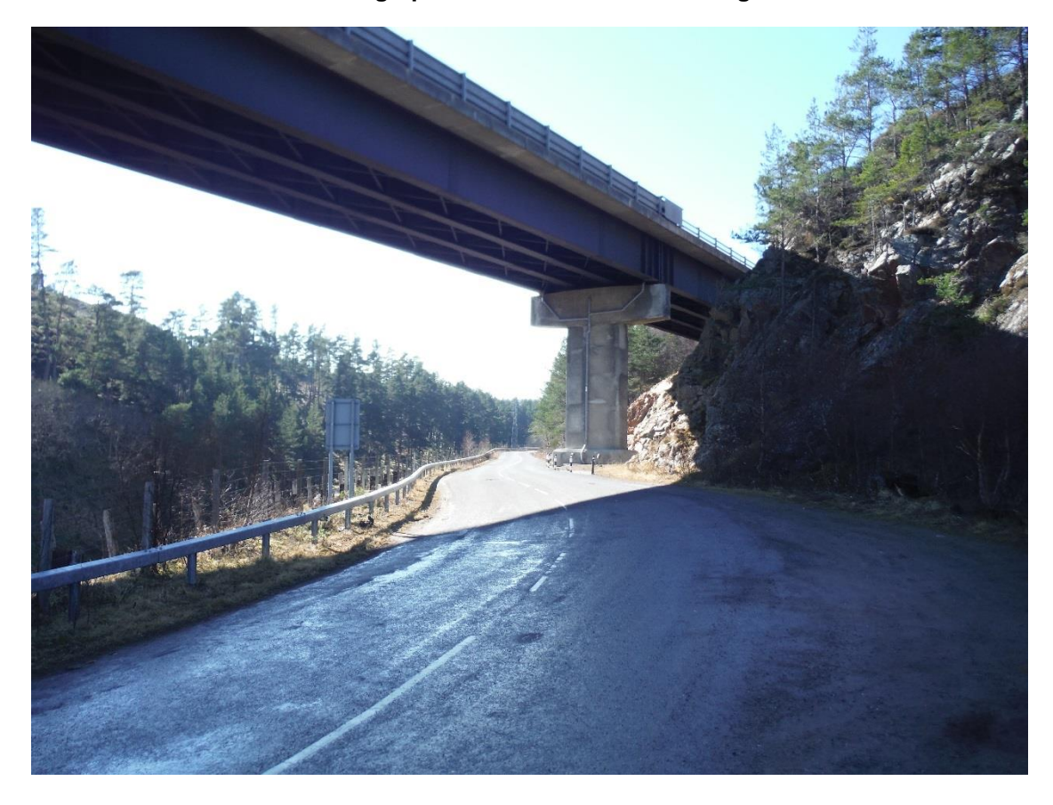
Photograph 8: NCN7 at Slochd an Beag (2)