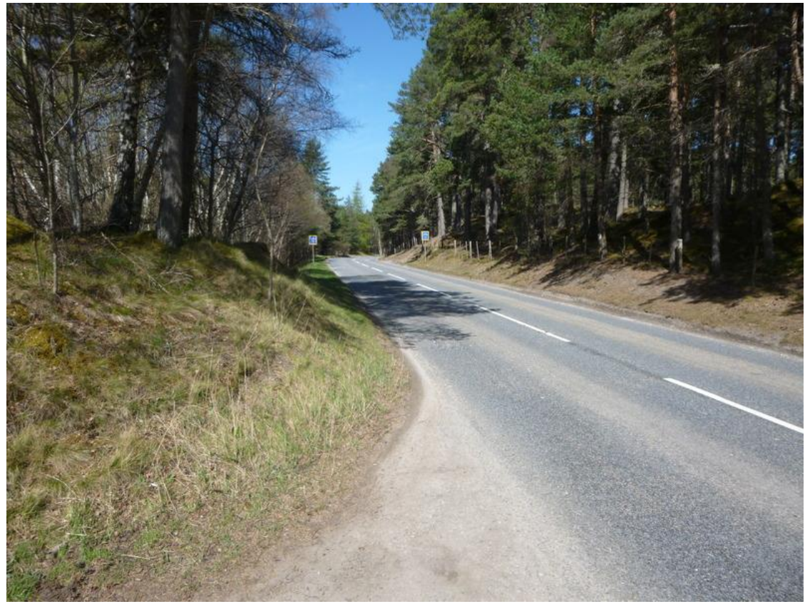
Photograph 32: Other NMU Route 12 junction with NCN7/B9153