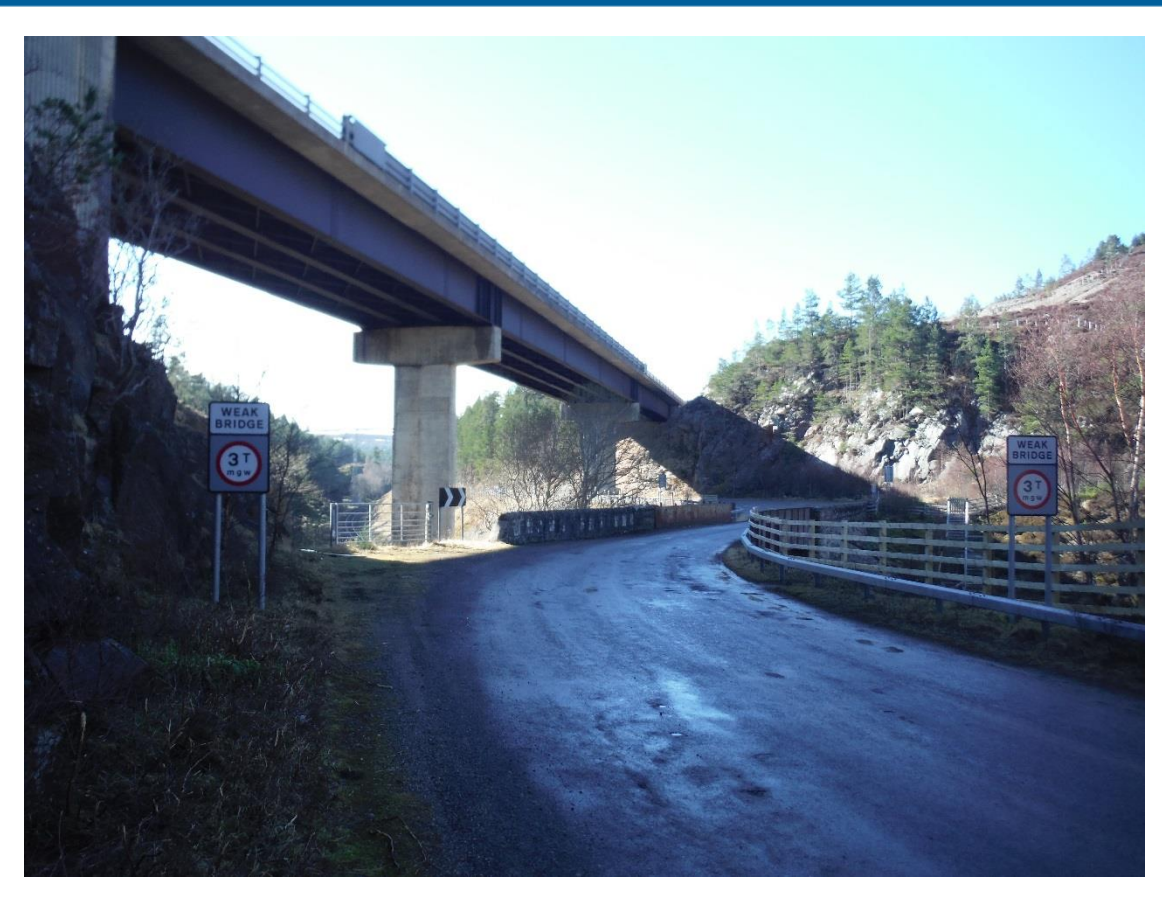
Photograph 7: NCN7 at Slochd an Beag