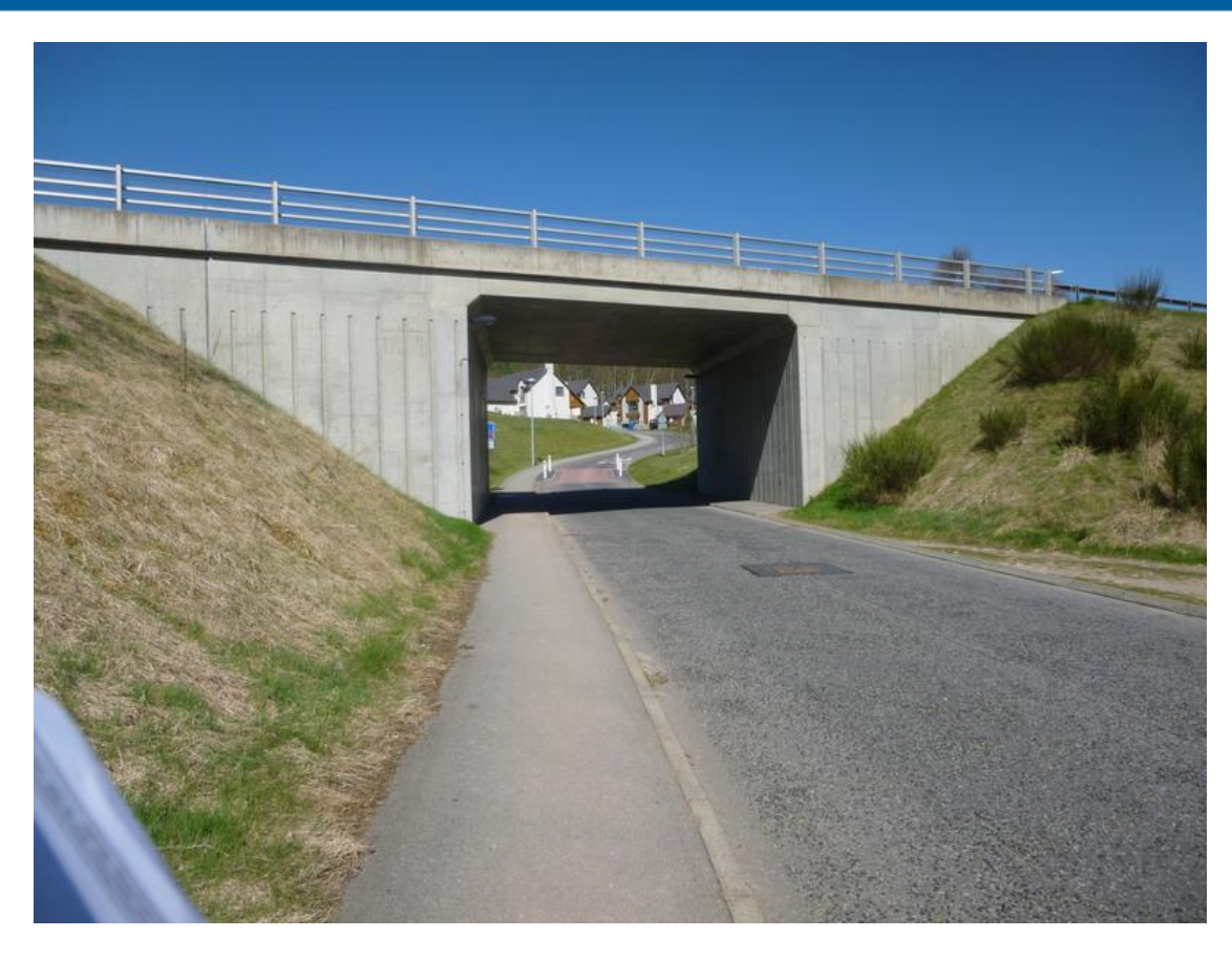
Photograph 3: NMU and vehicular grade separated crossing (CP8) from LBS30 to High Burnside