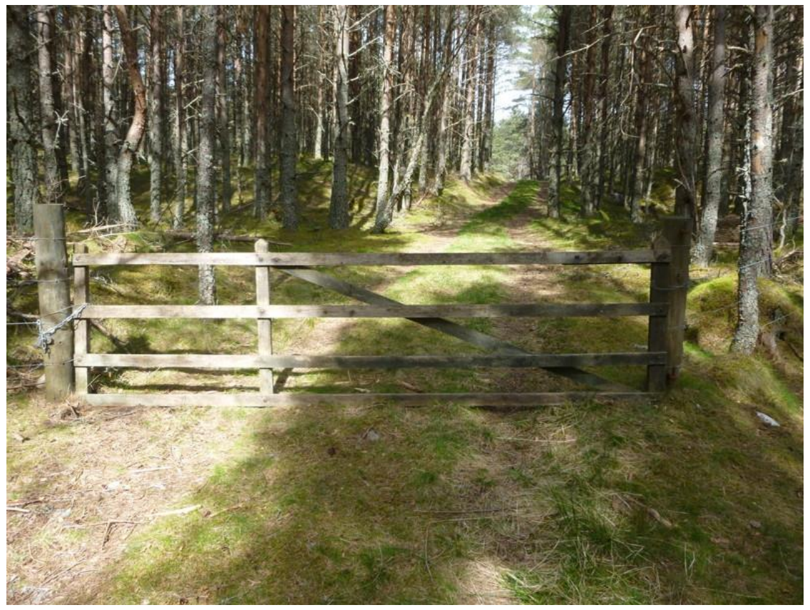
Photograph 26: gated entrance to Other NMU Route 5 at its junction with Other NMU Route 6