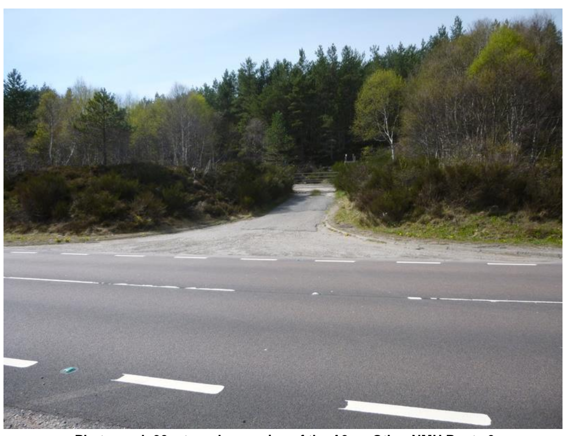
Photograph 30: at-grade crossing of the A9 on Other NMU Route 6