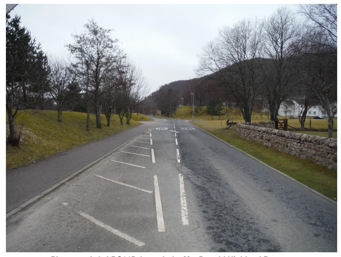
Photograph 6: LBS145 through the MacDonald Highland Resort