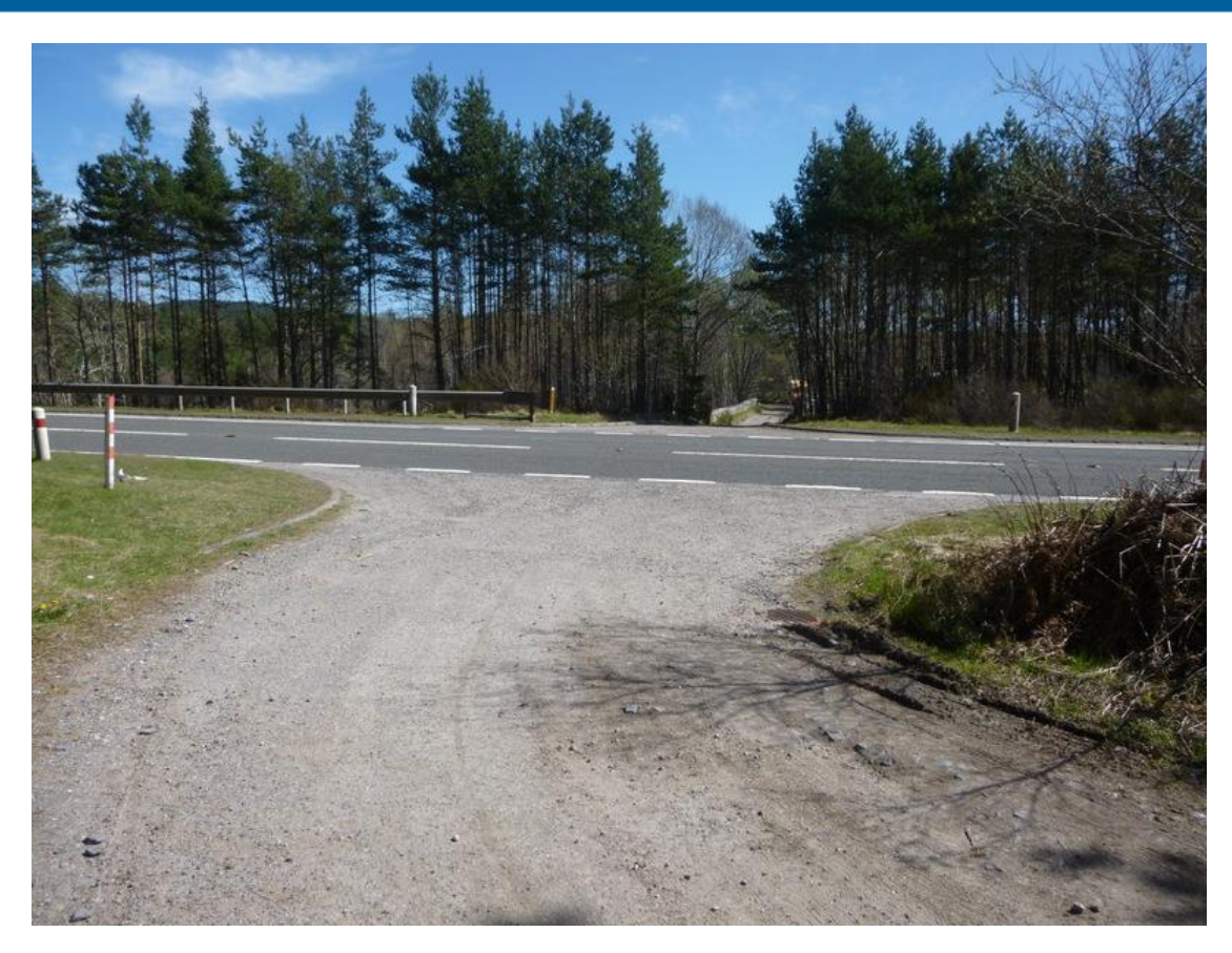
Photograph 19: Other NMU Route 12 Crossing of A9 at CP14