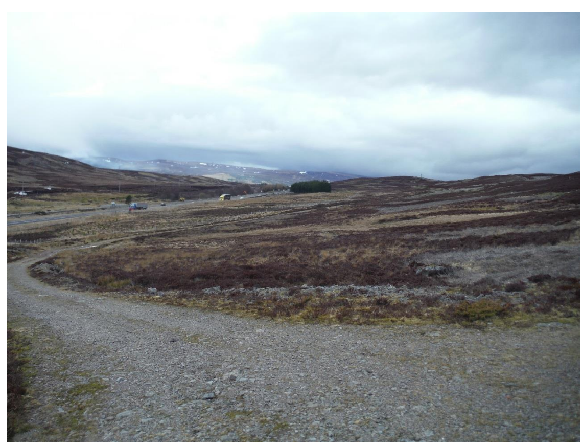
Photograph 39: Views along Other NMU Route 18