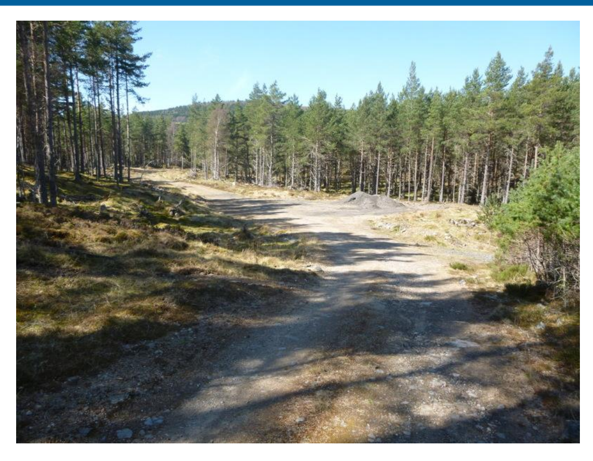
Photograph 33: Forestry tracks of Other NMU Route 13 looking west