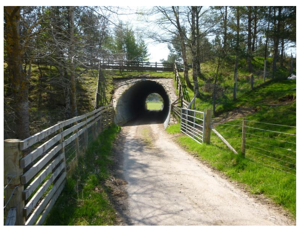
Photograph 23: underpass on Other NMU Route 1