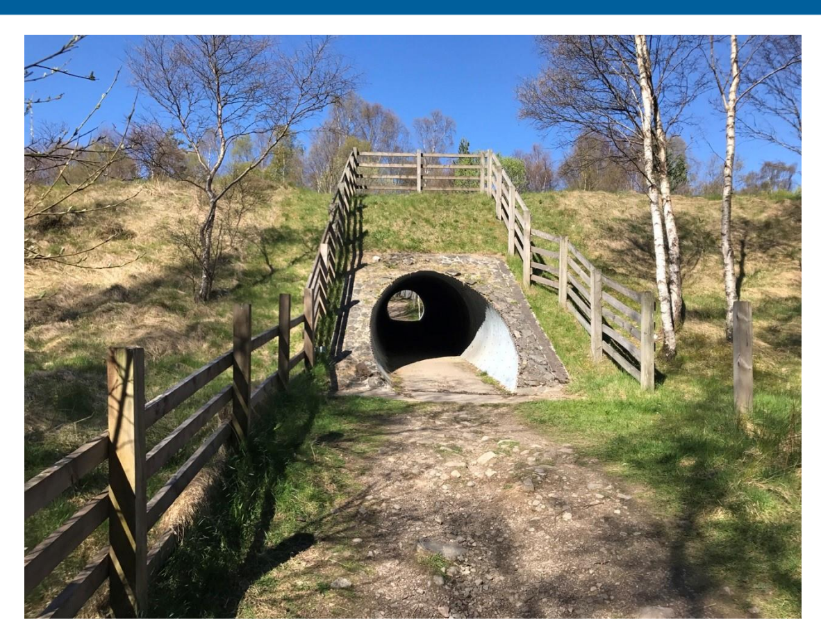
Photograph 1: Underpass between Core Path LBS30 and High Burnside