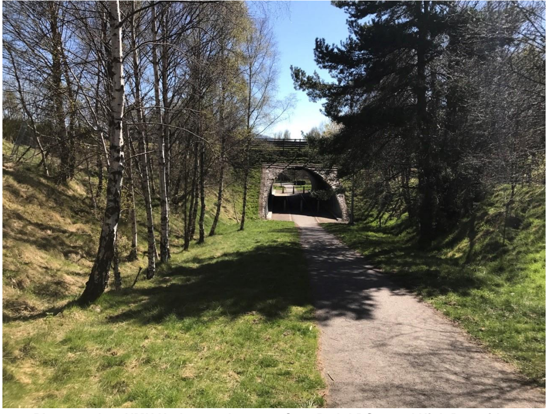
Photograph 2: NMU Underpass between Core Path LBS30 and High Burnside