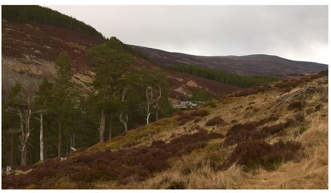
Photograph 38: Views towards the A9 from Other NMU Route 17