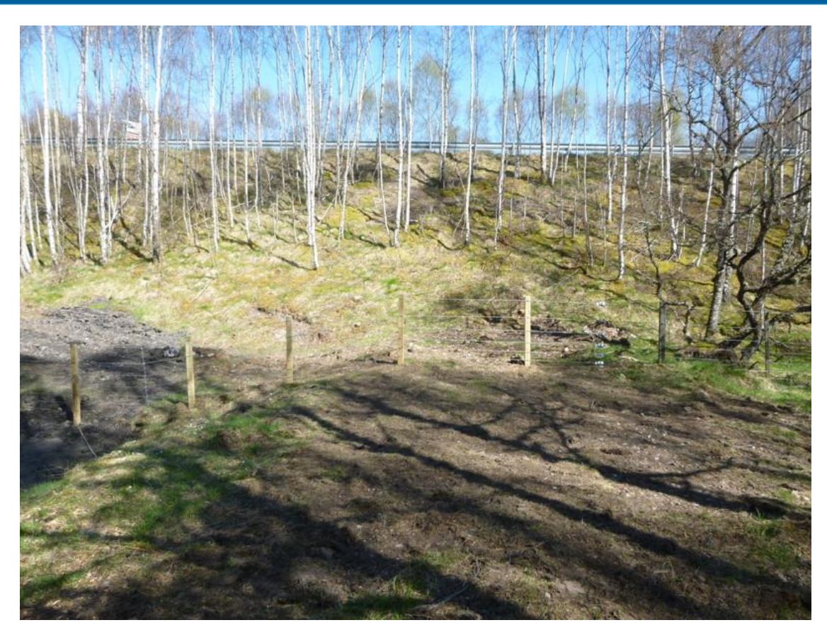
Photograph 25: Other NMU Route 5 from Granish Junction looking North