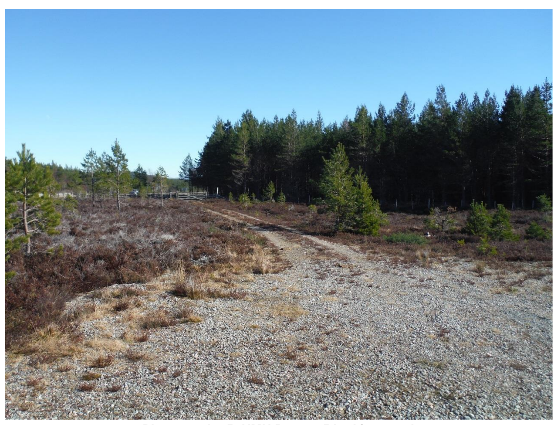
Photograph 35: NMU Route 15 looking south