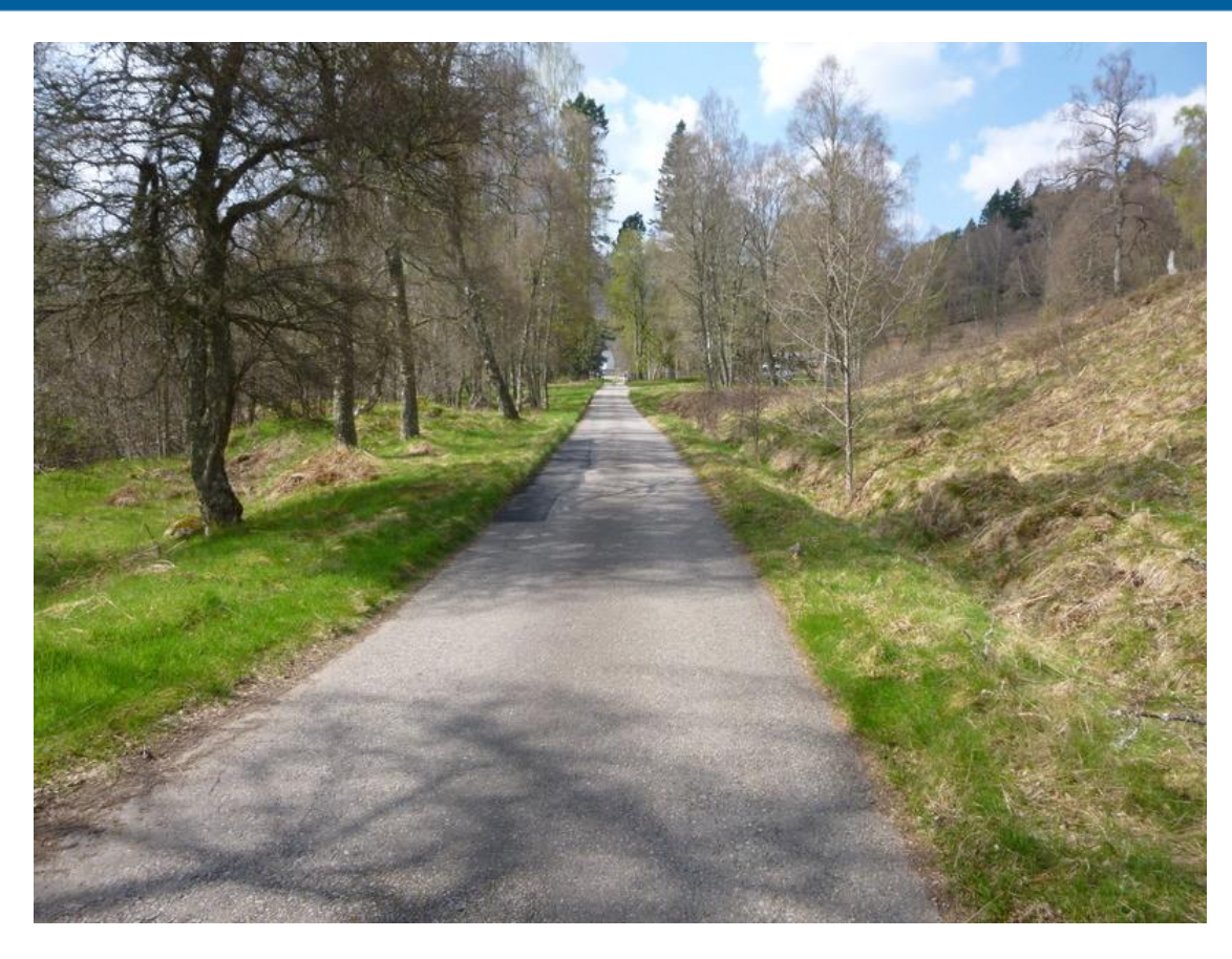
Photograph 11: Right of Way HB45, The Burma Road, looking towards Lynwilg Farm