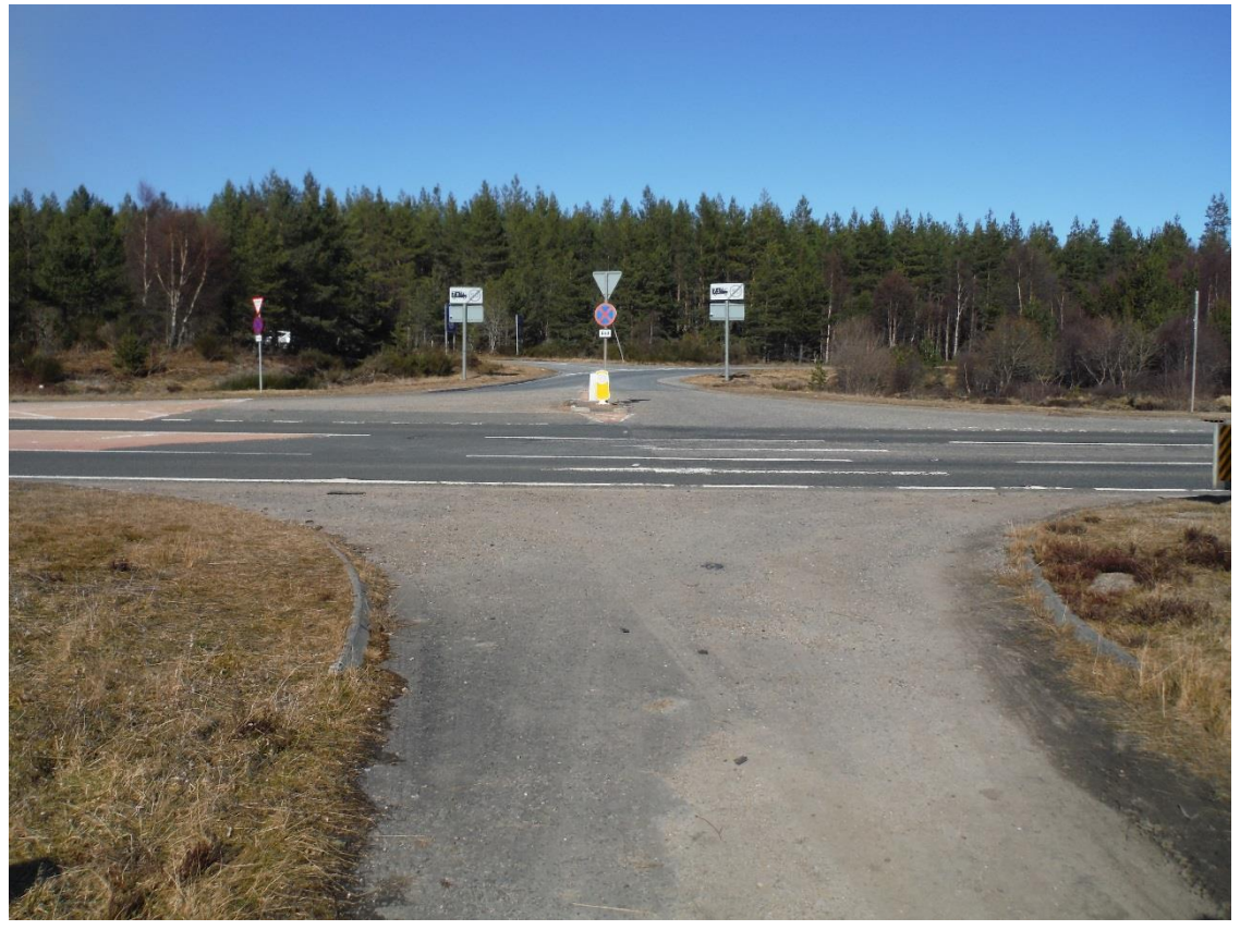
Photograph 36: at-grade crossing of the A9 at Black Mount on Other NMU Route 15