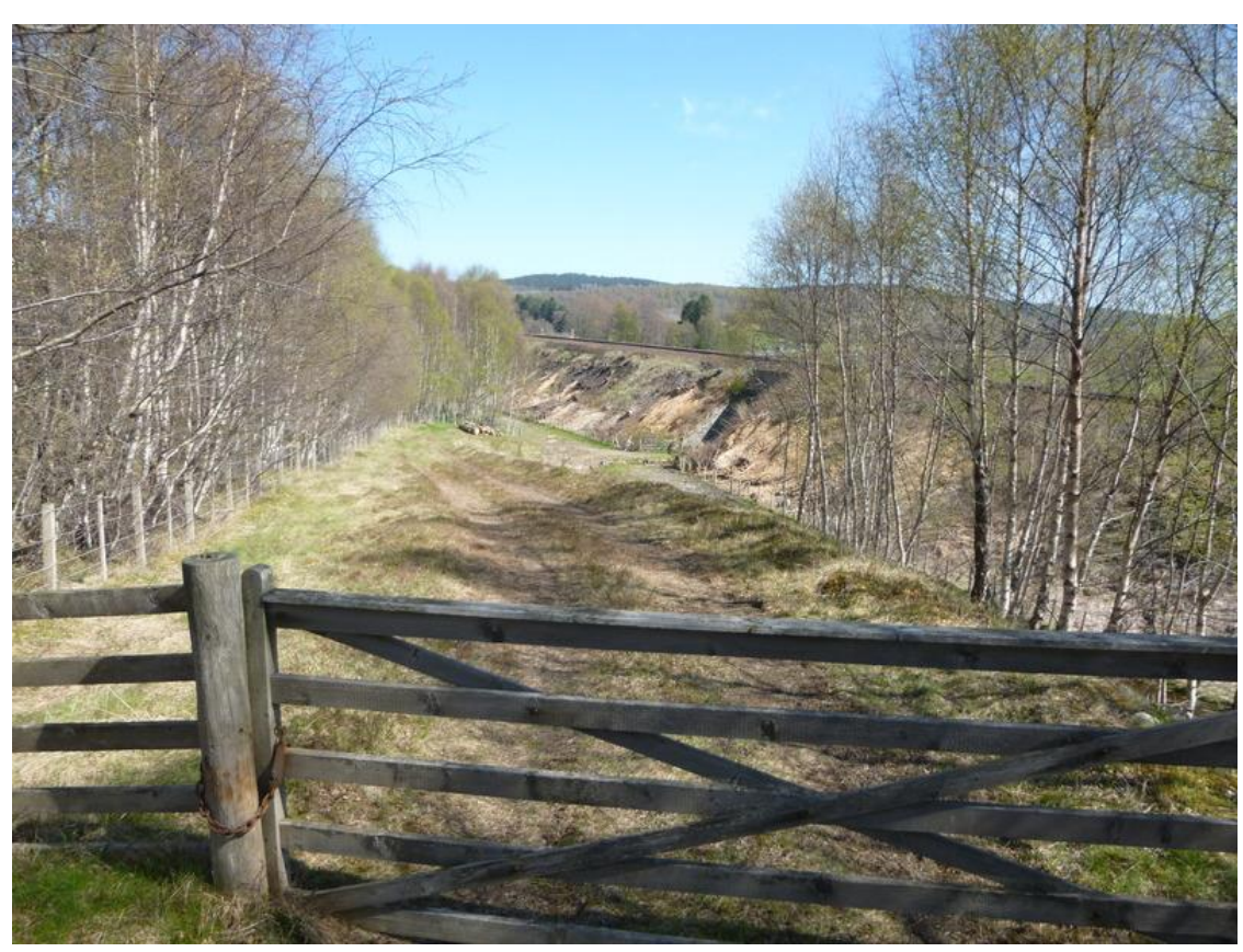
Photograph 29: CP12 towards Kinveachy