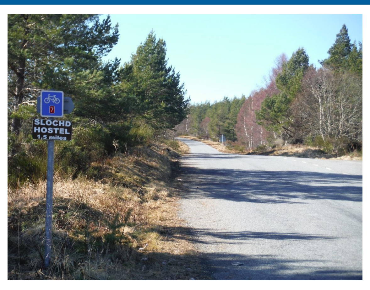
Photograph 9: NCN7 at Black Mount