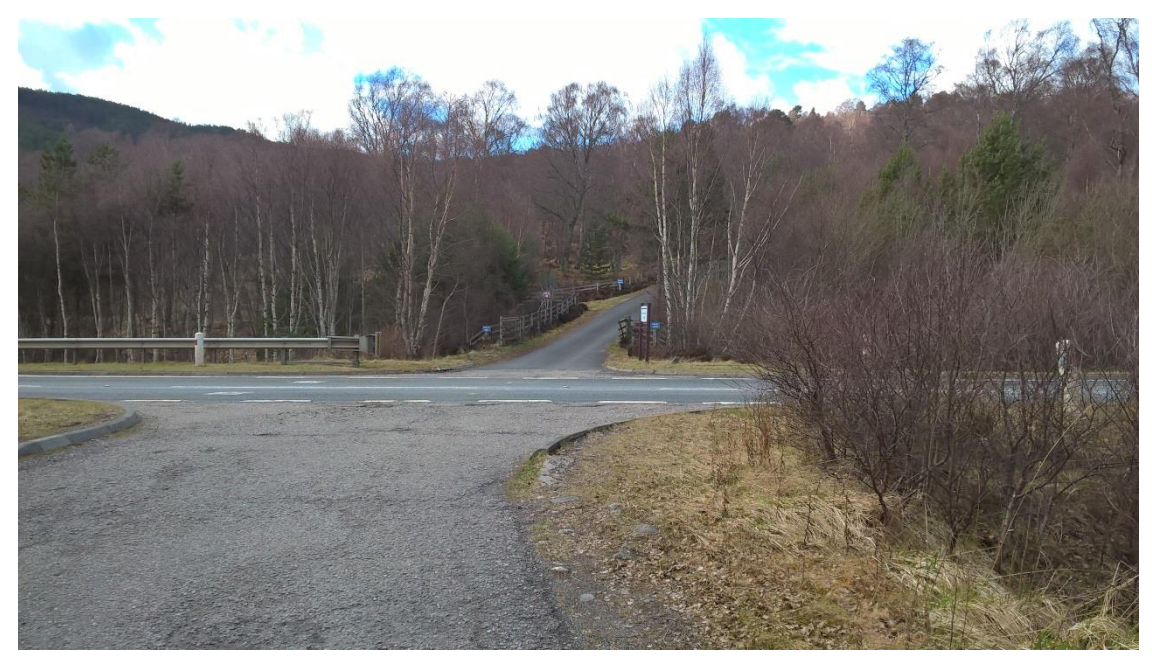
Photograph 20: at-grade crossing of the A9 at Kinveachy linking NCN7 and Right of Way HB47