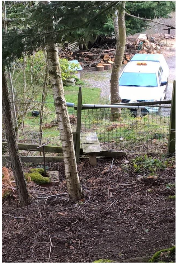
Photograph 16: Stile on Right of Way HB48 at Avielochan