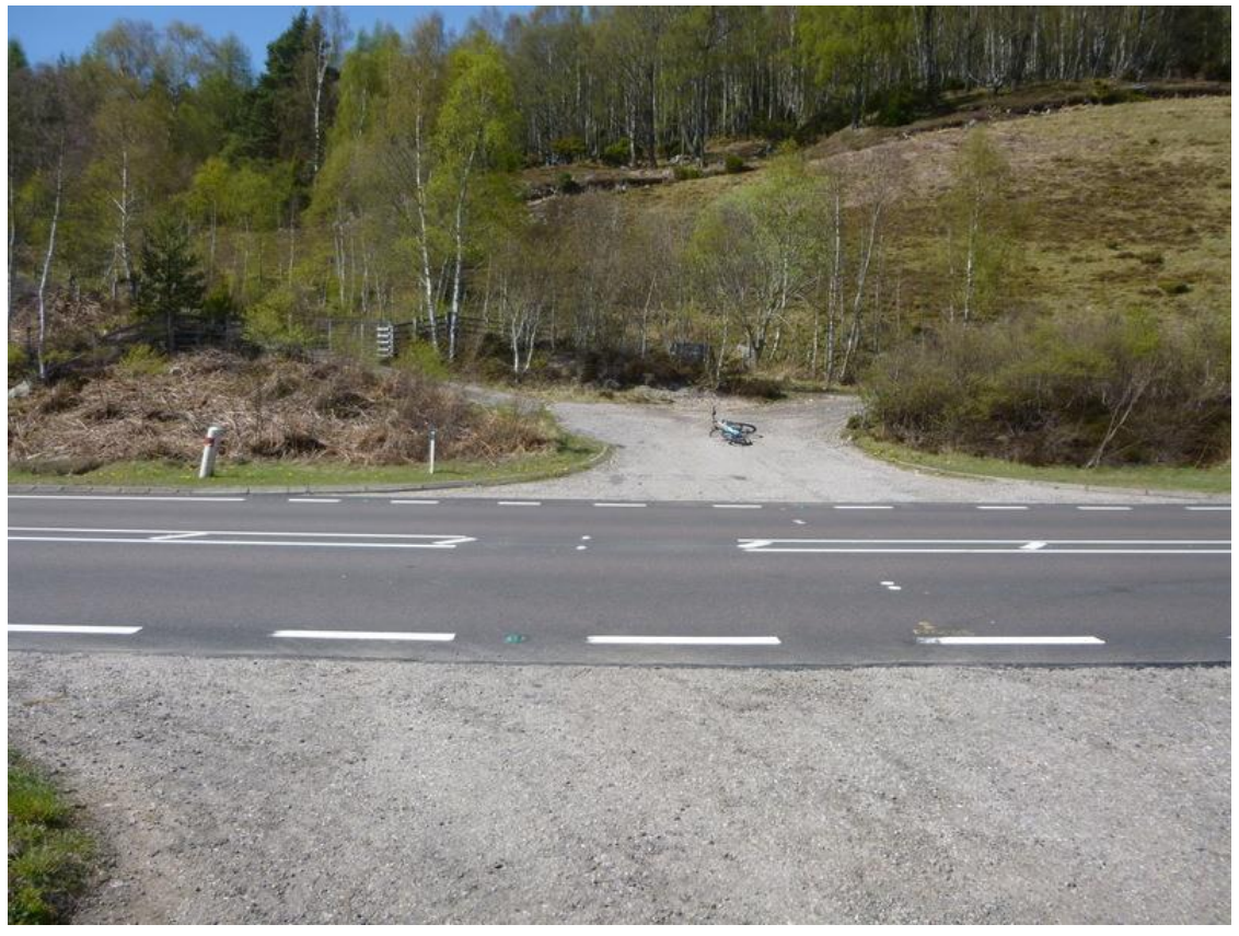
Photograph 28: at-grade crossing of the A9 on Other NMU Route 8