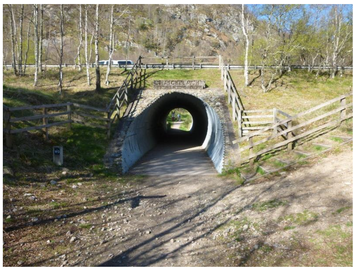
Photograph 4: NMU underpass to Craigellachie Nature Reserve at the intersection of LBS30 and LBS38