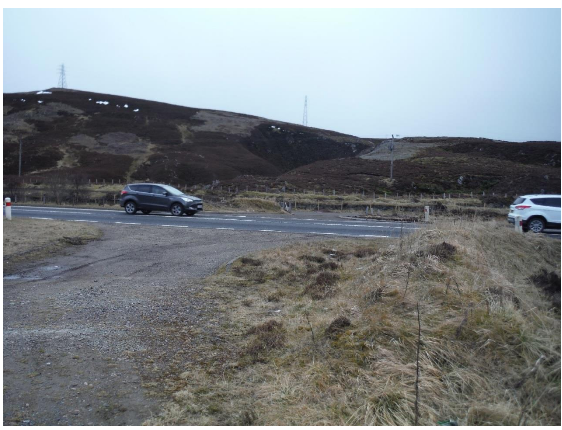
Photograph 21: at-grade crossing of the A9 at Slochd Summit