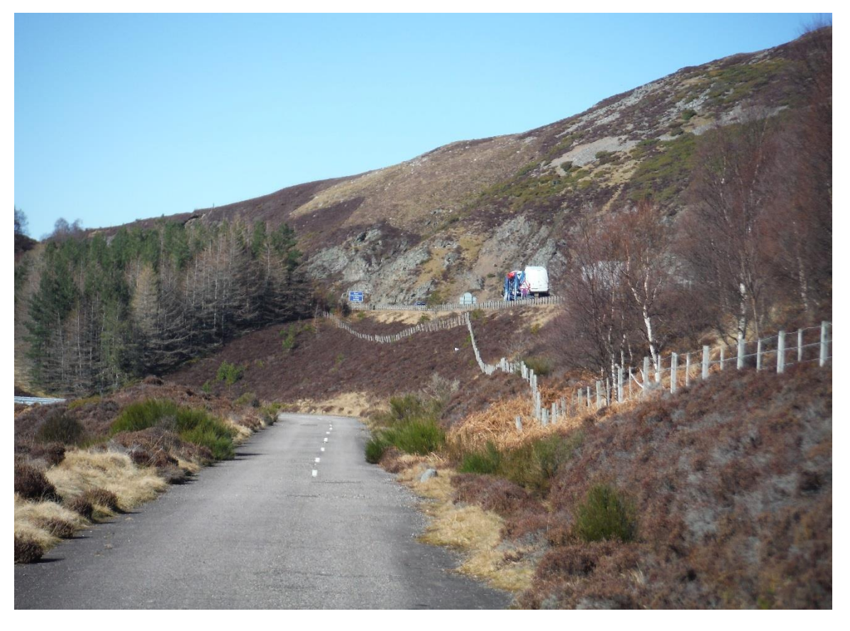
Photograph 10: NCN7 between Slochd Ski Centre and Slochd Summit