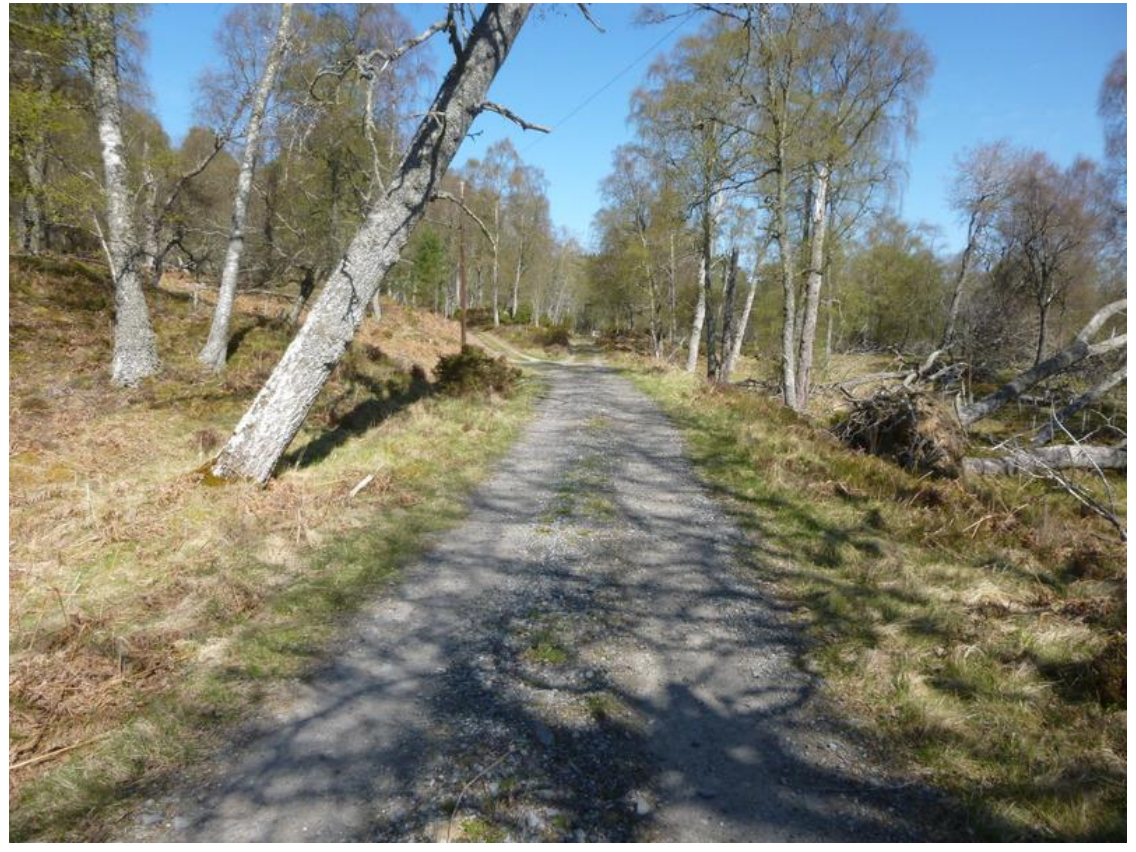
Photograph 18: HB47