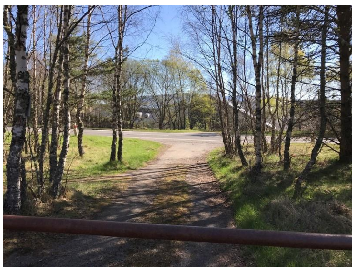
Photograph 5: End of Path within Craigellachie Nature Reserve at CP5 looking towards the A9 and MacDonald Highland Resort beyond