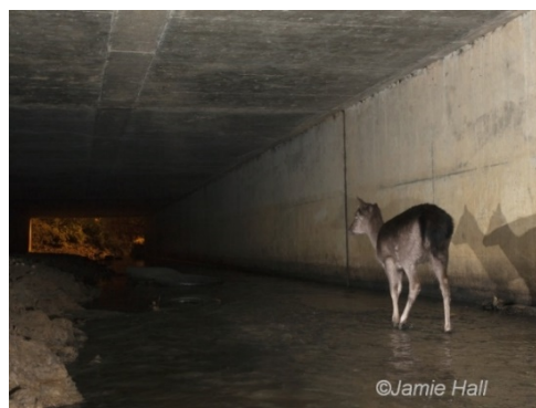
Figure 12.11.6: Fallow deer crossing box culvert underpass beneath 6-lane M25 Essex