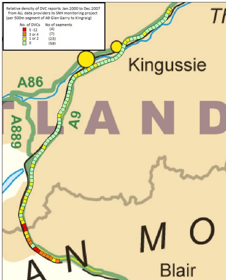
Figure 12.11.2: Heat map of relative DVC density by 500m sections of A9 Glen Garry to Kincaig 2000 to 2007