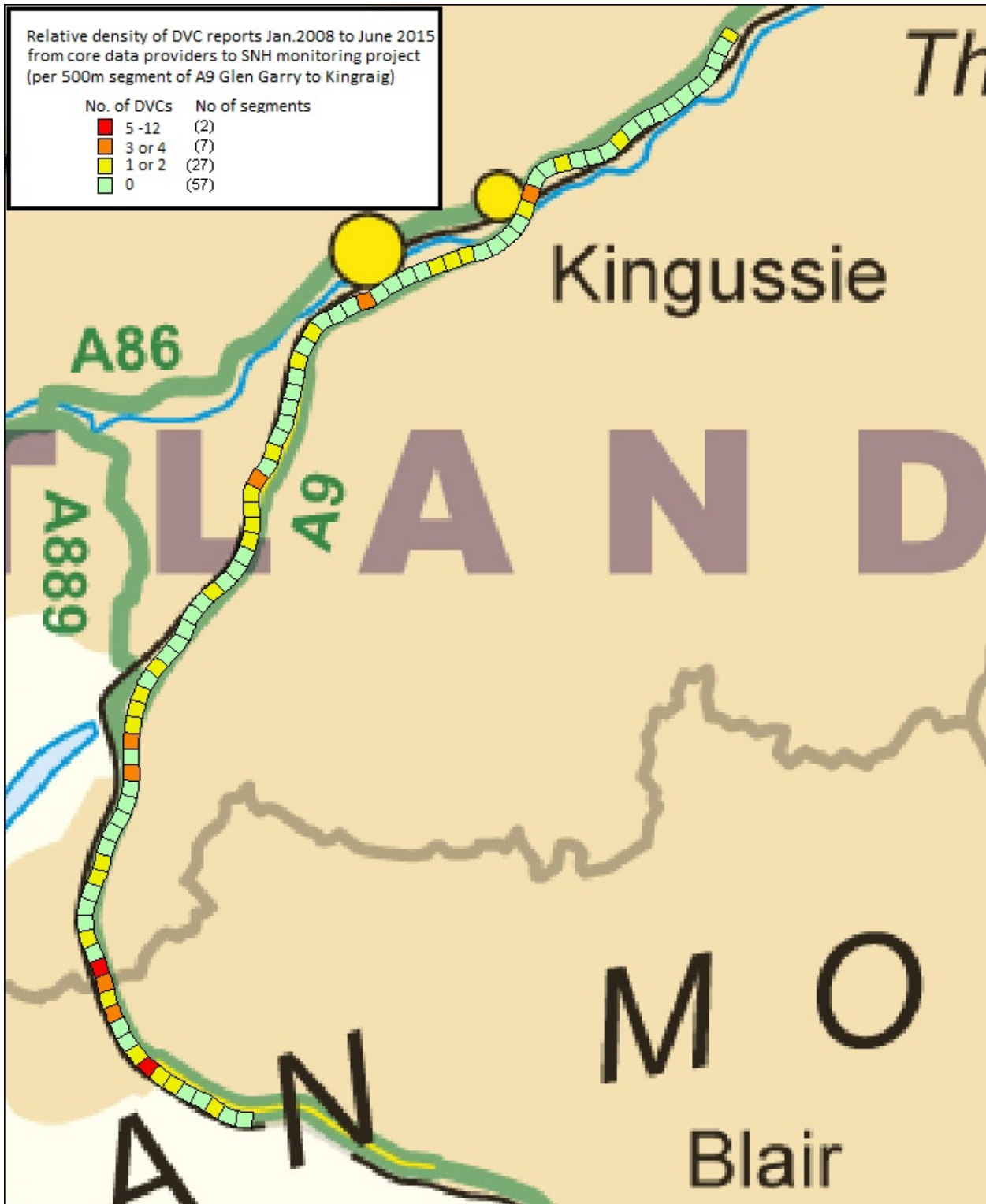
Figure 12.11.1: Heat map of relative DVC density by 500m sections of A9 Glen Garry to Kinraig 2008 to 2015