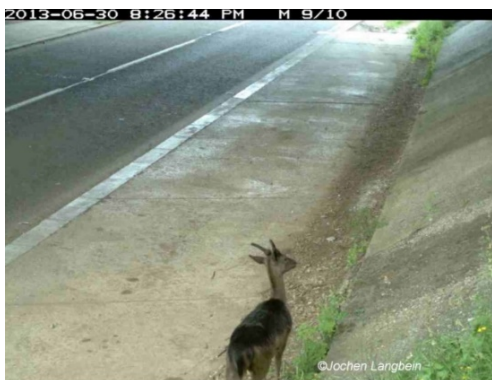
Figure 12.11.5: Fallow deer at slip road underpass beneath dual A38 trunk, Devon