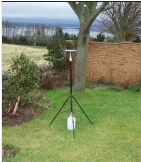
Figure 1: Example of an Installed Frisbee Gauge Meter