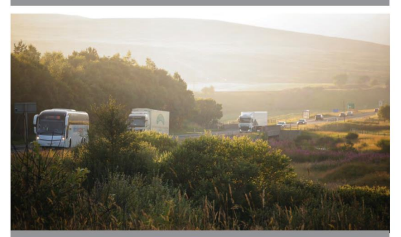
Dalmagarry Burn, looking north