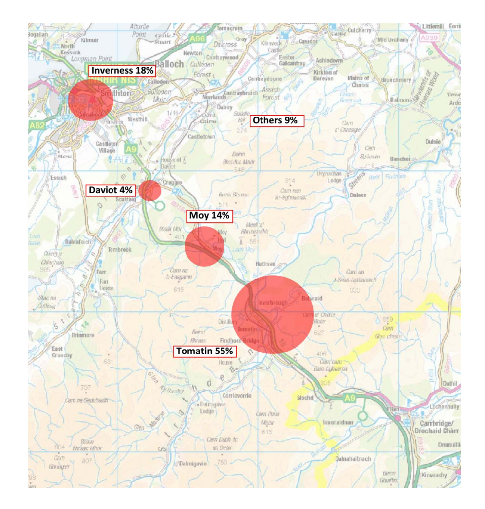
Figure 2-1 Attendance map

The geographic spread is shown in Figure 2-1.