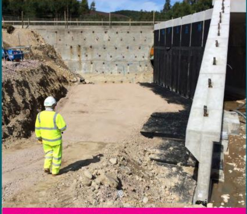
A9 Kincraig to Dalraddy – new culvert