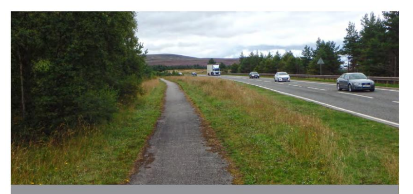
National Cycle Network (Route 7) alongside A9