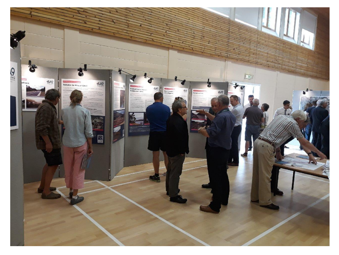
Photograph 1.3.1 – Exhibition Display Boards, Strathdearn Primary School