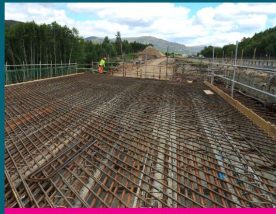
A9 Kincraig to Dalraddy – bridge deck