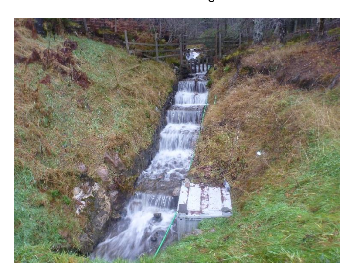
Figure 6-1 Existing cascade at Southern Avie Lochan Burn (P1040794)

6.2.1. SEPA's guidance on river crossings<sup>xiii</sup> identifies the need to explore opportunities for potential improvements when upgrading or replacing an existing crossing. This includes providing fish and mammal passage where a crossing forms a barrier. The local district salmon fishery board and local fisheries trusts can advise on fish populations present (native as well as non-native) and any potential impacts of removing or improving an existing barrier. This is particularly relevant to water bodies River Dulnain-Feith Mhor (23113) and Allt na Fearna [sic] – upstream Loch Alvie (23126) where the overall WFD status is Poor because of the obstacles to fish migration.