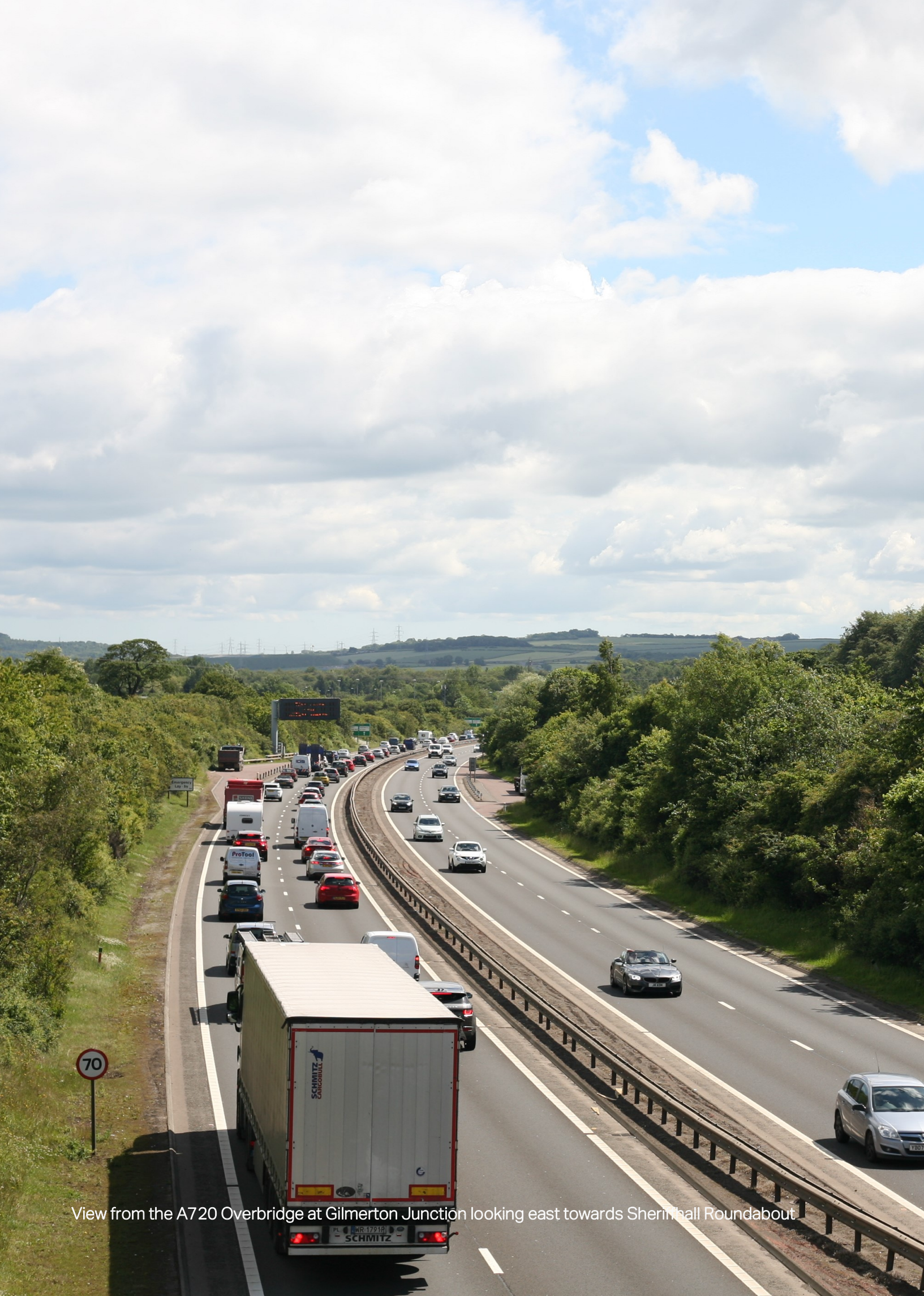
View from the A720 Overbridge at Gilmerton Junction looking east towards Sheriffhall Roundabout