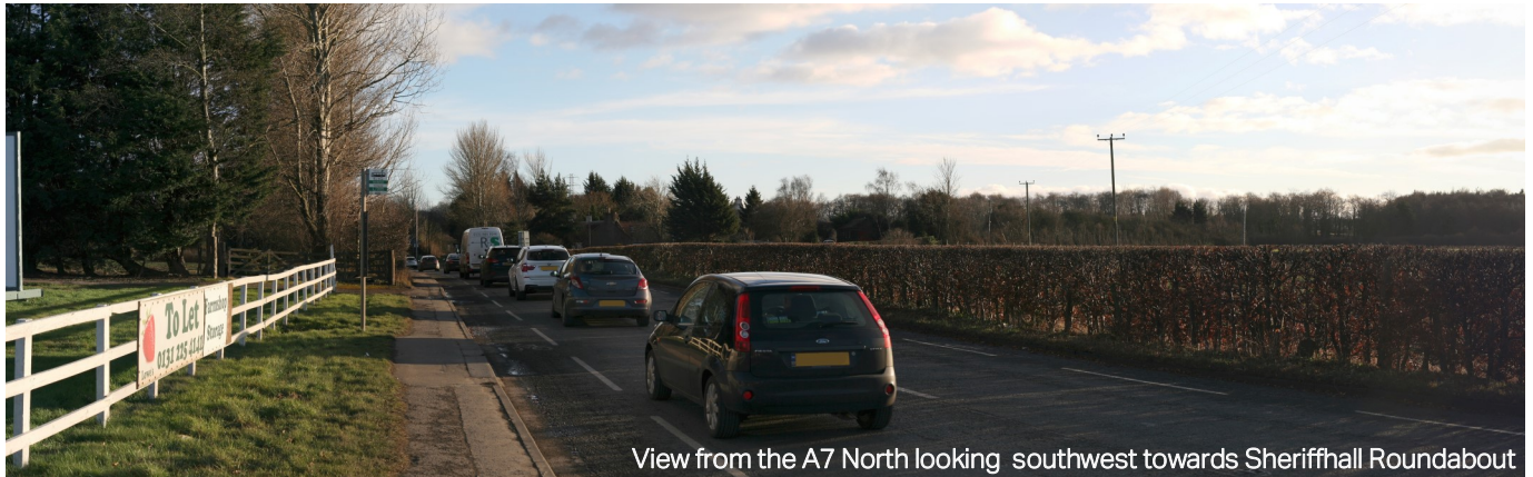
View from the A7 North looking southwest towards Sheriffhall Roundabout

arising from the construction of the Proposed Scheme can be mitigated through additional archaeological investigation within the Proposed Scheme Extents.