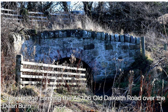
Stone bridge carrying the A6106 Old Dalkeith Road over the Dean Burn

conservation within 2km of the Proposed Scheme and a number of areas of ancient woodland.