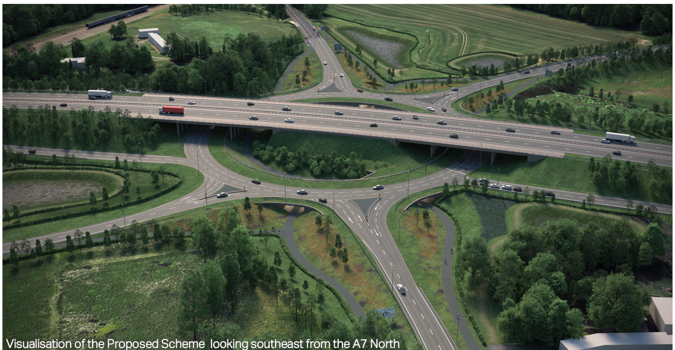
Visualisation of the Proposed Scheme looking southeast from the A7 North

The South East Scotland Strategic Development Plan (SDP) (SESplan, 2013) identifies the grade-separation of Sheriffhall Roundabout as a key infrastructure project to support economic growth