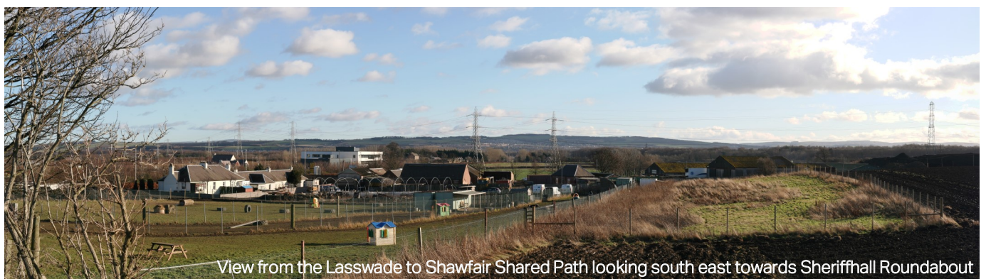
View from the Lasswade to Shawfair Shared Path looking south east towards Sheriffhall Roundabout

Proposed mitigation measures will minimise greenhouse gas (GHG) emissions. These include sustainable reuse of soils and aggregate, reuse (where possible) of materials and waste generated