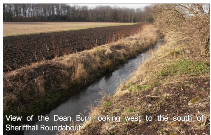
View of the Dean Burn looking west to the south of Sheriffhall Roundabout