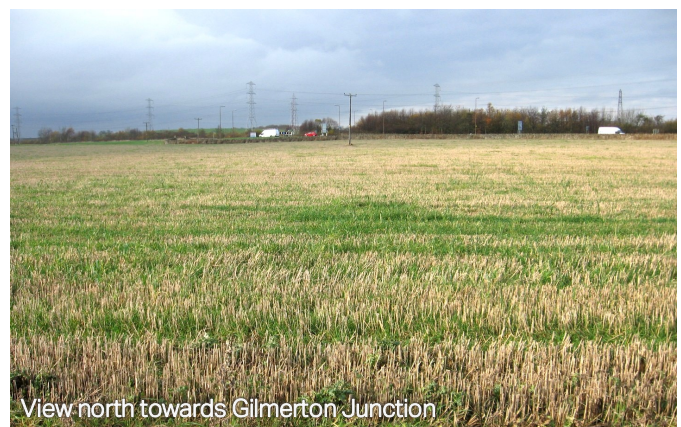
View north towards Gilmerton Junction