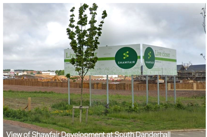
View of Shawfair Development at South Danderhall