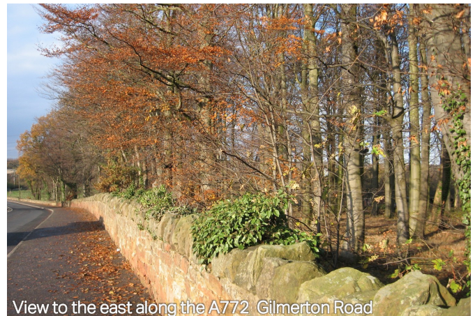
View to the east along the A772 Gilmerton Road

Due to the current low speeds and high levels of traffic moving through the existing Sheriffhall Roundabout there will be a neutral effect on driver stress during construction. During operation, the A720 will see a moderate beneficial effect on the driver stress of vehicle travellers during peak periods. There will be a slight beneficial effect on the driver stress of vehicle travellers on the A6106 North and the A7 North during peak periods;