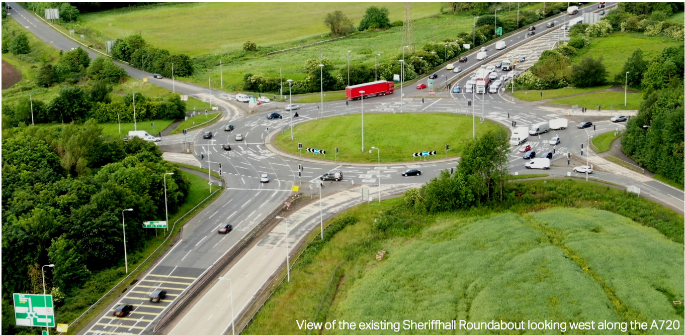
View of the existing Sheriffhall Roundabout looking west along the A720

approval to the Scottish Ministers through the Roads (Scotland) Act 1984 [as amended]. If approved construction is anticipated to last approximately 28 months.