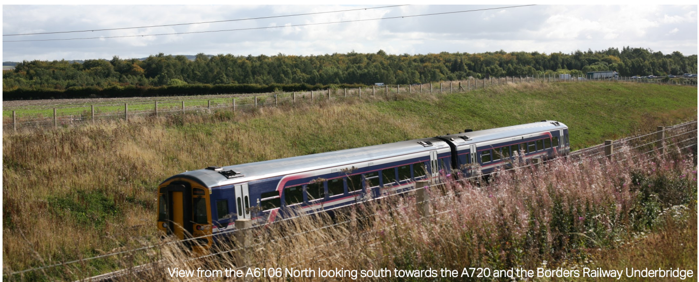
View from the A6106 North looking south towards the A720 and the Borders Railway Underbridge

The Proposed Scheme will cause a small/imperceptible worsening in local air quality at most locations, due to the increase in vehicle flows (and emissions) on the local road network. This effect is not considered significant as the change in air quality predicted does not cause an exceedance of the air quality objective values, nor does it occur at locations that are already above the air quality