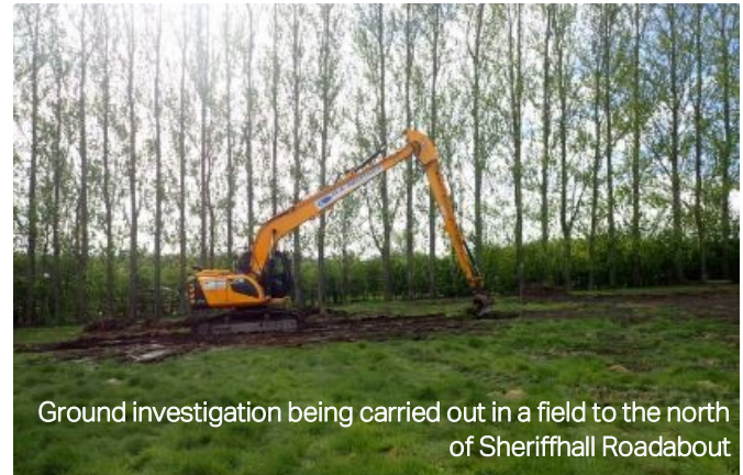
Ground investigation being carried out in a field to the north of Sheriffhall Roadabout

The Proposed Scheme will result in the realignment of accesses to four residential properties and seven agricultural field accesses (affecting three separate landowners). Negligible permanent alterations to accesses at two residential properties will result in slight adverse effects. There will be slight adverse effects on five of the field accesses and a moderate adverse effect on access to one parcel of land which is being moved from the A6106 South to the A7 South. There will be a slight adverse effect on