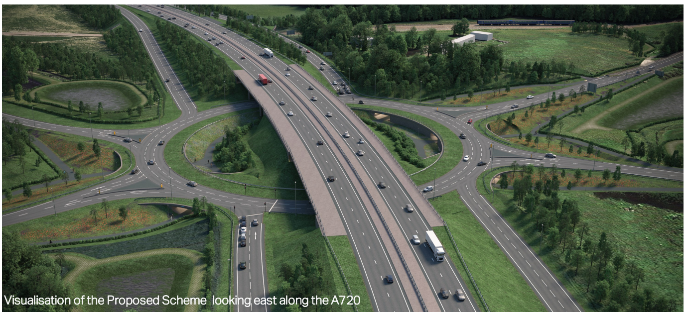
Visualisation of the Proposed Scheme looking east along the A720

No significant cumulative impacts of the Proposed Scheme in combination with other developments are expected.