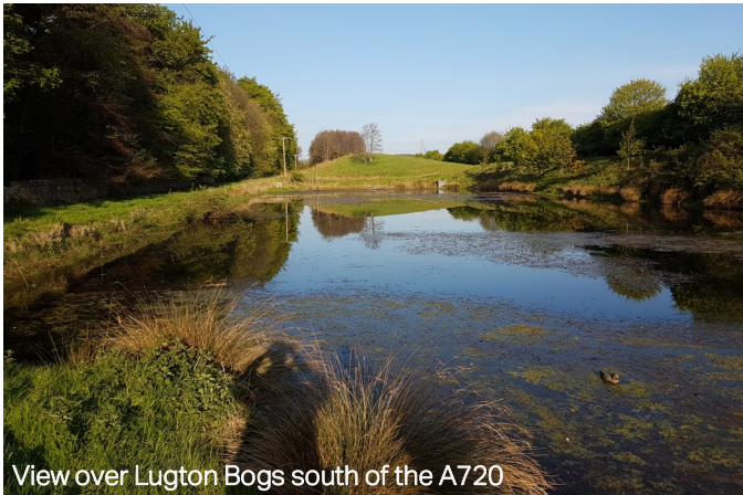
View over Lugton Bogs south of the A720