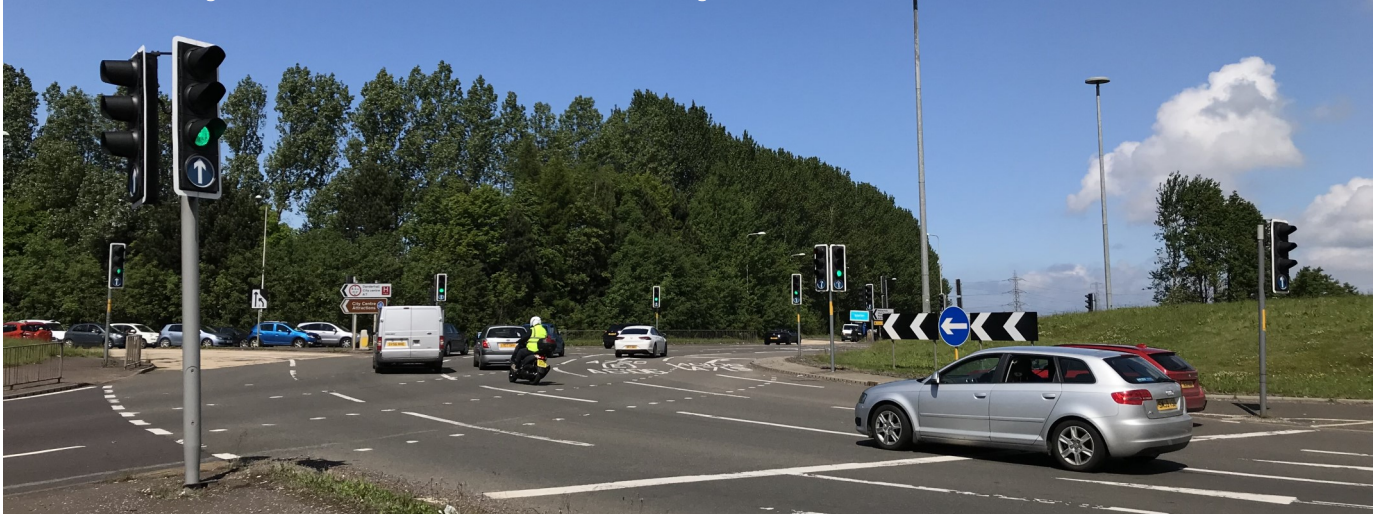
View of the existing Sheriffhall Roundabout from the A720 looking east towards the A7 and A6106 North

Further design development was then undertaken and the environmental, engineering, economic and traffic effects of each of the remaining options were considered (with one being discounted early due to not sufficiently meeting the scheme objectives). The remaining three options were then assessed in more detail and against the scheme objectives, environmental impact, safety, traffic operation, cost and ease of construction. The overall assessment concluded that the 'preferred option' (now the Proposed Scheme) provided the best balance of benefits across the full range of