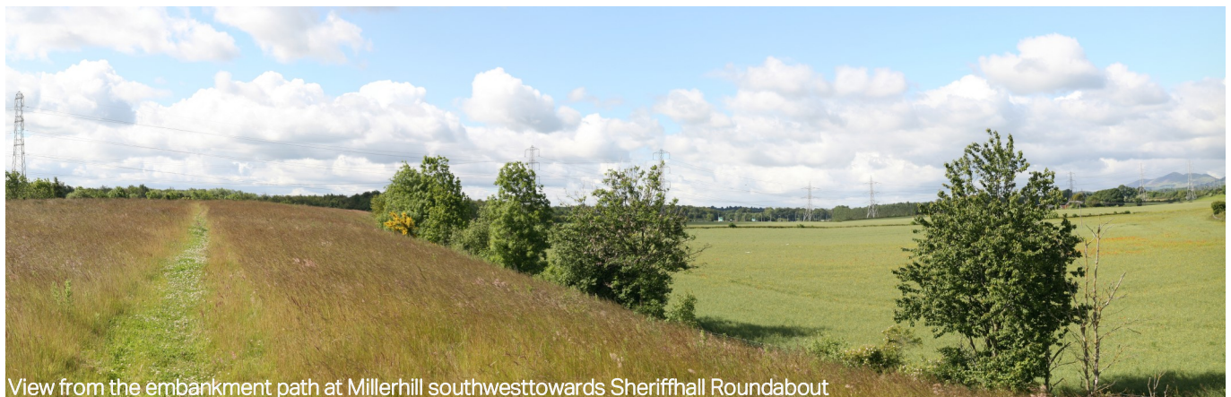
View from the embankment path at Millerhill southwest towards Sheriffhall Roundabout

There are four locally important sites for nature