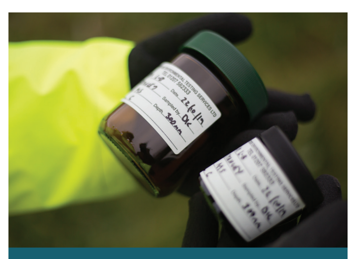
Soil samples bottled and ready for testing