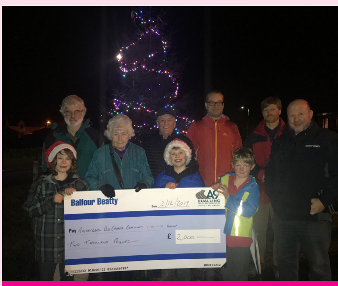
Local residents accept donation at Christmas light switch on event

benefit from the activities and facilities associated with the restored church tower. The project aims to commence in Spring 2020, subject to funding.