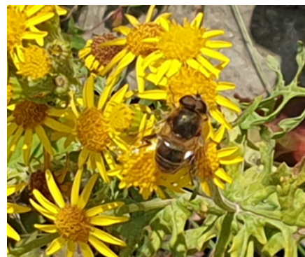
Honeybee enjoying the wildflowers on site

We recently dedicated an area where we discovered a variety of wildflowers growing onsite as a temporary pollinator friendly area. Recently spotted were some honeybees, and some beautiful butterflies all thriving in the undisturbed area.