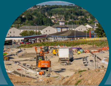
Kerbing, ducting and drainage installation on the site