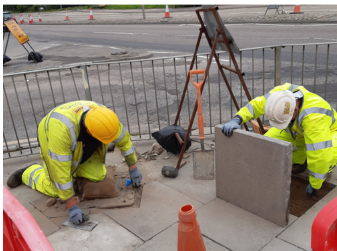
Realigning slabs after flooding on the 12 August