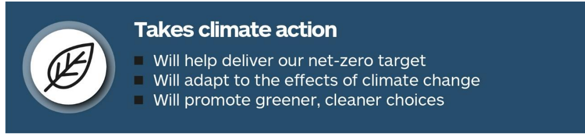
Figure 3: Takes Climate Action outcomes

We face a global climate emergency. We need to aim for a transport system that encourages people to make travel choices that minimise the long-term impacts on our climate and that will increase the wellbeing of future generations. Scotland must transition to a net-zero emissions economy for the benefit of our environment, our people and our future prosperity.