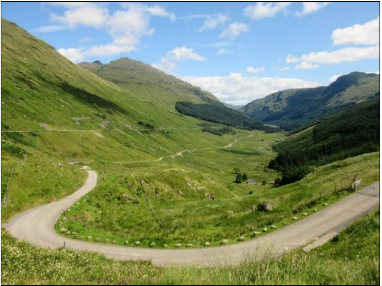
Image 5.2: The Glen Croe Corridor from the Rest and Be Thankful Viewpoint