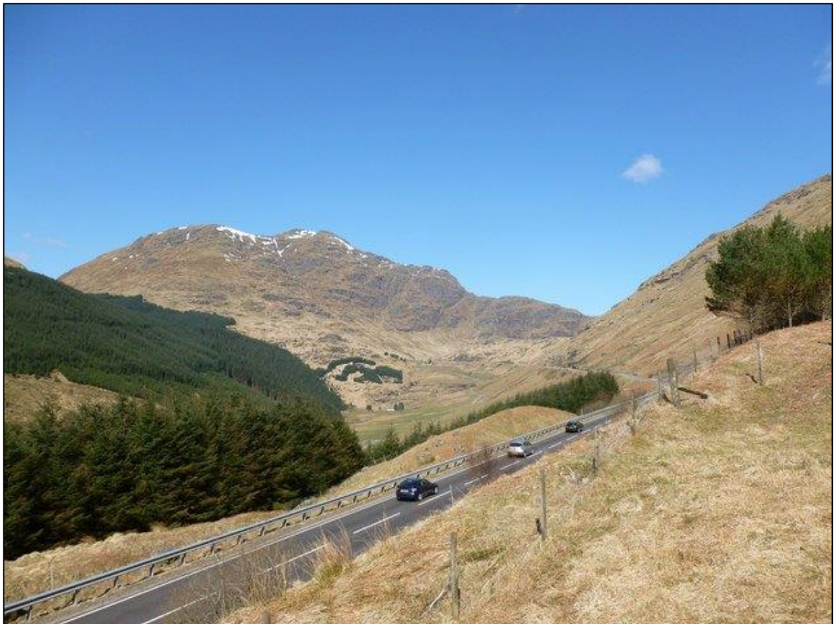
Image 5.1: Existing A83 Trunk Road within the Glen Croe Corridor

5.1.5 The recommended corridor, corridor 1, generally follows the existing A83 Trunk Road, starting just south east of the junction between the A83 Trunk Road and the Old Military Road. It typically follows the route of the existing A83 Trunk Road as it rises through Glen Croe and then past Loch Restil. The corridor ends where the A83 Trunk Road passes by the south west end of Glen Kinglas. The corridor is approximately 6 km long and is shown in Images 5.1 and 5.2.