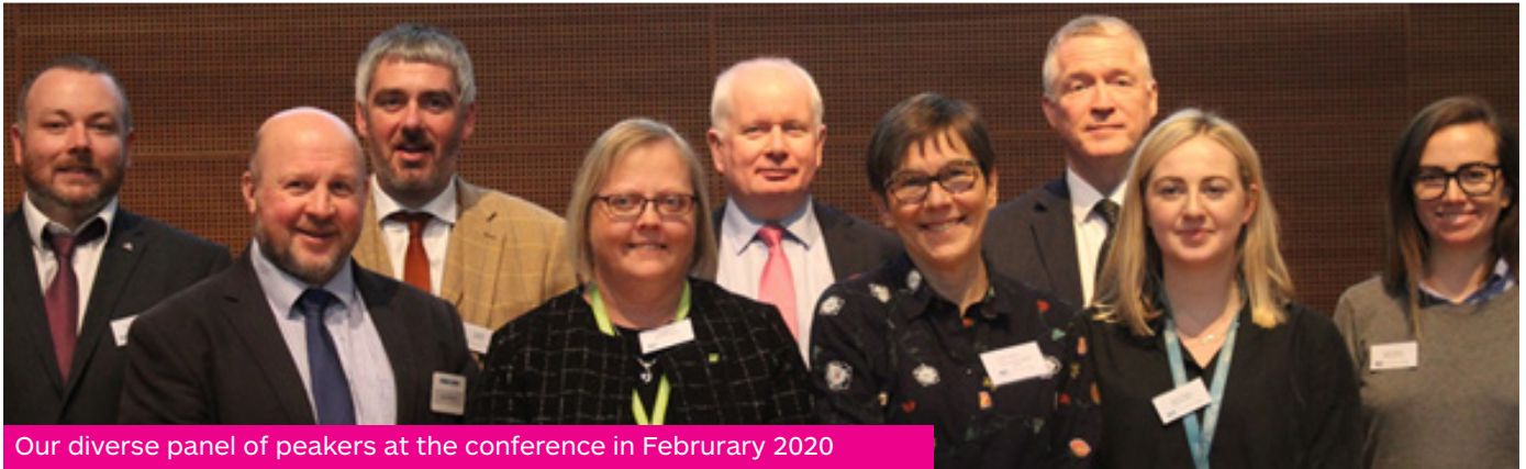
Our diverse panel of speakers at the conference in February 2020

The Community Benefits Conference 2020 aimed to celebrate the success of the A9 Dualling: Luncarty to Pass of Birnam Project in 2019 and looked forward to what could be achieved in 2020. In particular, it gave us the opportunity to explore how our project team could work more collaboratively with our community partners to maximise opportunities and deliver a legacy that each of us can be proud to have played a part in.